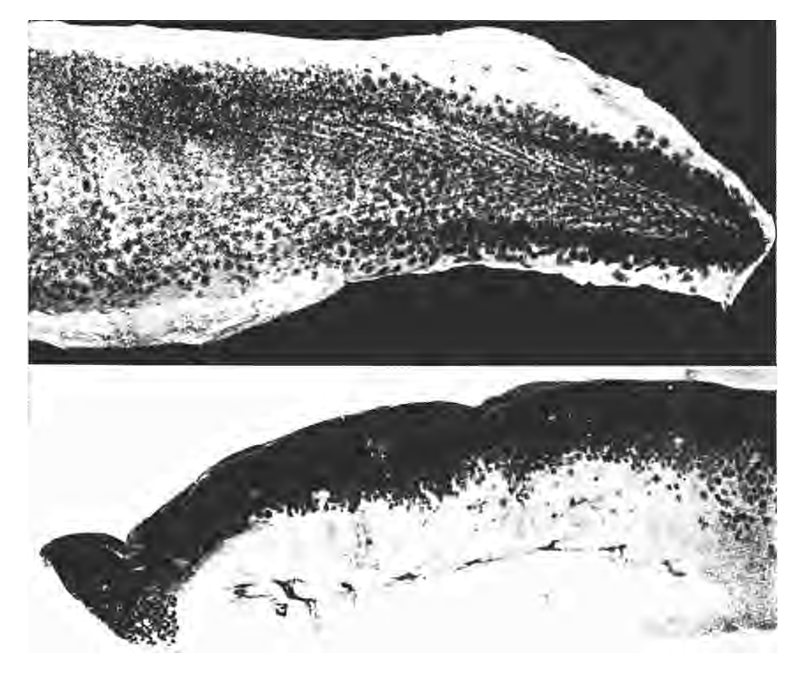
Figure 3. Enlargements of the head and tail regions of an ammocoete of Entosphenus hubbsi , new species, 160 mm.

number of tentacles was 9-15 (mean 12.5). In one specimen of E. lethophagus , and one of E. minimus , we counted only seven tentacles; however, in E. minimus the range is 5-7 according to Bond ( pers. comm. ). In three specimens of E. hubbsi , we found only three tentacles in each.