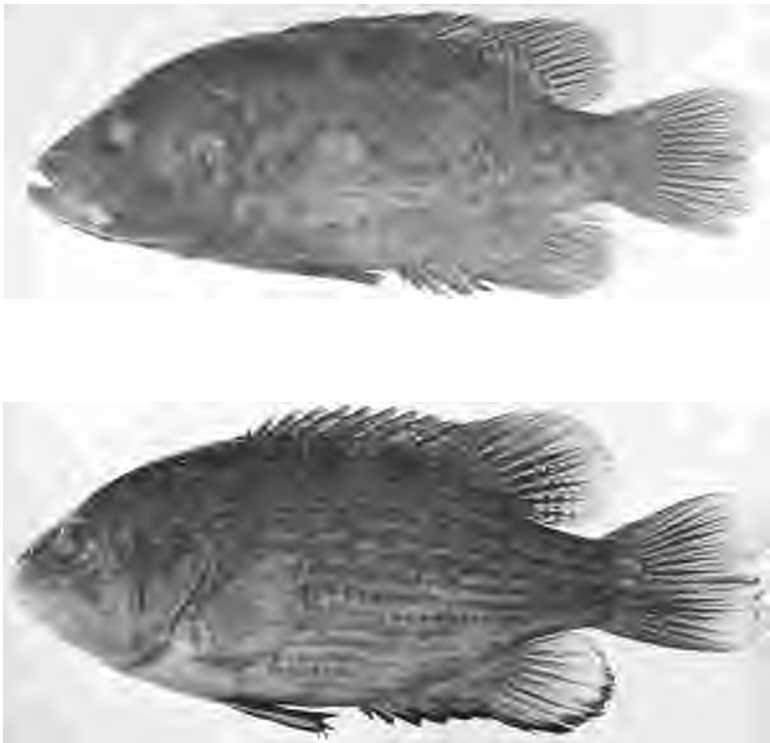
Fig. 1.—Top. Ambloplites constellatus , n. sp. Holotype, adult male, 186 mm in standard length, from Buffalo River at mouth of Rush Creek, 3.2 km ESE Rush, Marion Co., Arkansas (TU 90909). Bottom. A. rupestris , adult male, 160 mm in standard length, Tennessee River drainage, Cherokee Co., North Carolina (TU 32786)

Ambloplites constellatus , sp. nov. Ozark rock bass. Figs. 1 and 2