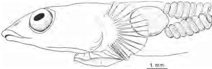
FIG. 1. Anterior part of Parvicrepis parvipinnis , showing trunk of Impexus hamondi protruding from its left flank.

Lernaeoceridae. It became necessary to erect a new genus to accommodate it in the family, to which it indubitably belongs. The small size and the fragility of the specimen made the description and even finding of the appendages impossible. The diagnosis, therefore, was based entirely on the distinctive gross morphology of the parasite.