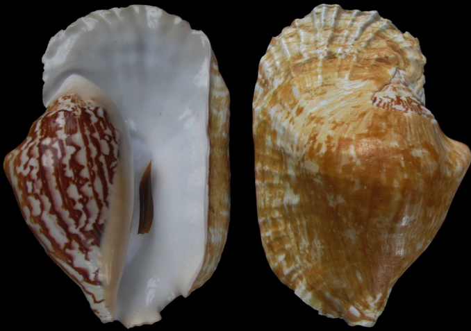
Widest Pacific Conch Sinustrombus latissimus (Linnaeus, 1758)