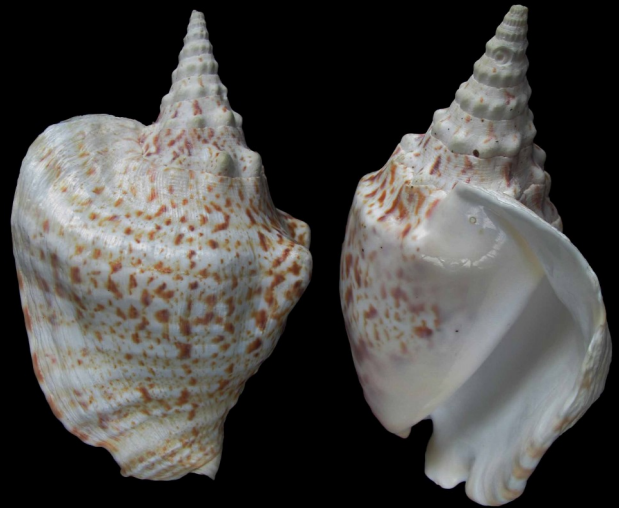
Thersite Stromb Thersistrombus thersites (Swainson, 1823)

Okinawa, Japan 188 mm w/op Delicate thin lip