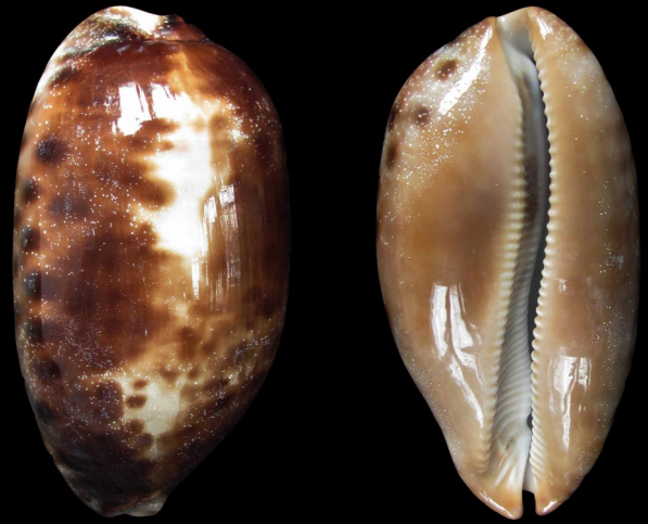
Tortoise Cowrie Chelycypraea testudinaria (Linnaeus, 1758)