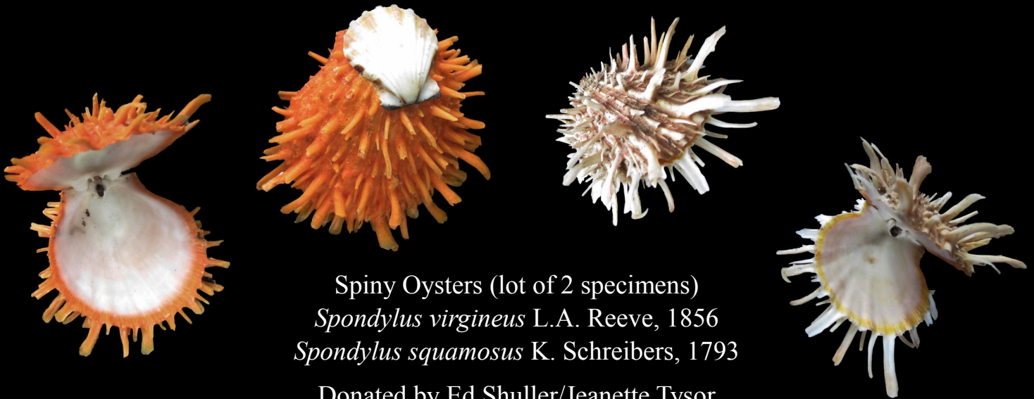
Spiny Oysters (lot of 2 specimens) Spondylus virgineus L.A. Reeve, 1856 Spondylus squamosus K. Schreibers, 1793