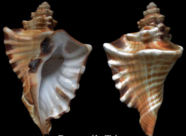
Ranzani's Triton Cymatium ranzani (Bianconi, 1851)