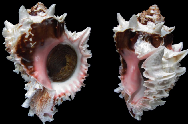
Regal Murex Hexaplex regius (Swainson, 1821)