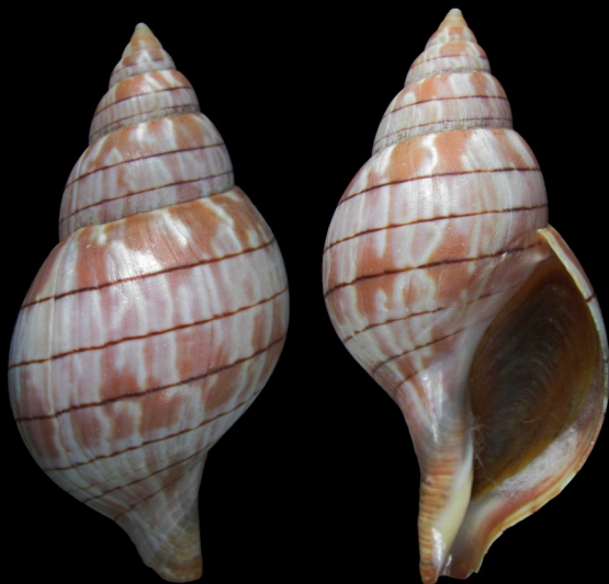
68 mm w/op