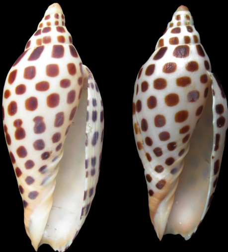
Junonia (lot of 2 specimens) Scaphella junonia (Lamarck, 1804)