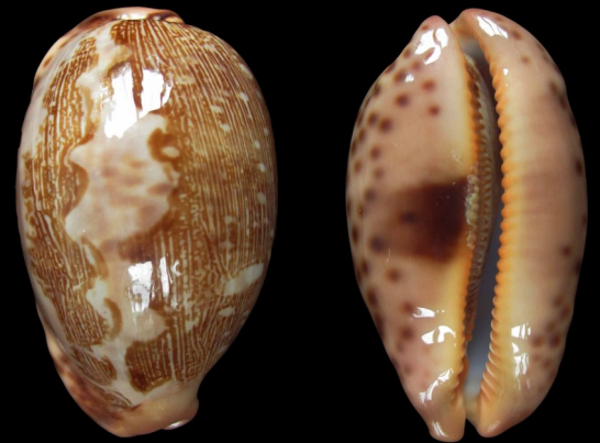
Map Cowrie Leporicypraea mappa (Linnaeus, 1758)