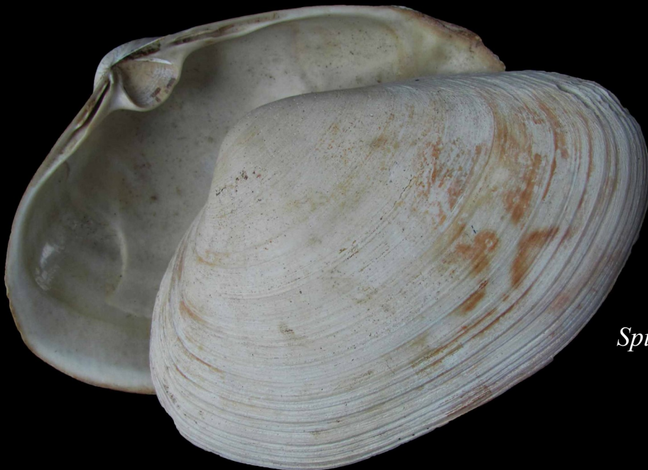
Atlantic Surf Clam Spissula solidissima (Dilwyn, 1817)

Note: These are less than perfect specimens. Within recent memory any one of these shells would have been a most prized addition to our cabinets. The species presents an example where enterprising fishermen figure out how to bring lots of something formerly rare to the market. Fine, extra-large examples sell for a premium but still at a fraction of former prices. I can attest that there is a certain excitement to simply holding three of these in hand at one time even if there are better examples in my cabinet. They may be relatively common now, but the legend lives on.