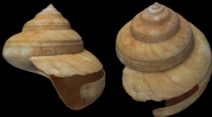
African Slit Shell Bayerotrochus teramachii (Kuroda, 1955)

Donated By Everett Long Oman 154 mm ex. Bosch collection