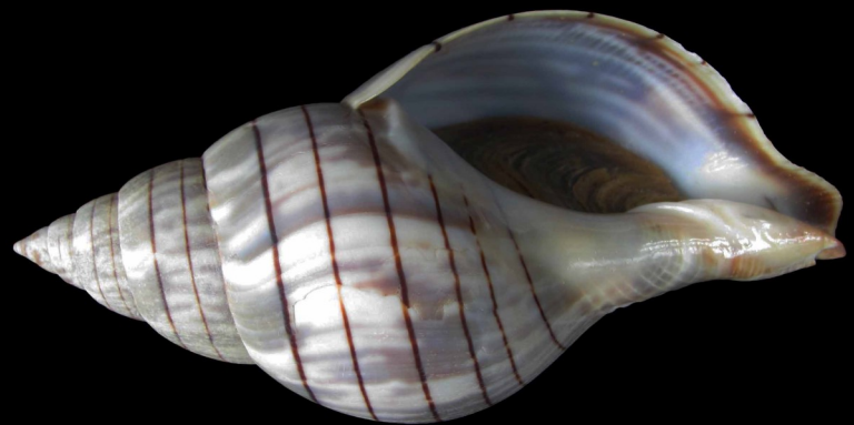
98 mm w/op