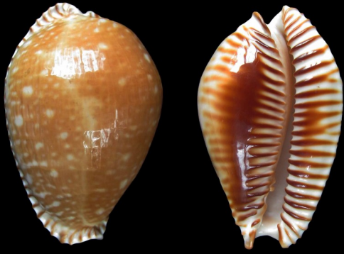
Great Spotted Cowrie Perisserosa guttata (Gmelin, 1791)