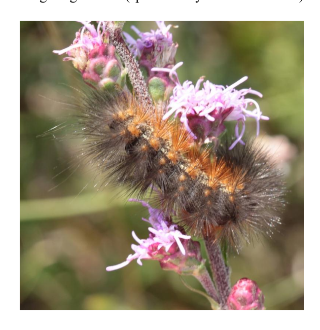
Grammia sp. caterpillar