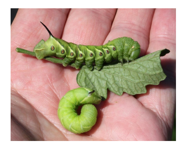
Five-spotted hawk moth or tomato hornworm caterpillars

Great ash sphinx (Sphinx chersis) Laurel sphinx (Sphinx kalmiae) Vashti sphinx (Sphinx vashti)