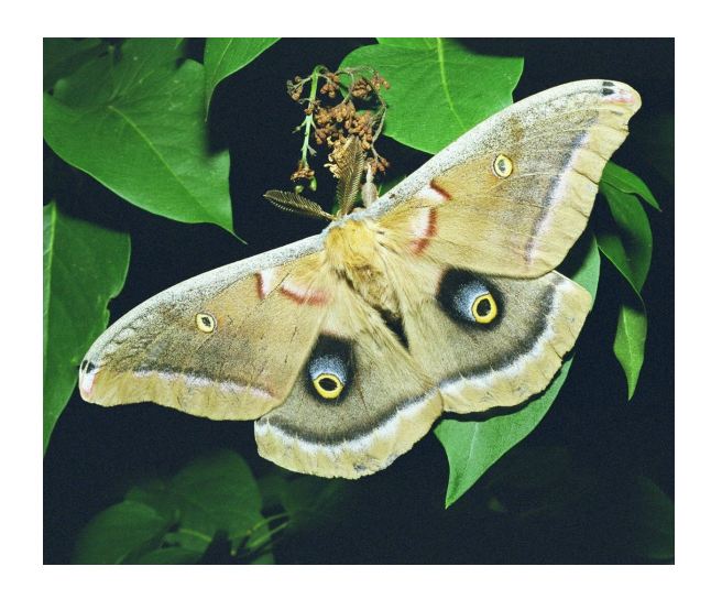
Polyphemus moth