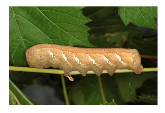
Above and below are variations of Pandora sphinx caterpillars