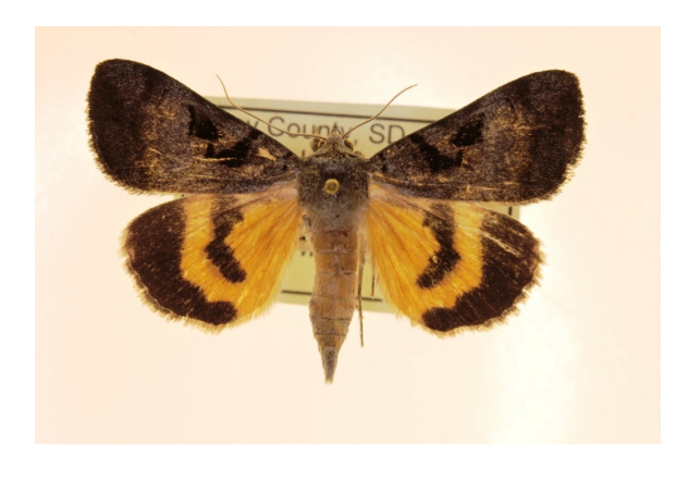
Whitney's underwing (specimen by Dennis Skadsen)

Darling underwing (Catocala cara) Sleepy underwing (Catocala concumbens) Woody underwing (Catocala grynea) Betrothed underwing (Catocala innubens) Mother underwing (Catocala parta) Ultronia underwing (Catocala ultronia) Whitney's underwing (Catocala whitneyi)