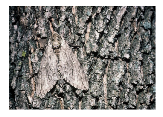
Underwing moth at rest