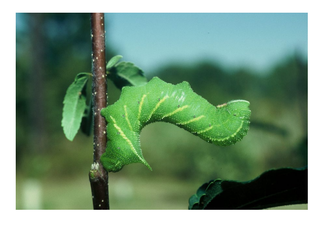
Twin-spotted sphinx caterpillar