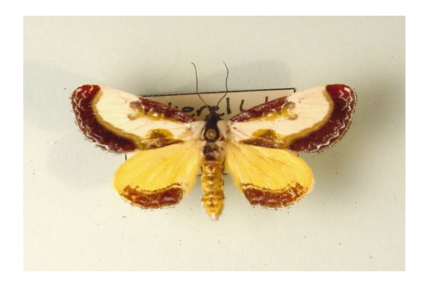
Beautiful wood-nymph (specimen by Dennis Skadsen)

Beautiful wood-nymph (Eudryas grata) Pearly wood-nymph (Eudryas unio)