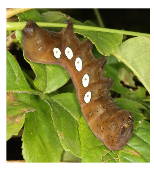
Bumblebee clearwing/Snowberry clearwing (Hemaris diffinis) Spurge hawk moth (Hyles euphorbiae) Bedstraw sphinx (Hyles gallii) White-lined sphinx (Hyles lineate) Five-spotted hawk moth (Manduca quinquemaculatus) Big poplar sphinx (Pachysphinx modesta) Blinded sphinx (Paonias excaecatus) Small-eyed sphinx (Paonias myops) Willow-herb day-sphinx (Proserpinus juanita)