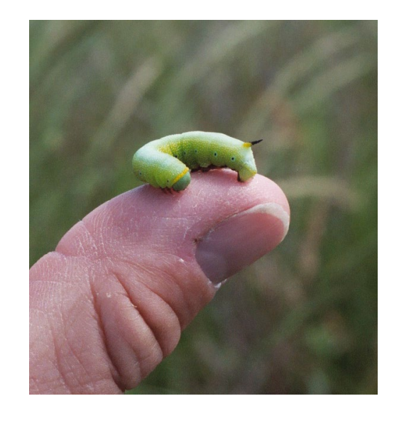
Bumblebee clearwing caterpillar