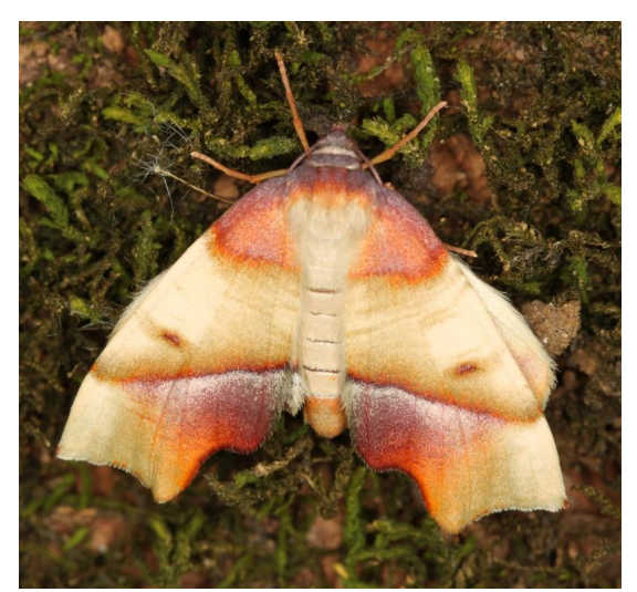
Straight-lined plagodis

Scallop moth (Cepphis armataria) Maple spanworm (Ennomis magnaria) The beggar (Eubaphe mendica) Johnson's euchlaena (Euchlaena johnsonaria) Saw-wing (Euchlaena serrata) Mottled euchlaena (Euchlaena tigrinaria) Snowy geometer (Eugonobapta nivosaria) Confused eusarca (Eusarca confusaria)