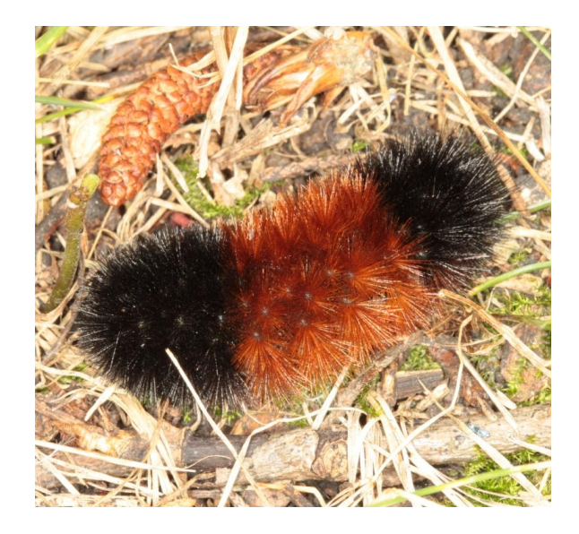
Woolly bear caterpillar

Confusing haploa (Haploa confusa) LeConte's haploa (Haploa lecontei) Ruby tiger moth (Phragmatobia fuliginosa) Lined ruby tiger moth (Phragmatobia lineata)