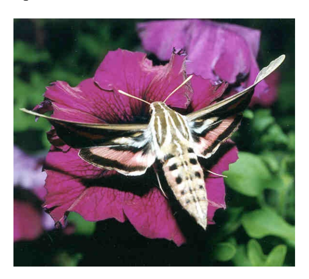
White-lined sphinx moth

The sphingidae are one of the better known and identifiable moth families. Several sphinx moths fly during the daytime. The White-lined sphinx (shown above) is sometimes mistaken for a hummingbird when observed feeding on petunias and other flowers. The Bumblebee or Snowberry clearwing (shown on page 4) mimics a bumblebee to gain protection from predators. Several other diurnal moth's