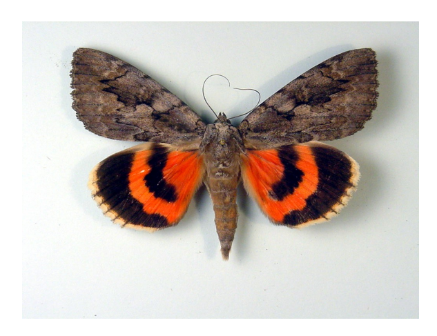
Sweetheart underwing (specimen by Dennis Skadsen)

Short-lined chocolate (Argyrostis anilis) Canadian owlet (Calyptra canadensis) Green leuconycta (Leuconycta diptheroides) Hitched arches (Melanchra adjuncta) Owl moth (Thysania zenobia)