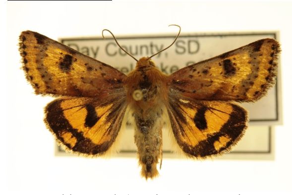
Orange phlox moth (specimen by Dennis Skadsen

Orange phlox moth (Heliothis acesias) Prairie-sage flower moth (Schinia cumatilis)