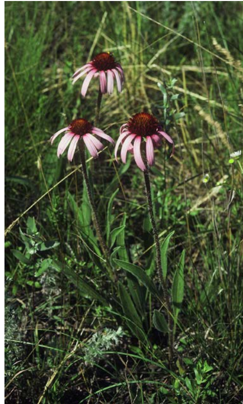
Narrow-Leaved Purple Coneflower