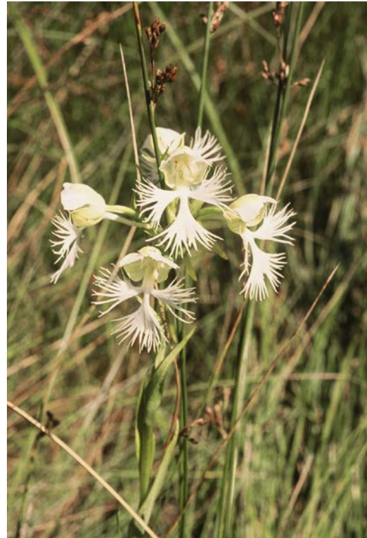
Western Prairie Fringed Orchid