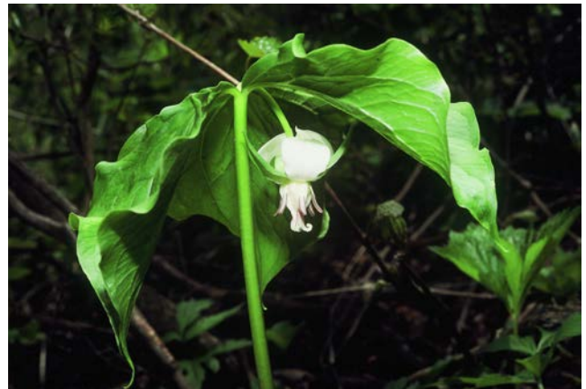
Whip-Poor-Will-Flower (Nodding trillium)

Trillium cernuum Whip-Poor-Will-Flower (Nodding trillium)