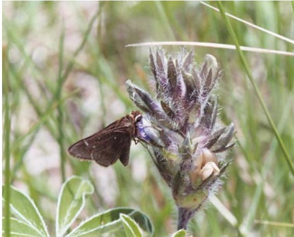
Dusted skipper feeding on Indian Breadroot

Pediomelum argophyllum Silver-Leaf Indian Breadroot Pediomelum esculentum Large Indian- Breadroot (Prairie turnip)