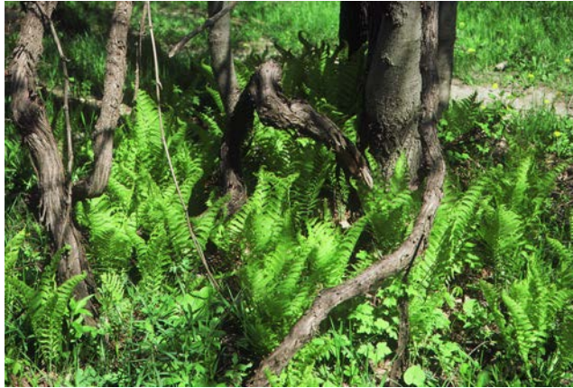
Ostrich Ferns, Munson Gulch

The plants listed and shown below occur in the woodlands and forests of northeast South Dakota. Ecologists have classified the larger forest communities of northeast South Dakota as Northern Bur Oak Mesic and Plains Basswood forests. These two forest communities are found in the coulees located along the eastern slope of the coteau in Marshall and Roberts Counties including Sica Hollow State Park. Smaller forests with these plant communities are found at Hartford Beach State Park, and the Hatchery Creek Public Access on Pickerel Lake. Another forest community Bur Oak Savannah is found on the Waubay National Wildlife Refuge. Most woodland wildflowers bloom from late April through May before the trees canopy.