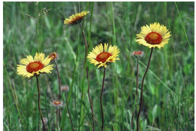
Common Blanket Flower

Obviously the best and most enjoyable times to observe wildflowers are during the season in which they are in bloom. In northeast South Dakota most of our native prairie forbs blossom from mid-June through early September. These are the warm season species that take advantage of cool wet springs to develop and mature during the usually warm dry days of summer. Most of these warm season species are in bloom by early July. These include some of the showiest and easiest species to identify; yarrow, leadplant, yellow evening primrose, prairie clovers, coneflowers, and the wild lily. As these species fade by late July, whole new sets of plants begin to color the prairie. By late August the milkweeds, goldenrods, asters, gentians, and gayfeathers are in bloom. During May and early June,