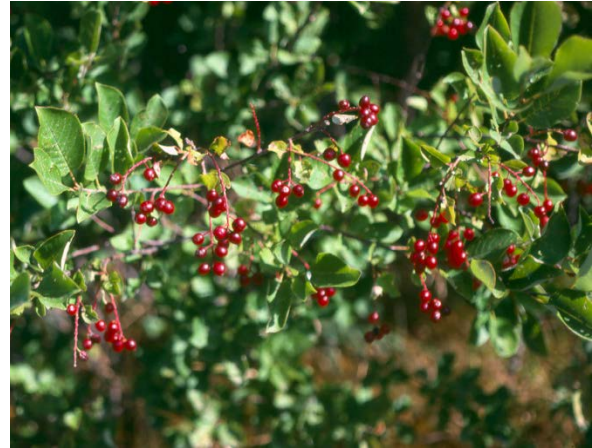
Choke-Cherry fruit

Populus tremuloides Quaking Aspen Prunus americana Wild Plum Prunus virginiana Choke-Cherry Quercus macrocarpa Bur-Oak Rhus glabra Smooth Sumac Ribes americanum Wild Black Currant Ribes cynosbati Eastern Prickly Gooseberry