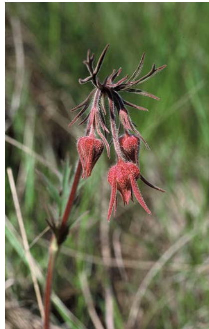
Prairie Smoke