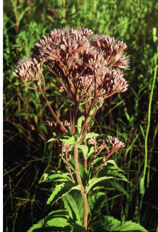
Joe-Pye Weed

The touch-me-nots grow along the edges of woodland streams and springs. Ruby-throated hummingbirds are often observed sipping nectar from these flowers at Sica Hollow and Hartford Beach State Parks, July through September.