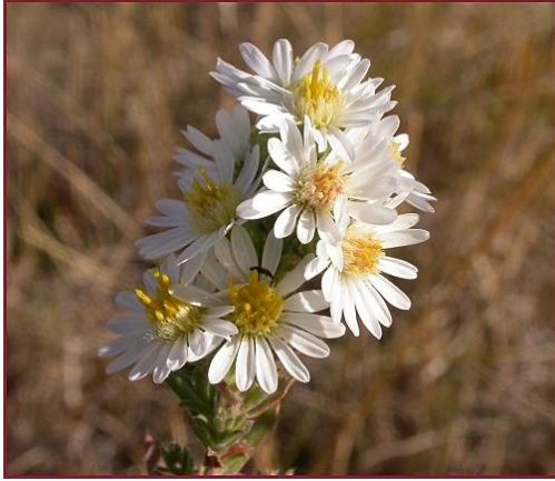
White Heath Aster