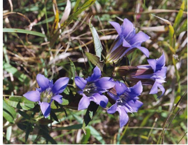
Downy Gentian

Gaura coccinea Scarlet Beeblossom (gaura)