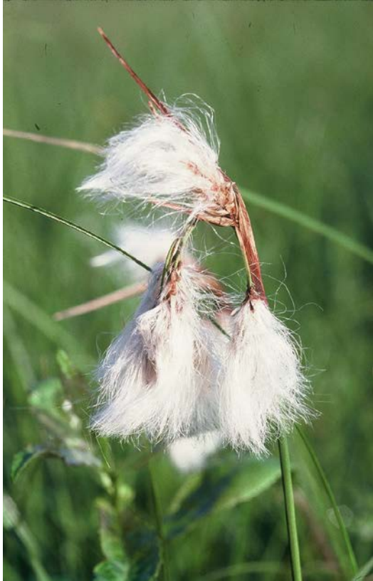
Narrowleaf Cottonsedge