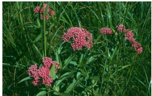
Swamp Milkweed