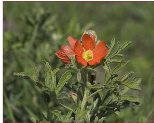
Scarlet Globemallow

Brown (2006) lists three species of Spiranthes as occurring in northeast SD. All bloom from late August through September. First two listed species often hybridize making identification to species difficult.