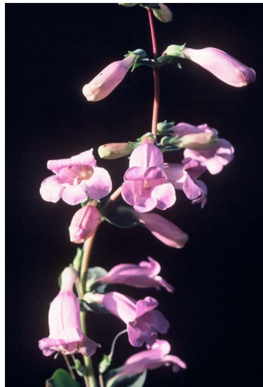
Large-Flower Beardtongue