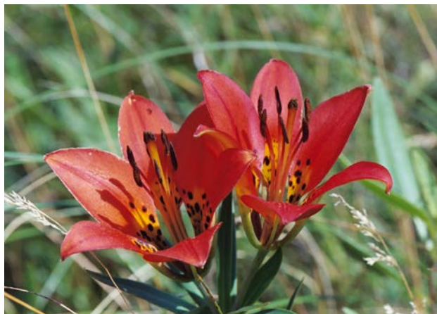
Wood Lily