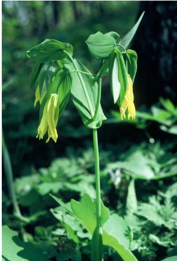
Large-Flower Bellwort

hangs downward below three large leaves. This plant is found in rich woods having acidic soils. It has been observed in several of the wooded coulees including Sica Hollow, Munson's Gulch, and Red Iron Springs. Nodding trillium blooms from May into early June.