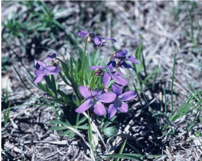
Crow-Foot Violet