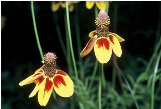
Columnar Coneflower

Ratibida columnifera Columnar (Prairie) Coneflower Rosa arkansana Dwarf Prairie-Rose Rudbeckia hirta Black-Eye Susan Sisyrinchium angustifolium Narrow-Leaf Blue-Eyed-Grass Sisyrinchium campestre Prairie Blue-Eyed Grass