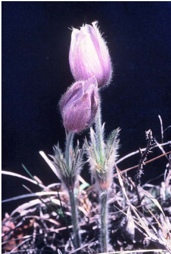
Pasque-Flower Anemone patens Pasque-Flower

Our state flower is one of the earliest blooming wildflowers. Flowers can appear as early as late March (often covered by snow) through mid-May. This species can tolerate and even proliferate in overgrazed prairies.