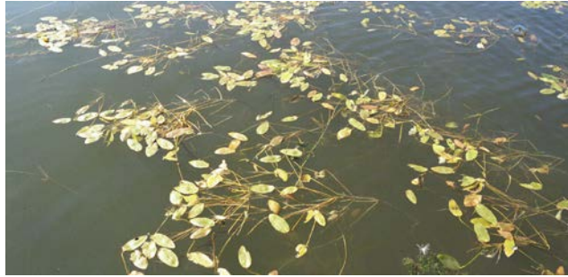
Floating Leaf Pondweed, Enemy Swim Lake

Ceratophyllum demersum Coontail Heteranthera dubia Water Stargrass Myriophyllum sibiricum Water Milfoil Najas flexilis Naiad