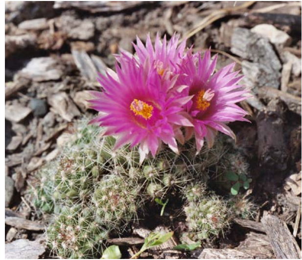
Spiny Star Cactus