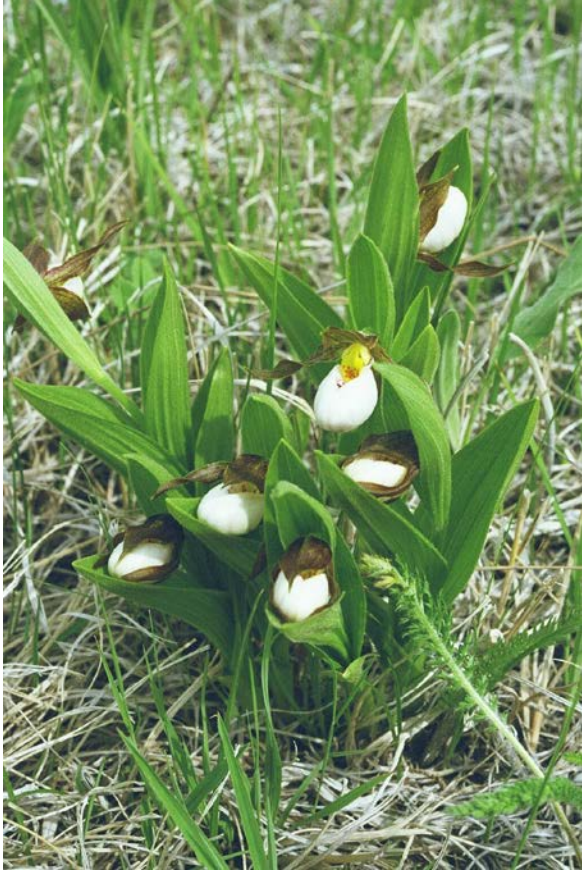
Small White Lady's-Slipper