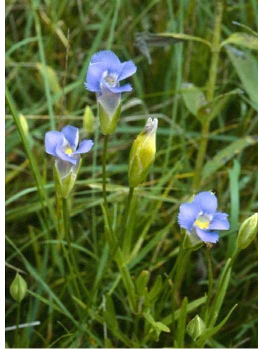
Fringed Gentian