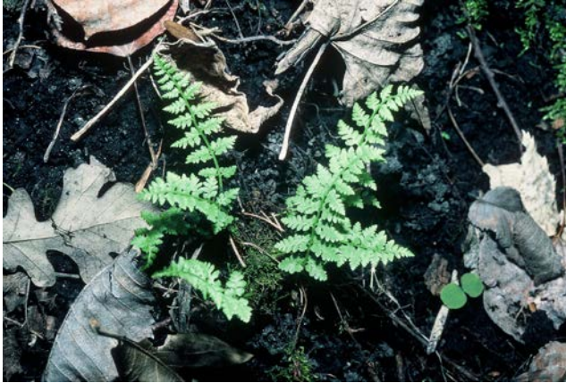
Brittle Bladder Fern

Cystopteris fragilis Brittle Bladder Fern Dicentra cucullaria Dutchman's-Breeches Hydrophyllum virginianum Eastern (Virginia) Waterleaf Maianthemum canadense False Lily-Of- The-Valley Maianthemum stellatum Starry False Solomon's-Seal