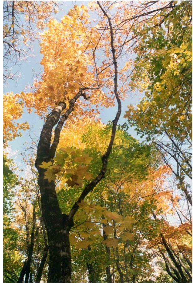
Fall Sugar Maples, Sica Hollow State Park

The trees, shrubs, and vines listed below are all native to northeast South Dakota and can be found growing in wooded coulees and riparian forests along the shores of lakes, streams, and wetlands.