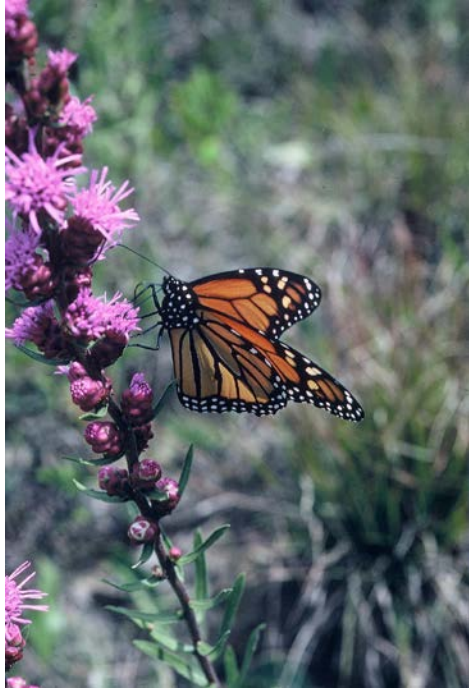
Monarch on Tall Gayfeather