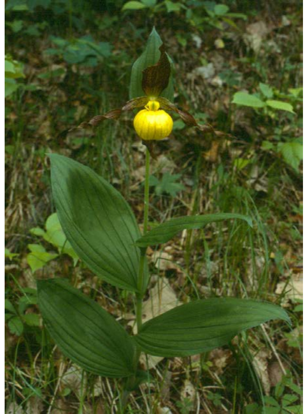
Yellow Lady's-Slipper