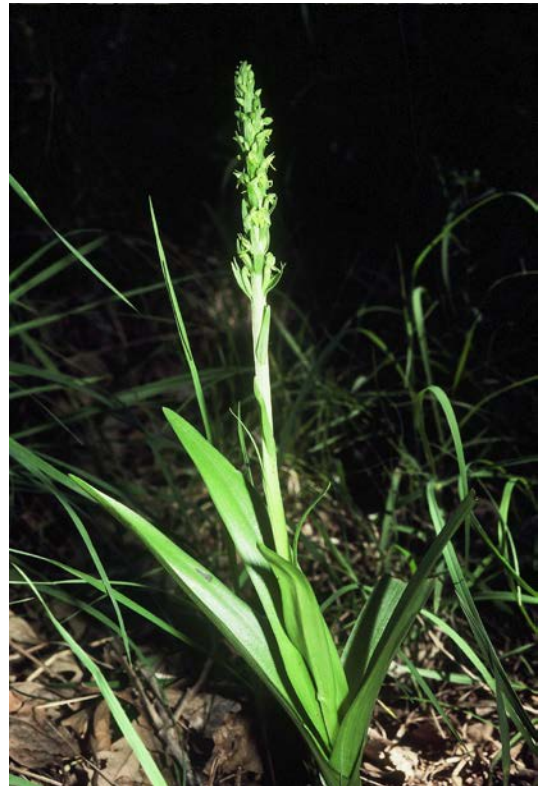
Northern Green Orchid