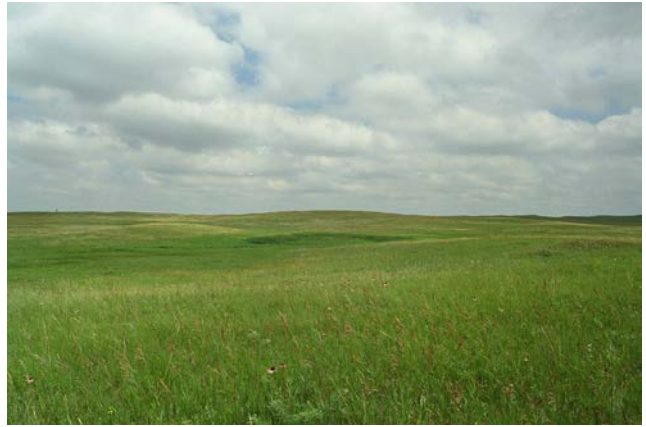
Native tallgrass prairie near Blue Dog Lake

Some of the largest contiguous tracts of native tallgrass prairie remaining in the state are found in northeast South Dakota. What you'll find is largely dependent on how these prairies are managed.