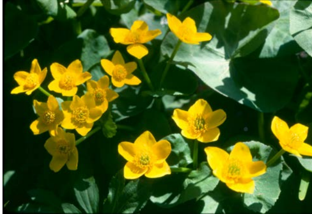
Marsh Marigold

The Swamp Milkweed and Joe-Pye Weed (pg. 19) grow along the edges of permanent wetlands and streams. Both species bloom July through August.