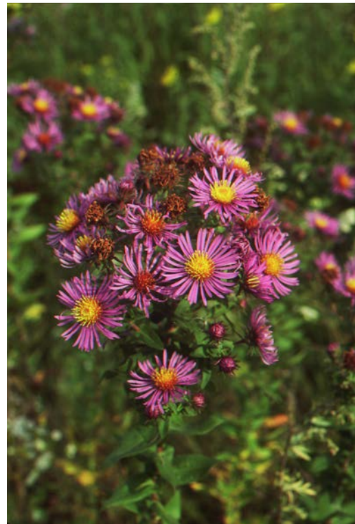
New England Aster

Solidago canadensis Canada Goldenrod Solidago gigantea Smooth Goldenrod Solidago missouriensis Missouri Goldenrod Solidago mollis Velvet Goldenrod Solidago nemoralis Gray Goldenrod Solidago rigida Stiff Goldenrod