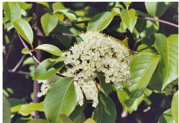
Nanny-Berry

Symphoricarpos occidentalis Western Snowberry Tilia americana Basswood (Linden) Toxicodendron rydbergii Western Poison Ivy Ulmus americana American Elm Ulmus rubra Slippery Elm