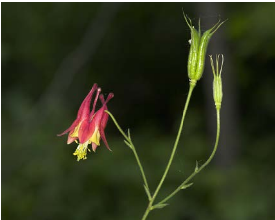
Red Columbine