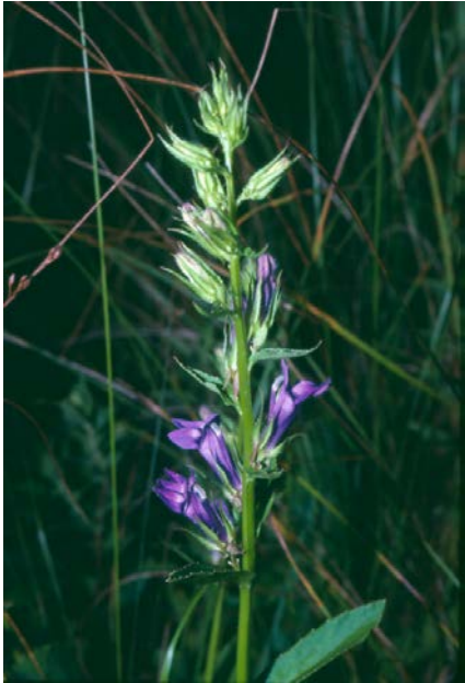
Blue Cardinal-Flower