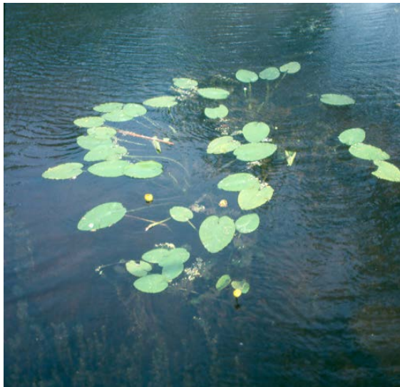
Yellow Pond-Lily