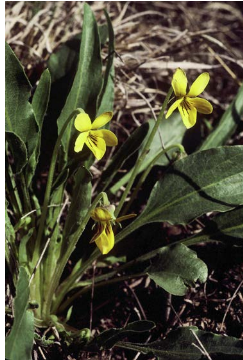
Nuttall's Violet

These two violets are important larval food for several species of fritillary butterflies, including the rare Regal fritillary. Female Regal fritillaries can detect dormant violet plants in late summer and lay eggs on nearby vegetation. When fritillary larvae hatch in the spring they feed on the emerging violet plants. In many areas of the United States, the loss of native prairie has led to the decline of both violets and fritillaries. The nuttall's and prairie violets bloom from May into June.