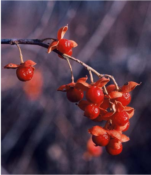
American Bittersweet