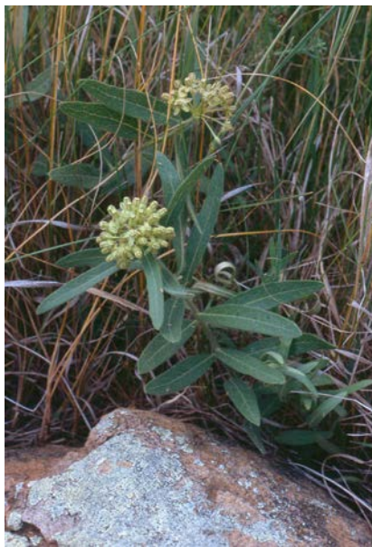
Side-Cluster Milkweed

One species of milkweed, the Side-Cluster (Woolly) Milkweed ( Asclepias lanuginosa ), shown below, has not been collected in northeast South Dakota since the early 1970s. Historical records exist of plants collected near Bitter and Blue Dog Lakes in Day County, and near Sica Hollow in Marshall County. This milkweed may now be extirpated from northeast SD.