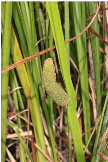
Sweetflag

The Marsh Marigold is found growing along spring fed creeks in Sica Hollow and Hartford Beach State Park and elsewhere. One of the earliest wildflowers to bloom in northeast South Dakota, late April through early May.