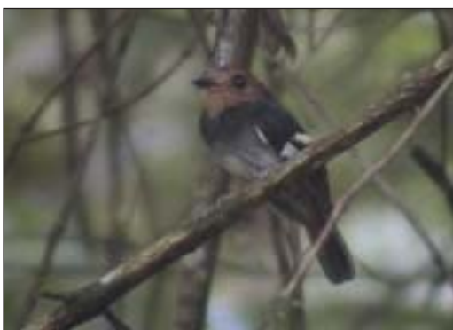
Figure 3. Male Black-chested Tyrant Taeniotriccus andrei , Floresta Nacional de Carajás, Pará, Brazil (Kevin J. Zimmer).