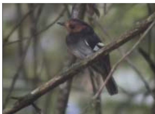
Figure 4. Male Black-chested Tyrant Taeniotriccus andrei , Floresta Nacional de Carajás, Pará, Brazil (Kevin J. Zimmer).