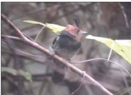
Figure 1. Male Black-chested Tyrant Taeniotriccus andrei with its crest erected. Floresta Nacional de Carajás, Pará, Brazil (Kevin J. Zimmer)

Venezuela and northern and south-east Amazonian Brazil, with one record (published without details) from Suriname 4 . The holotype was collected at La Prisión, on the right bank of the lower río Caura