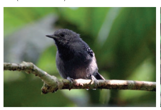
Figure 3. Male Salvadori's Antwren Myrmotherula minor , Reserva Ecológica Guapiaçu, Rio de Janeiro, south-east Brazil, May 2008 (Leonardo Pimentel)