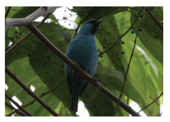
Figure 8. Male Black-legged Dacnis Dacnis nigripes , Reserva Ecológica Guapiaçu, Rio de Janeiro, south-east Brazil, August 2007