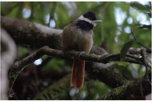
Figure 2. Male White-bearded Antshrike Biatas nigropectus , Reserva Ecológica Guapiaçu, Rio de Janeiro, south-east Brazil, August 2010 (Leonardo Pimentel)