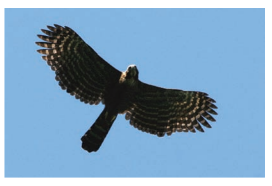
Figure I. Black Hawk-Eagle Spizaetus tyrannus, Reserva Ecológica Guapiaçu, Rio de Janeiro, south-east Brazil, August 2007 (Leonardo Pimentel)