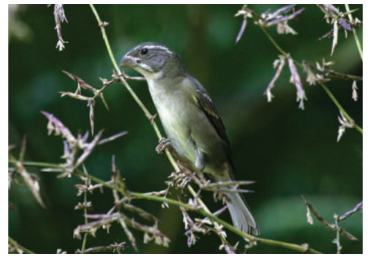
Figure 9. Buffy-fronted Seedeater Sporophila frontalis, Reserva Ecológica Guapiaçu, Rio de Janeiro, south-east Brazil, May 2008

Pale-breasted Spinetail Synallaxis albescens One record, on 30 October 2007, when two birds called repeatedly from tangled vegetation in the wetland area. They readily approached to playback and were tape-recorded (XC15858).