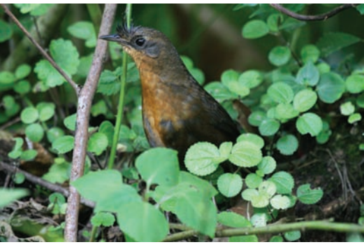
Figure 4. Female Slaty Bristlefront Merulaxis ater , Reserva Ecológica Guapiaçu, Rio de Janeiro, south-east Brazil, September 2009 (Leonardo Pimentel)