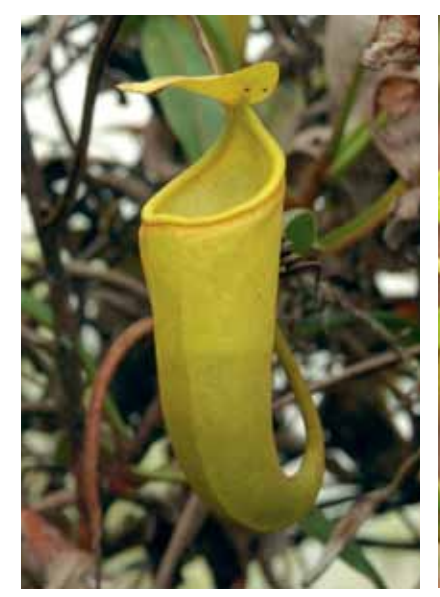
Figure 359 (above). A typical, pale green Nepenthes ceciliae upper pitcher.