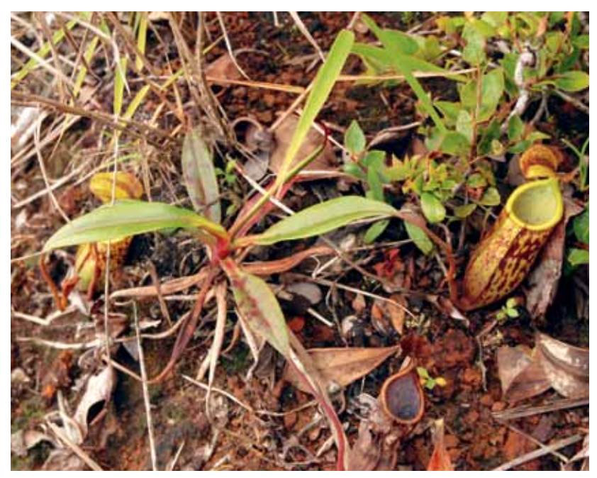
Figure 356 (above). A small rosette of Nepenthes ceciliae growing terrestrially on Mount Kiamo.