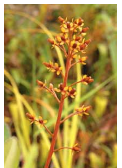
Figure 362 (above). The female inflorescence of Nepenthes ceciliae .