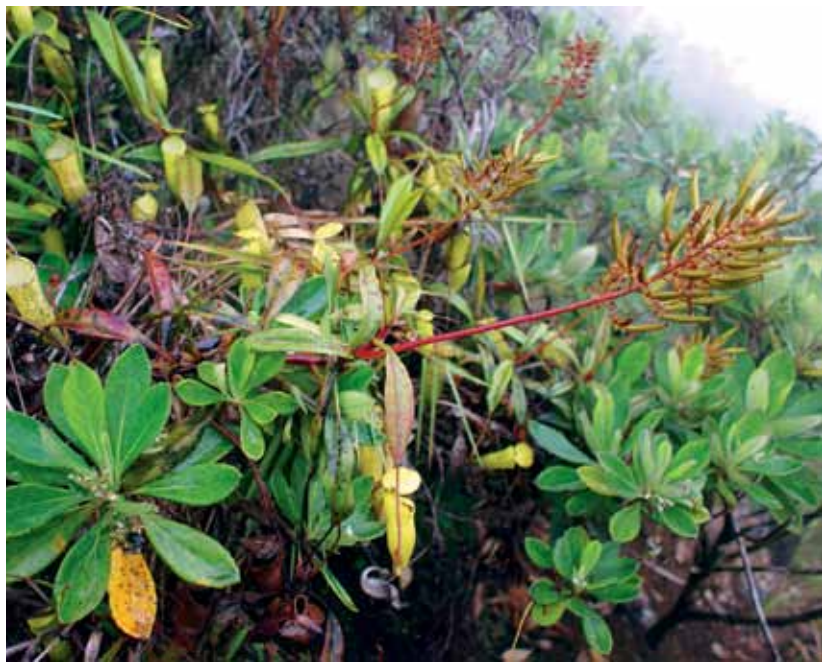
Figure 364 (above). Flowering specimens of Nepenthes ceciliae growing on the steep slopes of Mount Kiamo amidst stunted montane vegetation.