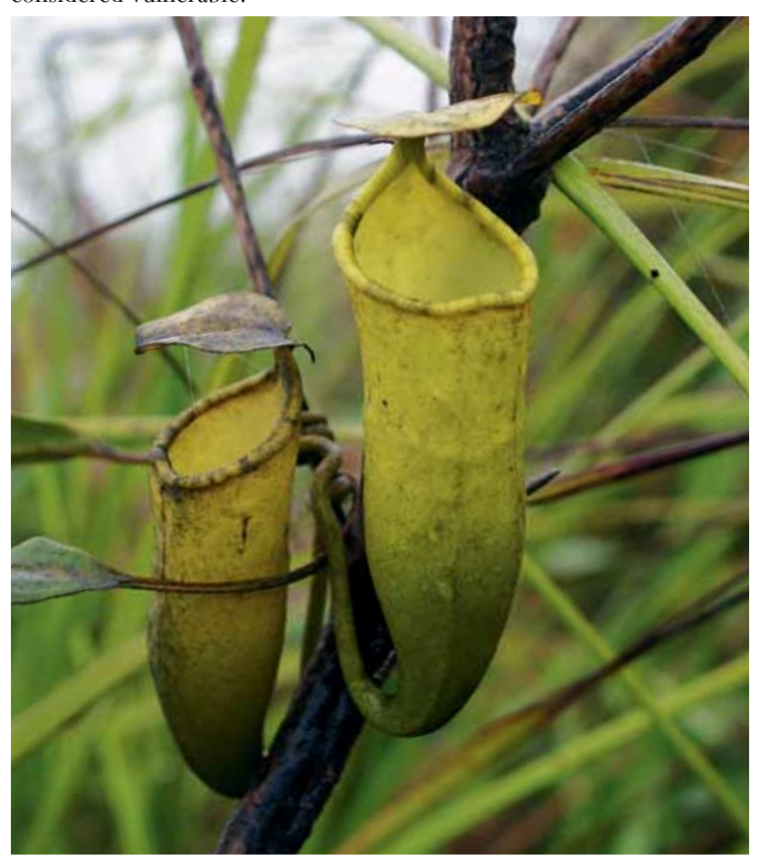
Figure 367 (above). Upper pitcher of Nepenthes ceciliae grasping adjacent vegetation for support.

CONSERVATION STATUS: Stands of Nepenthes ceciliae on Mount Kiamo are extensive, remote and little visited (Figure 367). Although located close to Malaybalay City, Mount Kiamo is difficult to access. All visitors must register in Kibalabag before entering the area. Unfortunately members of local communities do ascend the mountain to collect great quantities of Nepenthes, including N. ceciliae, to sell in flower markets and garden shows during annual fiestas and provincial celebrations. This form of collection represents the main threat to N. ceciliae and the other Nepenthes of Mount Kiamo. Further exploration of the surrounding peaks is required to establish the full range of this plant, but on the basis of current understanding, N. ceciliae should be considered vulnerable.