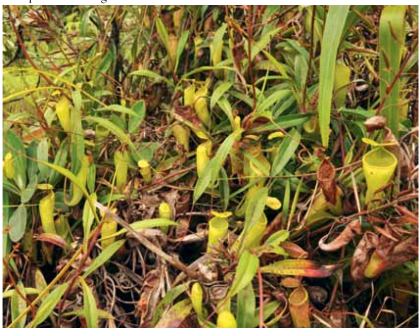
Figure 366 (above). A dense stand of Nepenthes ceciliae plants growing close to the -420- ground.