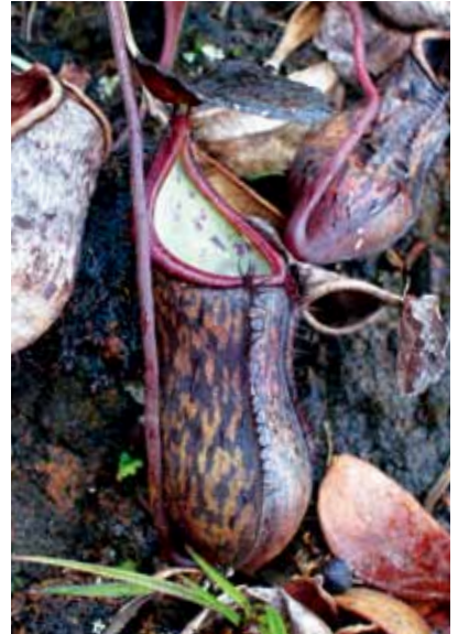
Figure 358 (above). The lower pitcher of a darker colour variant of Nepenthes ceciliae .