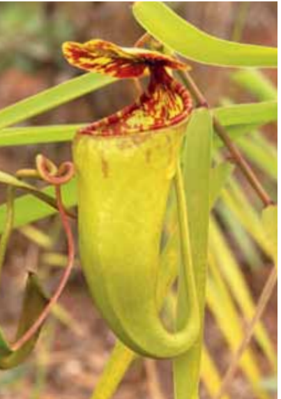
Figure 360 (above). The upper pitcher of a Nepenthes ceciliae colour variant.