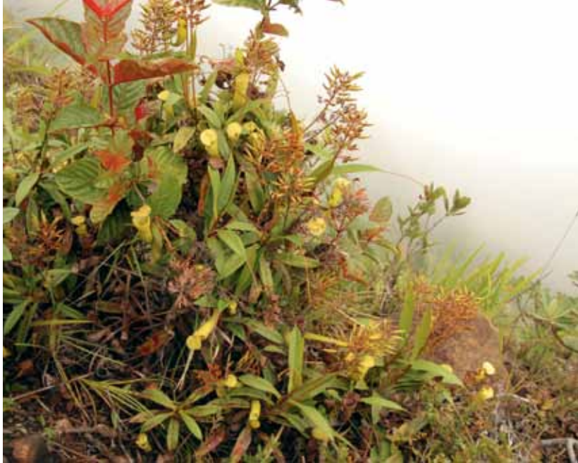
Figure 365 (above). Nepenthes ceciliae plants climbing over supporting vegetation. The species forms significant colonies where it occurs.