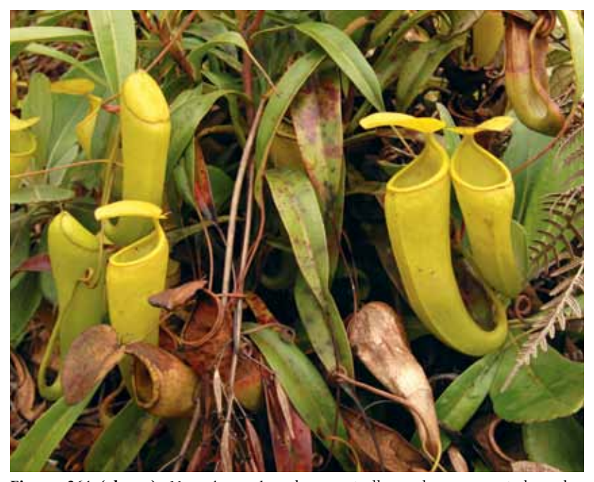
Figure 361 (above). Nepenthes ceciliae plants typically produce many pitchers that persist on the plants concurrently.