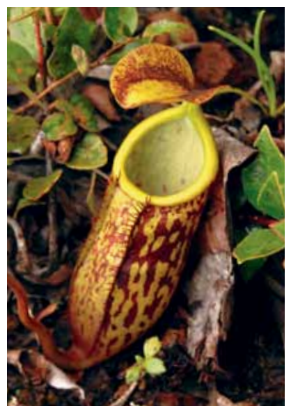
Figure 357 (above). A typical lower pitcher of Nepenthes ceciliae . Note morphological differences to N. alata .