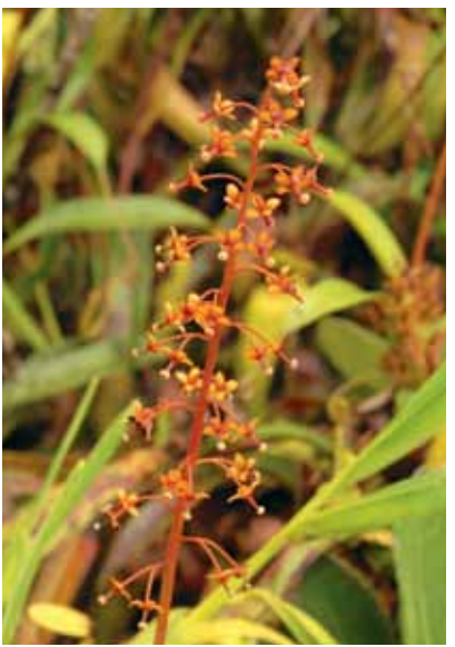
Figure 363 (above). The male inflorescence of Nepenthes ceciliae .