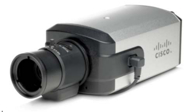
Figure 1. IP Camera with Optional DC Auto Iris Lens (Available Separately)

Cisco Video Surveillance 4500E IP Cameras has the additional digital signal processor (DSP) capabilities specifically designed to support real-time video analytics at the edge on the 4500E IP Camera. Applications and end users have the option to run multiple analytics packages without compromising video streaming performance on the camera. This highly flexible computing platform is ideal for next-generation video analytics applications.