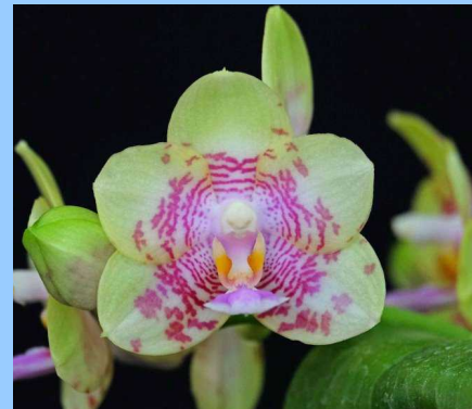
Phal. Pylo's Pax 'Catahoula Clown' HCC 75 Eron Borne