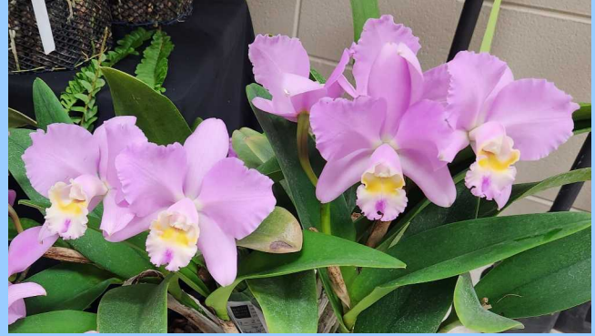
Rlc. Montana Spirt 'Big Sky' HCC/AOS