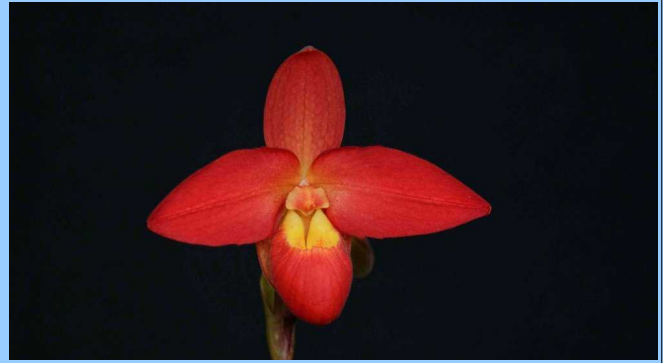
Phrag. unregistered 'Catahoula Fire' AM 82 Eron Borne