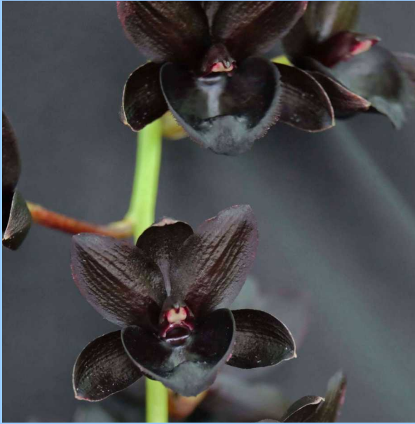
Fdk. Midnight Depth 'Louisiana' AM 80 Al Taylor