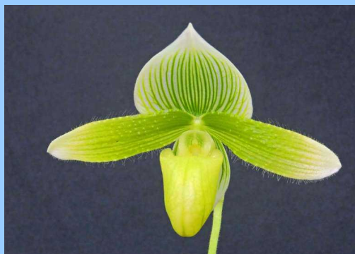
Paph. Oriental Appeal 'Louisiana' AM 80 Al Taylor