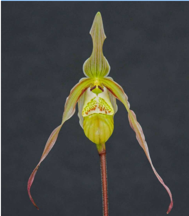
Phrag. pearcei bar. ecuadorensis 'Catahoula Charm' HCC 78 Eron Borne