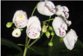
New Zealand calceolaria. ( Jovellana sinclairii ).