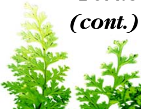
A filmy fern.