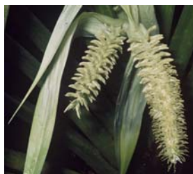
A perching lily. ( Astelia solandri ).