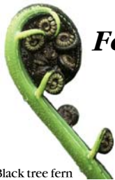
Black tree fern ( Cyathea medullaris ).