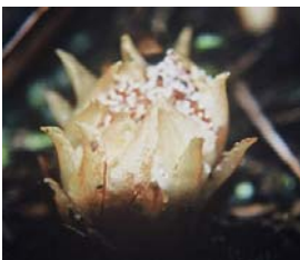
Dactylanthus taylorii .