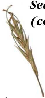
A hook grass ( Uncinia longifructus ).