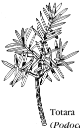
Totara ( Podocarpus totara ).