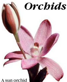
A sun orchid ( Thelymitra longifolia ).