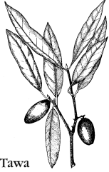
Tawa ( Beilschmiedia tawa ).