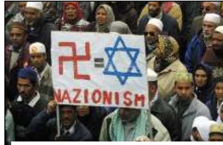
Anti-Israel demonstration during Durban Conference, 2001

An estimated 1,500 NGOs participated in the three-day NGO Forum at Durban, claiming to represent the “voices of the victims” of racism, discrimination, and xenophobia. The large attendance and funding from the Ford Foundation and various governments made the NGO Forum the central focus of the entire Durban Conference. This support also reflected the dominant ideology that viewed NGOs and civil society as “authentic” voices and representatives, in contrast to those of government officials and elected representatives in democratic societies.