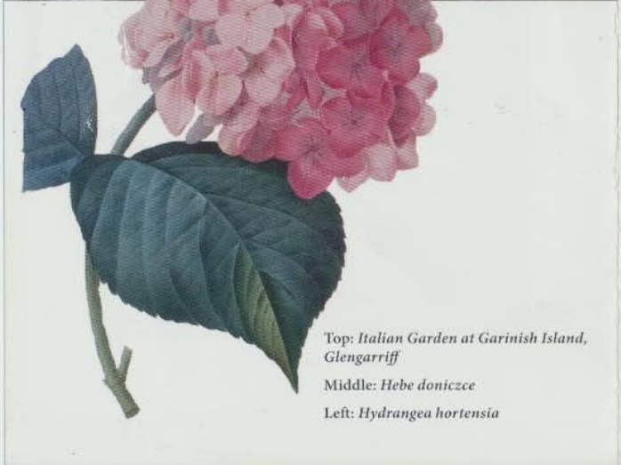
Top: Italian Garden at Garinish Island, Glengarriff