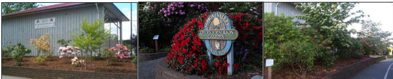
BOVI bed and CVRG sign photos taken in past Springs by various Chapter members

I am looking forward to welcoming many of you to the meeting at the Comox United Church on Tuesday, September 13 th at 7 PM. In the meantime, continue to enjoy what is left of this gorgeous summer. Take care and stay safe!