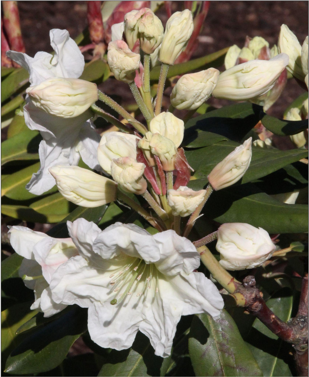
BOVI - 'Forbidden Plateau' is a Harry Wright hybrid.