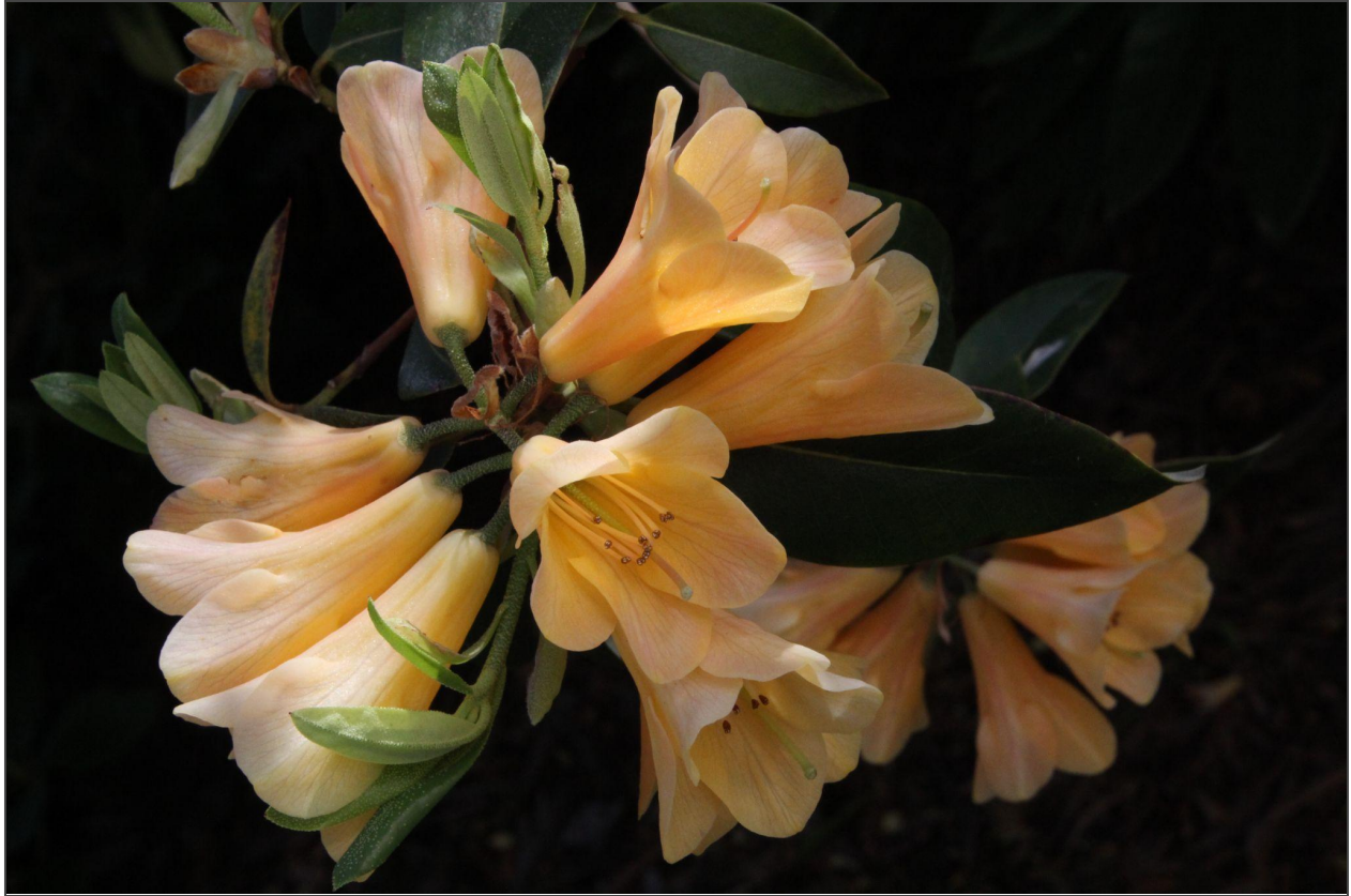
'Transit Gold' hybridized by Stuart Holland in the Victoria area.