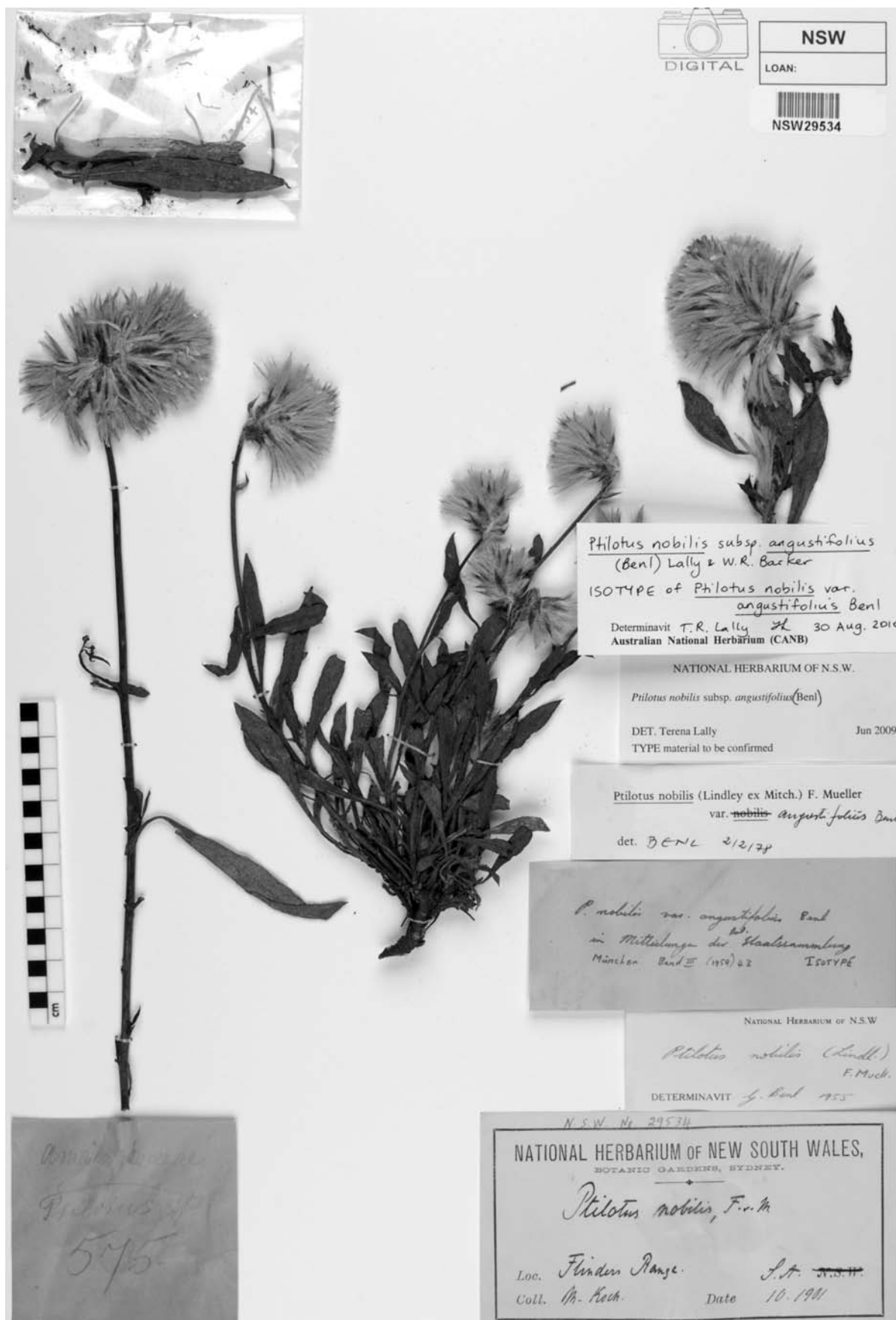
Fig. 2. Isotype of Pilotus nobilis subsp. angustifolius (Benl) T.R.Lally & W.R.Barker (NSW 29534).