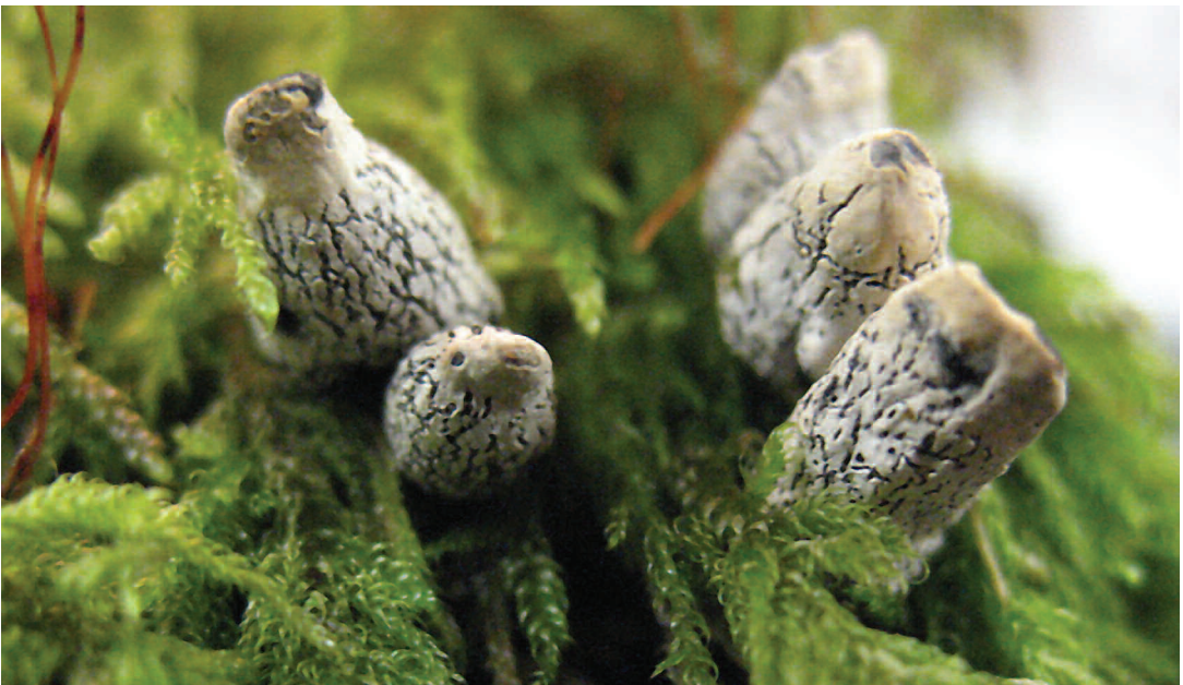
Fig. 3. X. cinerea : short fat fruitbodies on a moss-covered log (probably Quercus) in Tycanol National Nature Reserve, Pembrokeshire, 30 Oct. 2007.