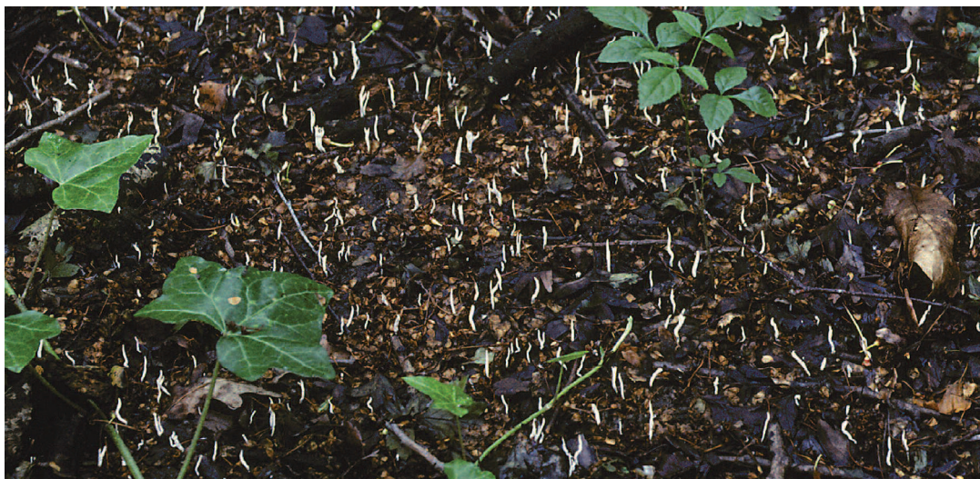
Fig. 1. Xylaria oxyacanthae , associated with fallen hawthorn berries, fruiting in large numbers at Ham Lands Local Nature Reserve, Surrey, 14 June 2006.

Unfortunately the full British Xylaria picture includes several other obscure taxa. Two species, X. bulbosa and X. digitata , present something of a puzzle in that both were quite widely recorded in the 19th century in Britain and also elsewhere in Europe but appear to have subsequently vanished. Læssøe (1992, 1993) made a thorough Europe-wide study of these and related species and concluded that both "seem not to have been collected this century [anywhere in Europe]". By contrast the provisional British Red Data List (Evans et al. , 2006) gives the last known British records as 1911 and 1924 respectively. Læssøe also recognised single British collections of two other species: X. friesii newly described with a 1970 record from Wiltshire and X. guepinii (syn. X. scotica Cooke) from Perthshire 1875, this latter possibly better placed in Podosordaria . Summary descriptions of both (as New British Records 111 and 112) were given in Mycologist 8(1) (Spooner 1994, Læssøe 1994). Completing