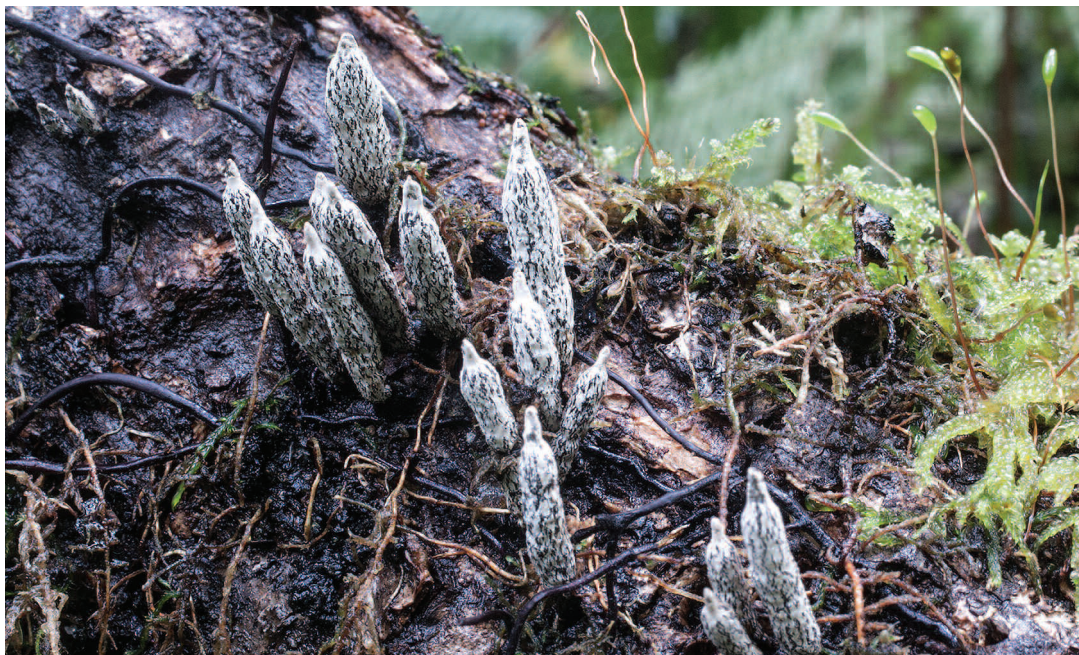
Fig. 4. Xylaria cinerea : more typical fruitbodies on Corylus, Horner Wood near Minehead, S. Somerset, 22 Sept. 2015.