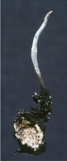
Fig. 2. X. oxyacanthae stroma and colonised hawthorn seed (split open) from Ham Lands collection.

the spores, and if you can't make them fit then investigate further. The two new species discussed below, the main theme of these notes, bypass all these complications since, surprisingly, both seem to be usually recognisable with confidence in the field. Any doubts can be