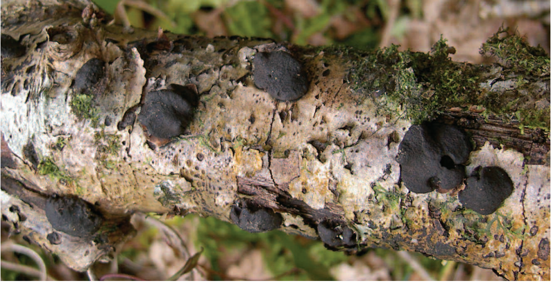
Fig. 5. X. crozonensis : showing its curiously flattened, cushion-like fruitbodies. On Quercus wood, Hustyn Wood near Wadebridge in Cornwall, March 2014.