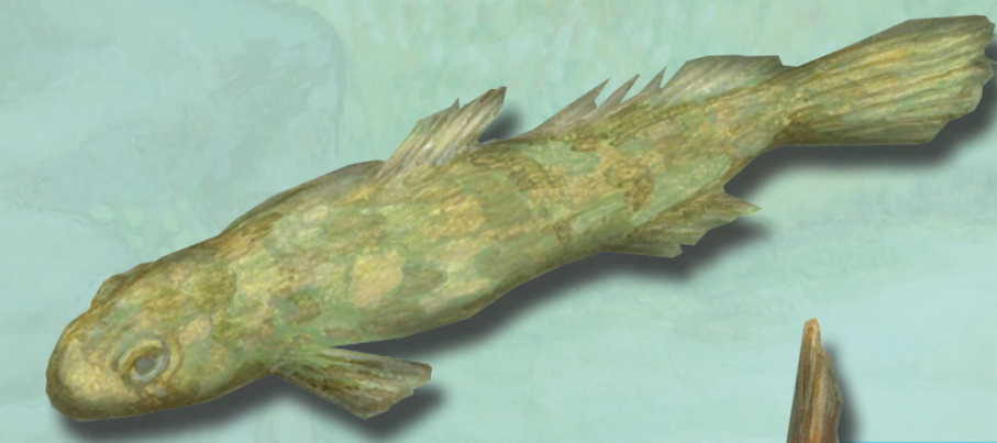
'O'opu 'alamo'o female

Clinging to rocks in fast-flowing streams, climbing 100 foot waterfalls*, and releasing larva to mature in the ocean before returning to the stream for adulthood.