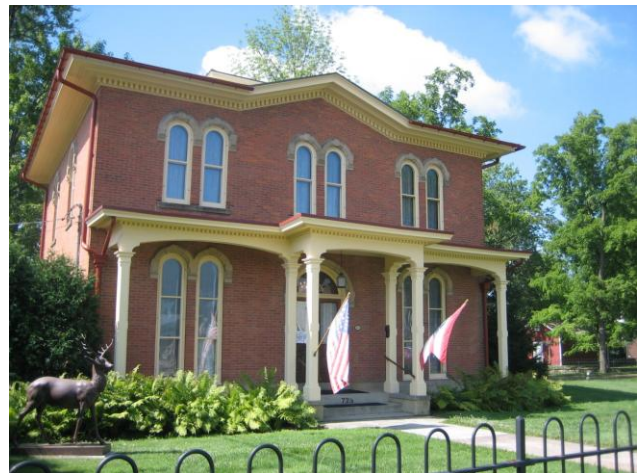
The Monroe House, in its current location at 73 ½ South Professor Street