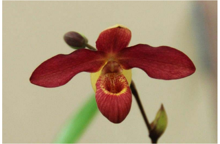
Paphiopedilum – Third Place

Paph. conco-bellatulum × Paph. Thianum 'Super Cute' Jim Wheeler