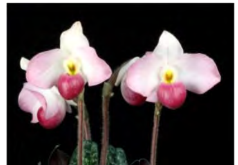
Paph. Ho Chi Minh