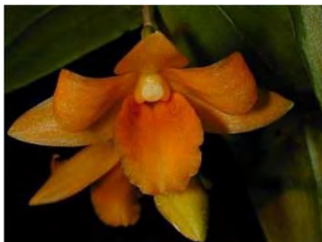
Dendrobium crocatum × self