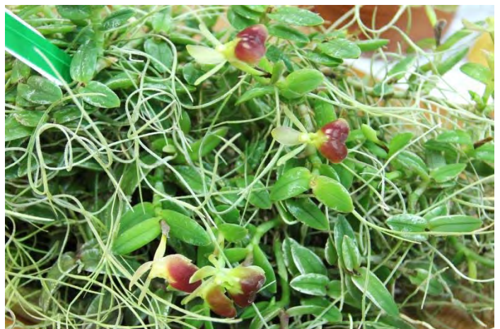
Species – First Place & Culture Epi. (nanodes) porpax – Jim Wheeler