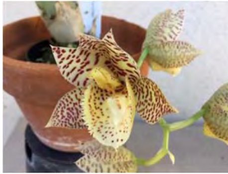
Ctsm. Orchidglade 'Davie Ranches' AM/AOS × Ctsm. tigrinum 'SVO'