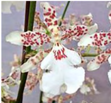
Onc. Speckled Spire 'Shorty'