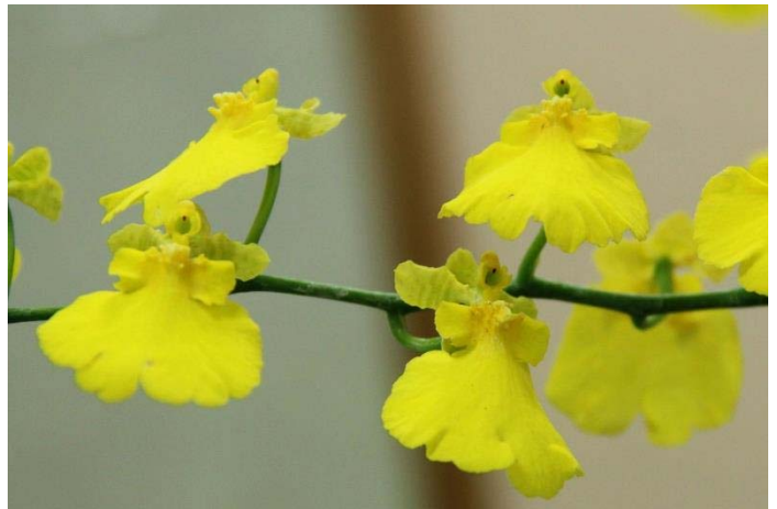
Oncidium – Second Place Onc. Lemon – Y.S. Farn