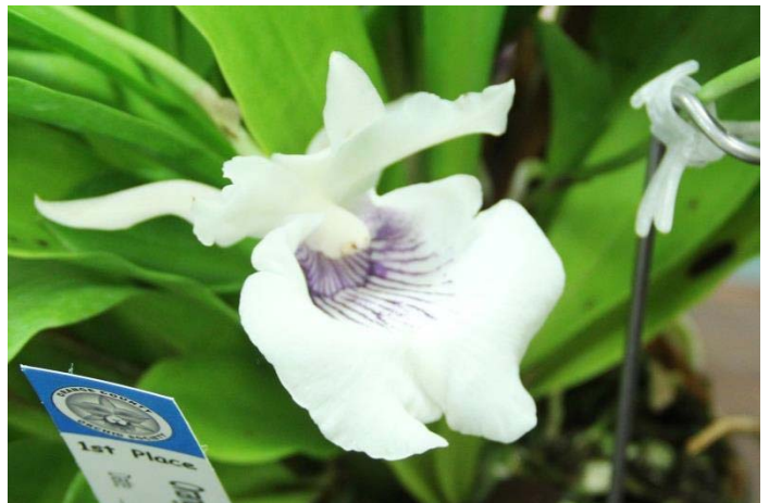
Botanical – First Place

Slc. Golden Tread 'Big Red' – Darrell Lovell