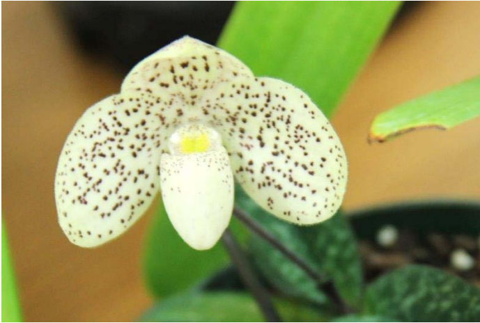
Paphiopedilum – Second Place

Paph. conco-bellatulum × Paph. Thianum 'Super Cute' Jim Wheeler