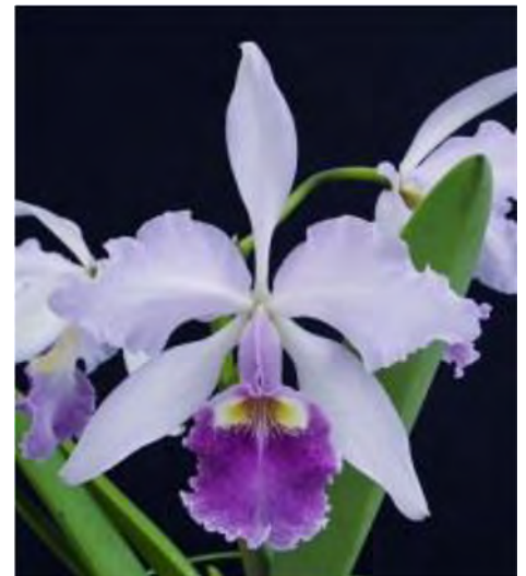
Cattleya warscewiczii var. semi-alba coerulea 'Natural World' × self

Pictured here are plants offered up at last year's event—check www.ocos.net starting January 3 to see what will be up for bid this year. Join us for some fun and take home a new lovely.