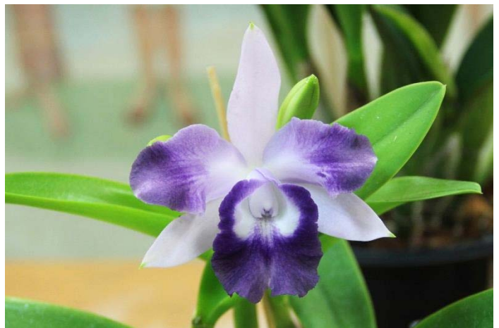
Small Laelia – Second Place