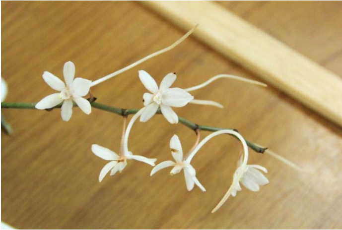
Species – Second Place Aer. biloba – Una Yeh