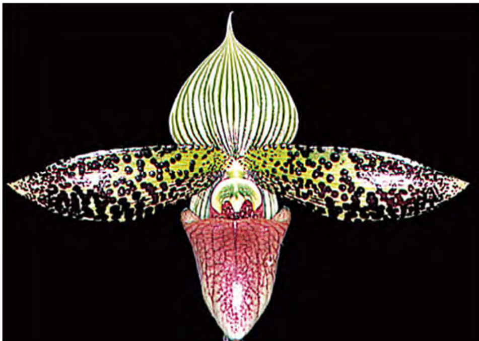
Phap. sukhakulii , Piping Rock Orchids.