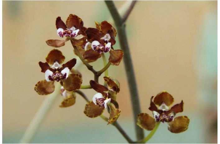
Species – Third Place Onc. microchialum – Una Yeh