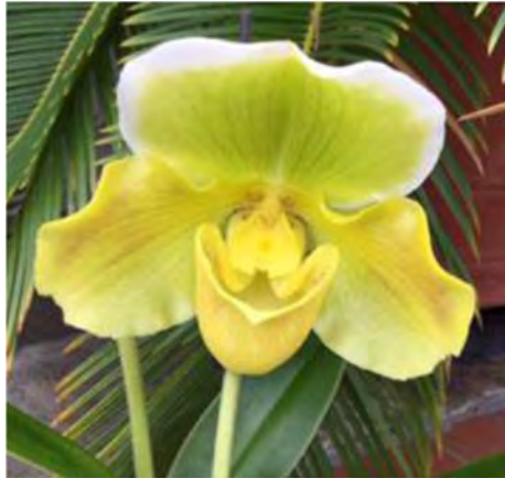
Paph. Magic Mood 'Tumbleweed' × Mountain Meadow 'Jolly'