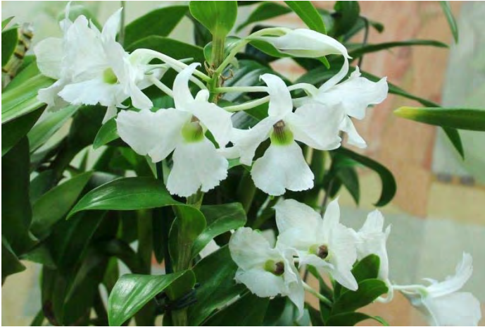
Dendrobium – First Place Den. sanderae var. luzonicum – Una Yeh