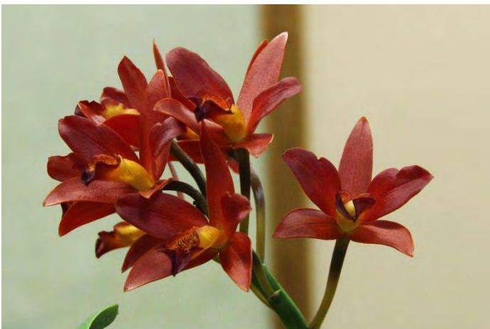
Small Laelia – Third Place