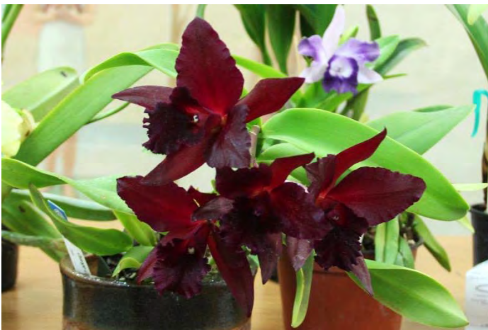
Small Laelia – First Place