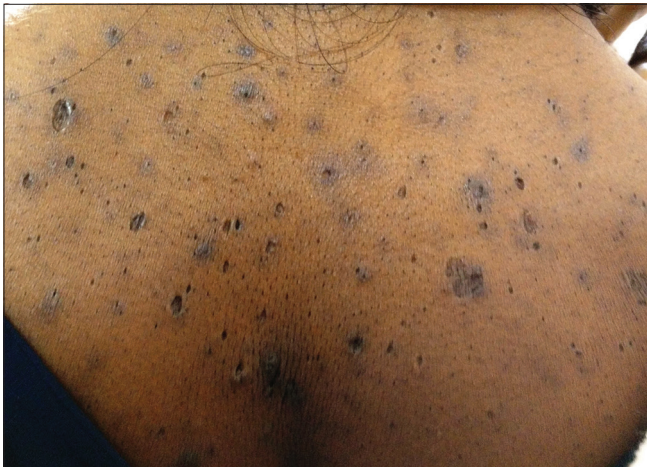
Figure 2: Hyperkeratotic comedones like papules and pock-like scars of varying sizes on back.