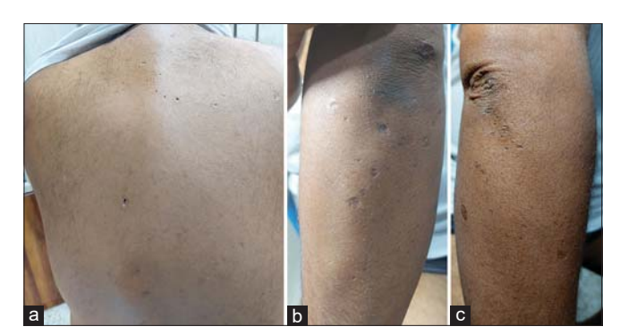
Figure 3: (a) Multiple pitted, acne-like scars on the back. (b-c) Multiple atrophic scars of the elbows.

topical antibiotics as an acute treatment for the ruptured, infected cyst. Thus, a diagnosis of DDD was reached based on the clinical manifestations, mode of inheritance, and histopathological characteristics. Informed consent was taken from the patient and the study was approved by the ethical committee.