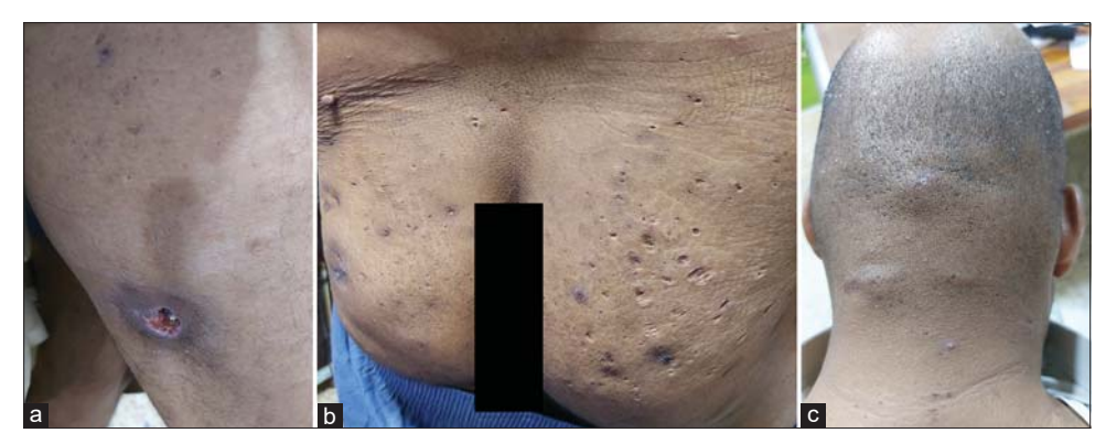
Figure 1: (a) Ulcer on the upper part of the thigh. (b) Multiple atrophic scars and cysts on the buttock. (c) Multiple cysts on the back of the scalp and scars on the back of the neck.