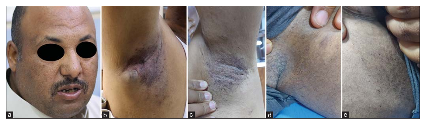
Figure 2: (a) Multiple pitted, acne-like scars on the face. (b) Reticulated hyperpigmentation of the right axilla with a cyst. (c) Reticulated hyperpigmentation of the left axilla. (d-e) Reticulated hyperpigmentation of the right and left groin.