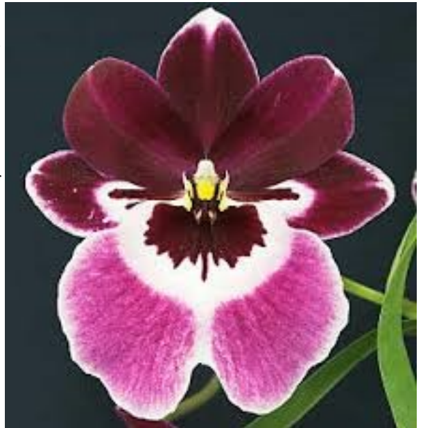
Mps. Augres 'Trinity' AM/RHS

Time to flower from 20 °C was similar for all treatments and averaged 76 and 56 days, respectively, for Augres 'Trinity' and Eastern Bay 'Russian' . The number of flowers per plant and their height were not influenced by normal