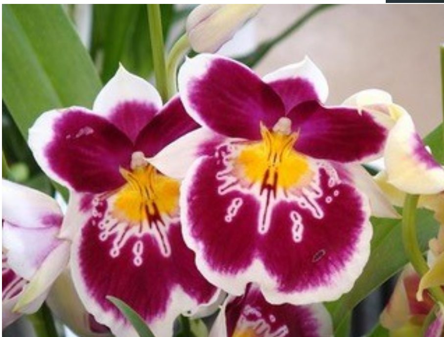
Mps. Eastern Bay 'Russian'

Please send your contributions to me at lochaven999@gmail.com by or before mid August