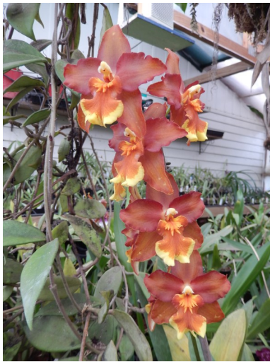
Wils. Hida Plumtree (left)

The second picture on page 4 is one of my crosses and is Wils. Hida Plumtree x Oda. Arohena 'Dark Side'