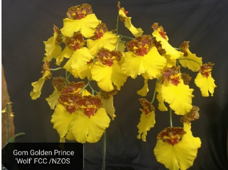
Onc varicosum hybrid