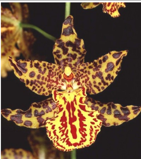
Odontocidium Golden Trident 'Emily' HCC/ NZOS