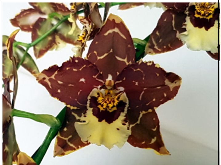
Wilsonara Carolyn Woolf 'Susan' AM/OCNZ