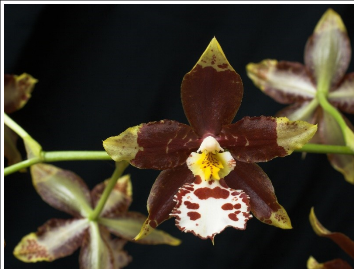
Odontocidium Tiger Mac 'Mona' AM/NZOS

One result has been near black coloured flowers with two standouts. One has been Odcdm. Tiger Mac (Odcdm. Tiger Butter x Odm. maculatum) with the clone Odcdm. Tiger Mac 'Mona' AM/NZOS should probably be given a higher award to recognise its shape and colour. The most interesting hybrid, although not an F1 hybrid, is Alexanderara Heck Hazelwood quite a complex hybrid but with Onc. tigrinum featuring in the recent background and producing another red-black orchid.