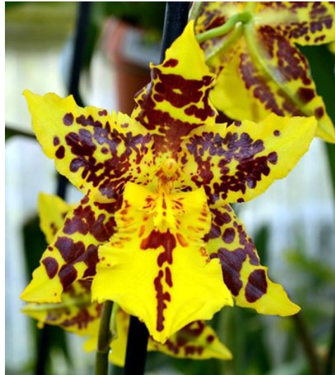
Odontocidium Tiger Hambühren

Some of the other progeny of Onc. tigrinum we have seen are Onc. Tigersetze (Onc. tigrinum x Onc. Carisette) Onc. Purbeck Gold (Onc. tigrinum x Gold Cup). Along with now over 1000 offspring including some % of Onc. Tigrinum. Many we have not yet seen.