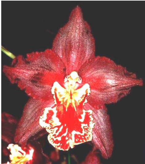
Wilsonara Bardot 'Charles' AM/OCNZ

As a parent Onc. Tiger Hambühren was used extensively by Geyserland both clones of Tiger Hambühren 'Micky' and 'Minnie' we now have acquired to keep some of this parent material alive. These produced very dominant colour ranges of yellow/brown heavily blotched flowers with usually strong large lips witch grew into rather large plants with strong multi spiking bulbs and usually long (15-20 flowers) flower spikes.