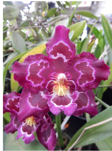
Oda. Arohena 'Dark Side' (right)

This cross should a wide range of colours in the darker shades, some with patters.