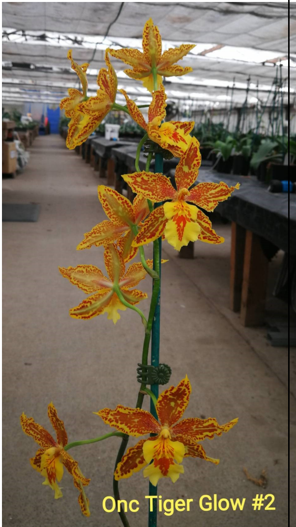
Onc Tiger Glow Tall spike