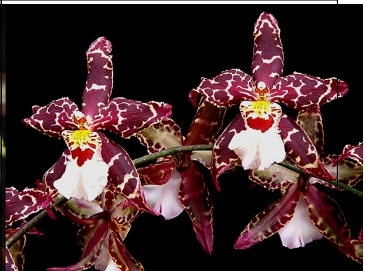
Alexanderara Heck Hazelwood 'Bayswater' HCC/OCNZ

I recently reacquired these to continue these lines of breeding and produce more interesting results. Looking to the future for Onc. tigrinum , I believe the dominance of red and brown bared petals and sepals with a yellow lip will remain for many progeny but like illusive change of colour for many new hybrids will give Onc. tigrinum a new lease of life and something further to look forward to.