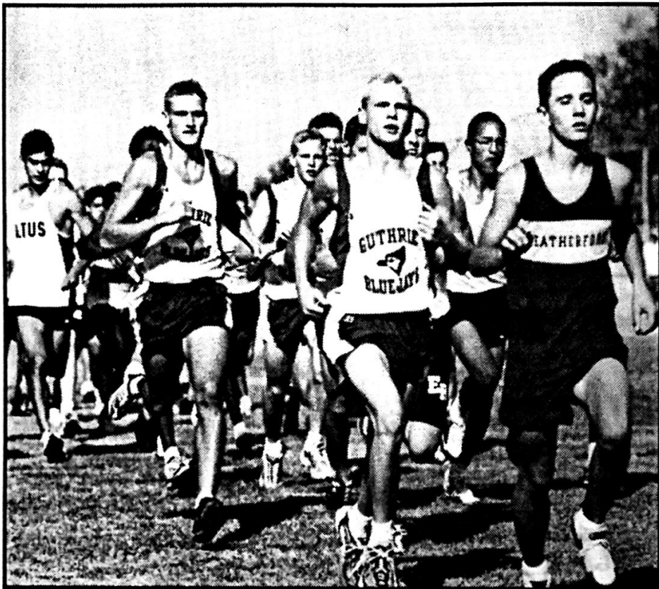
WESTERN HEIGHTS—The 4A boys chase pack early in the race. Guthrie won the team title with Weatherford second.