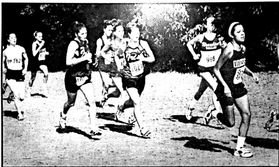
SMU INVITATIONAL —McGuinness traveled to White Rock Lake in Dallas along with Plainview and Marlow. The Irish finished second with the Outlaws fourth and the Indians fifth.