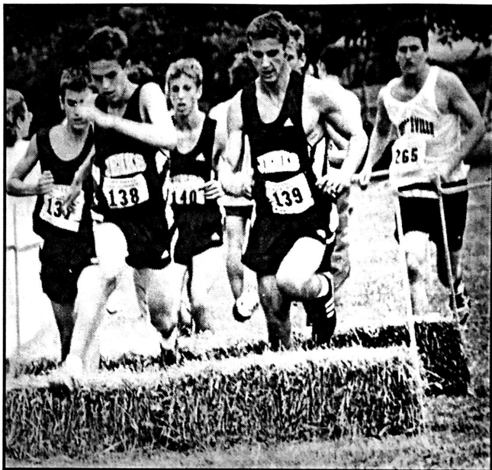
FT. SMITH INVITATIONAL—A couple of hay bales made the race interesting as a pack of Jenks runners go over the obstacles. The Jenks boys and girls both won team titles.