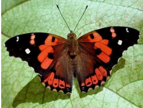
Kamehameha ( Vanessa tameamea / Mamaki and Koa)