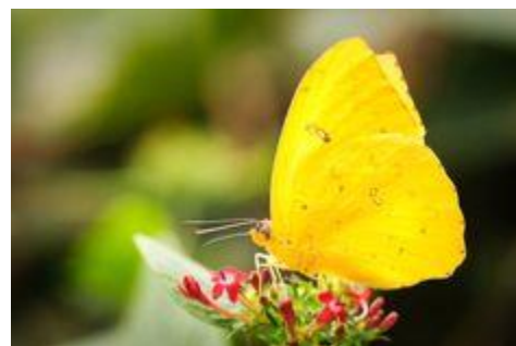
Large Orange Sulphur ( Phoebis agarithe / Fabaceae)