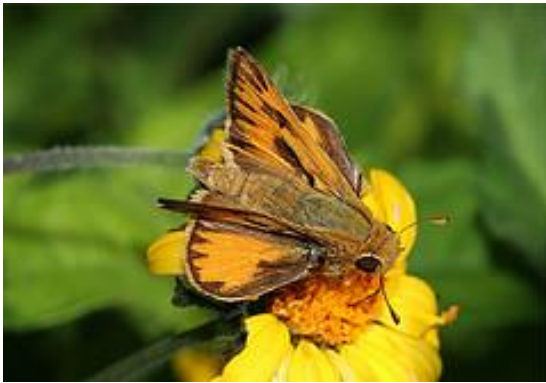
Fiery Skipper ( Hylephila phyleus / Grasses and Asterace)