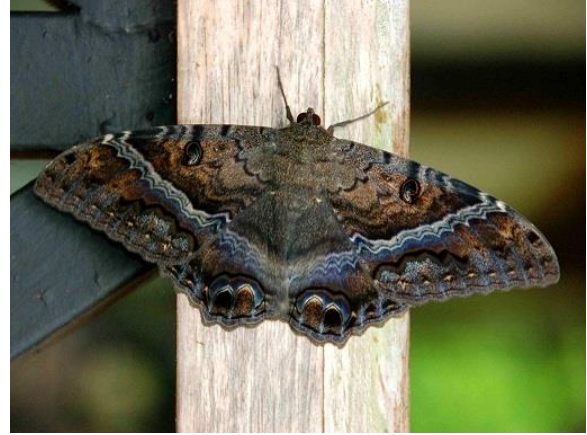
Black Witch Moth (male; females are tan) ( Ascalapha odorata )