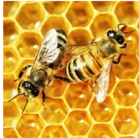
Honey Bee ( Apis – many types)