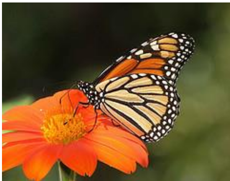
Monarch ( Danaus plexippus / Milkweeds )