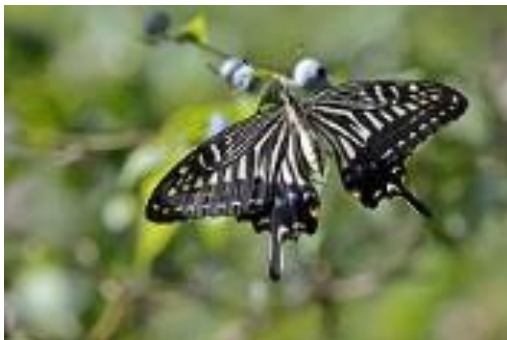
Citrus Swallowtail ( Papilio xuthus / Citrus)