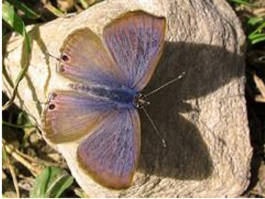
Bean Butterfly ( Lampides boeticus / Fabaceae)