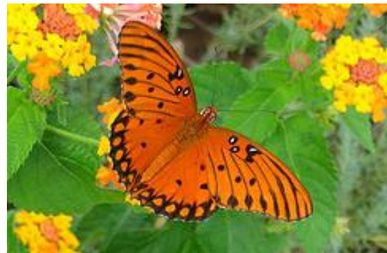
Gulf Fritillary ( Agraulis vanilla / Passion vine)