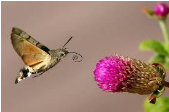
Hawk Moth ( Macroglossum stellatarum )