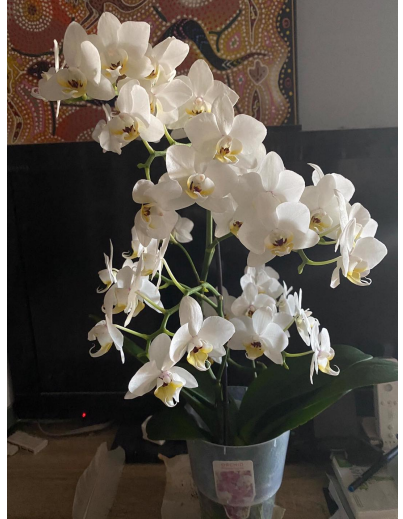
Phalaenopsis unknown grown by Charmaine Tan