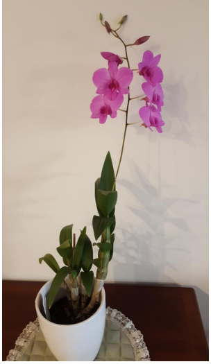
Dendrobium bigibbum grown by Valerie Cooper