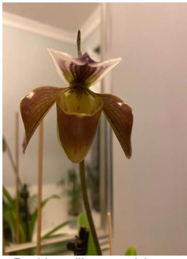
Paphiopedilum gratrixianum grown by Charmaine Tan