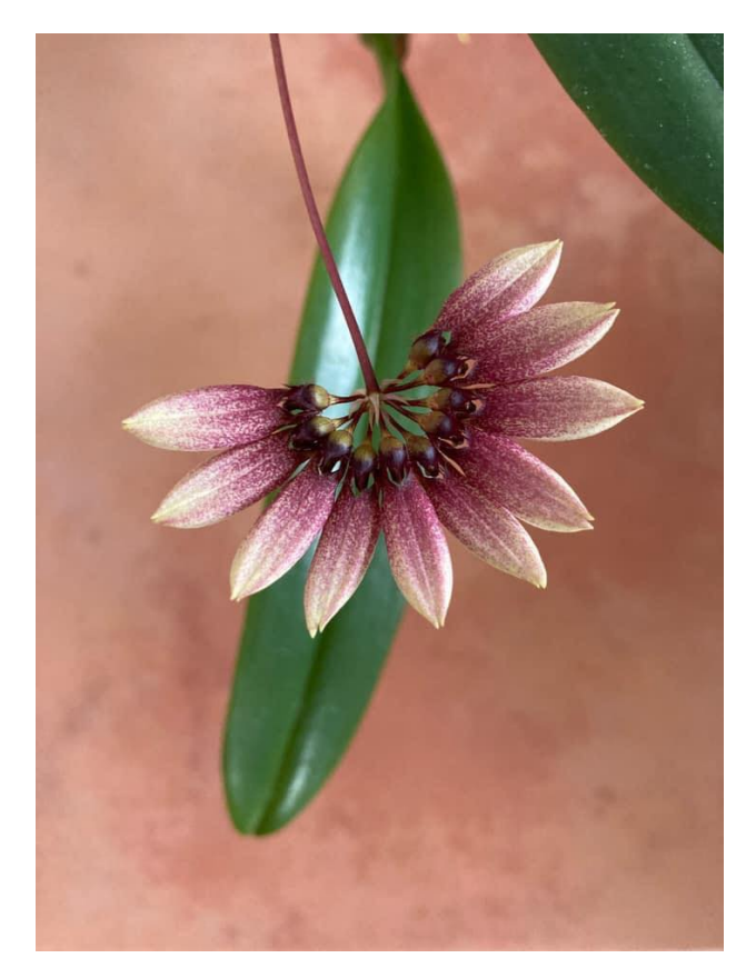
Novice Popular Vote: Bulbophyllum lepidum , grown by Kirsty Bayliss