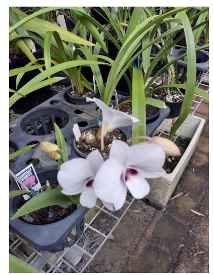
Dendrobium bigibbum grown by Courtney Rogasch