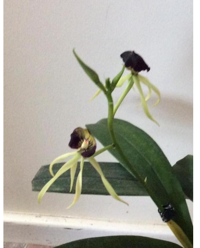
Prosthechea cochleata grown by Lynn Brooks