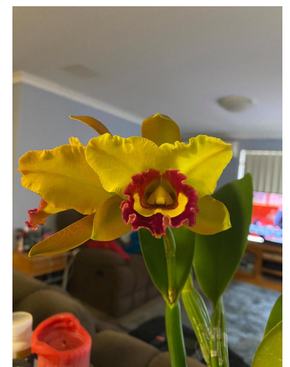
Rhyncattleanthe Duh's Festival grown by Charmaine Tan