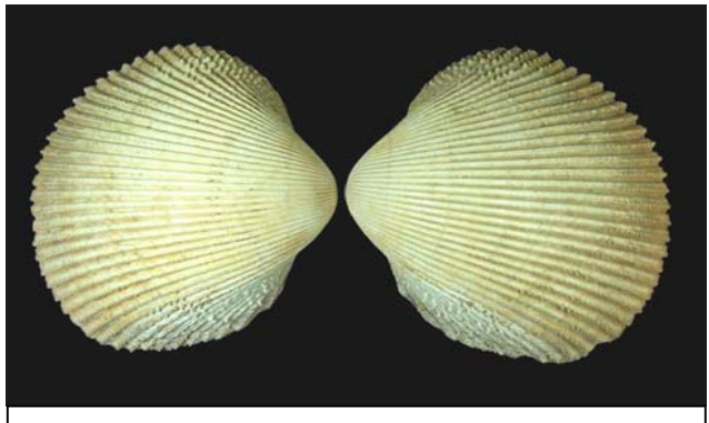
Spiny Cockle- Trachycardium quadragenarium

<u>Cockles</u> (family Cardiidae—Southern California species: Americardia biangulata, Laevicardium substriatum, Trachycardium quadragenarum)