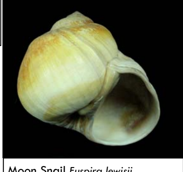
Moon Snail Euspira lewisii