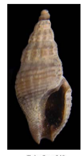
Clathurella canfieldi (Dall, 1871) collected during March 2008 PCC feild trip, 6.7 mm