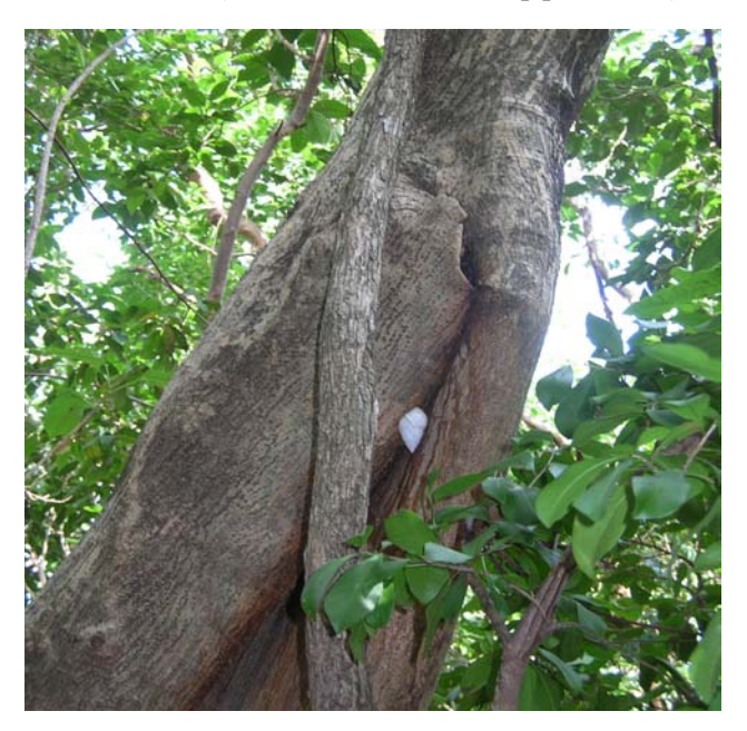
Liguus fasciatus #1

tree snails, I shouldn't be looking at the ground but, rather, in the trees above my head. Scanning the trees around me, I eventually saw my first Liguus, about three feet above me (a little below center in the top photo below).