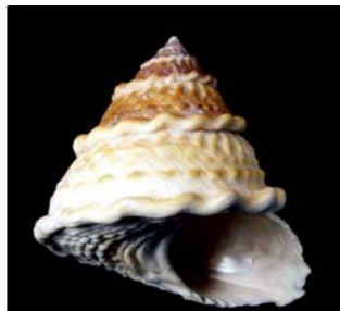
Wavy Turban Shell Megastraea undosa

Limpets Families Lottiidae and Fissurellidae.