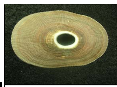
Giant Keyhole Limpet Megathura crenulata

Moon snails may not be taken north of the Golden Gate Bridge.