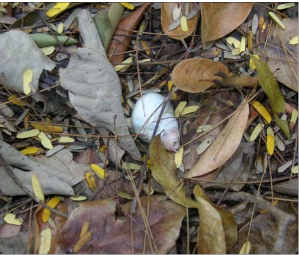
Liguus fragment among the leaf litter

As I worked my way through the leaf litter, I did find a number if interesting species ( Chondropoma dentatum , Drymaeus multilineatus , Lucidella tantilla , Helicina clappi , Allopeas gracile , among others). These species are all found else-