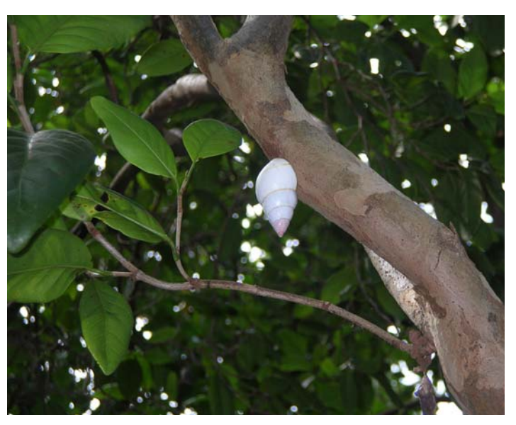
Liguus fasciatus #2

Was this a location where someone had transplanted a range of color forms? Or, do different color forms exist side-by-side in this little colony?