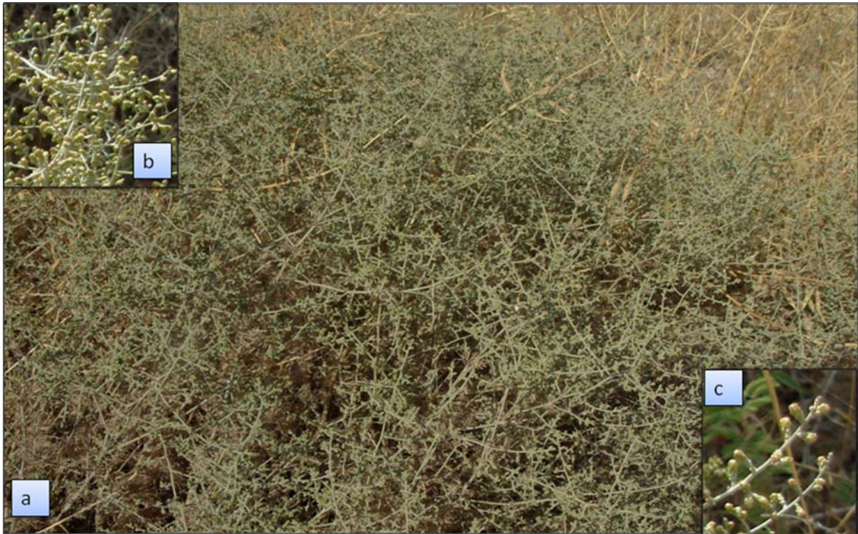
Fig. 2. A. sieberi subsp. sieberi a- General view of A. sieberi subsp. sieberi , b-c- General view of the plant's sinflorescence