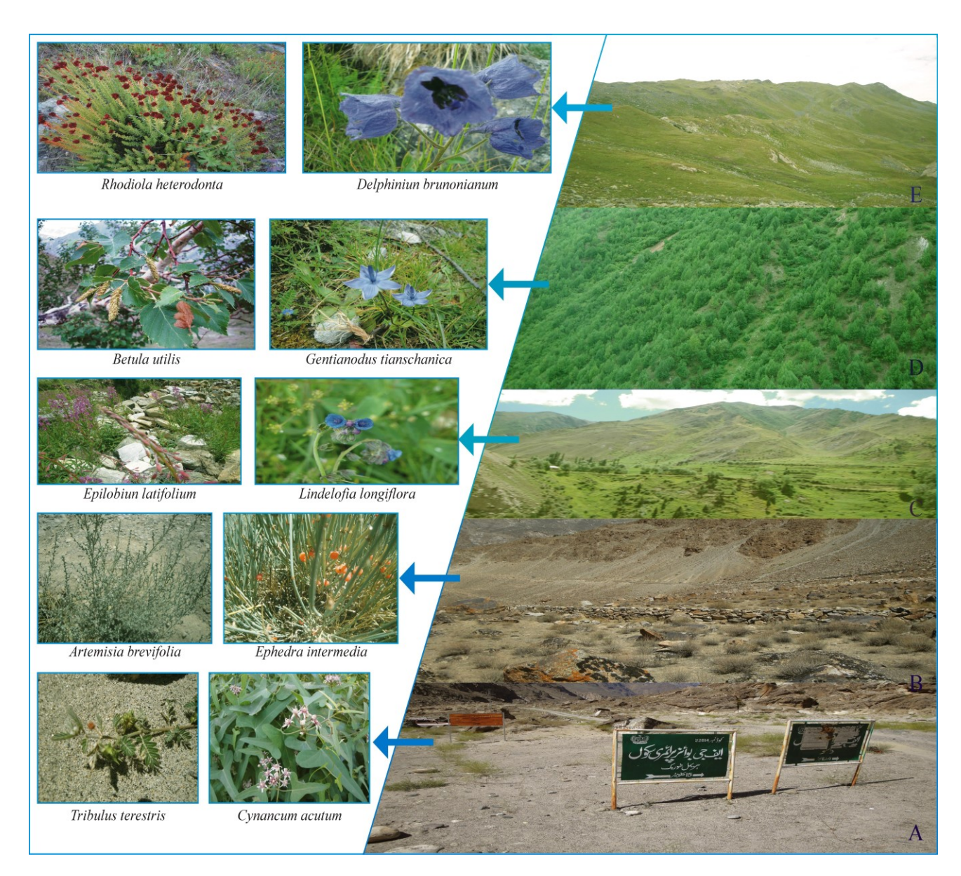
Fig. 2 Illustration of the vegetation zonation (A & B = Dry, C = Agro-forestry, D = Subalpine, E = Alpine Zone) with characteristic species of each zone