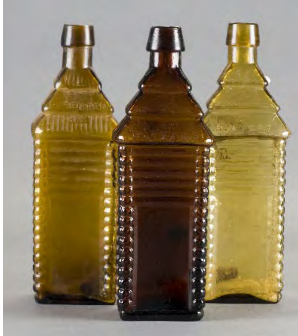
(Fig. 4. Drakes Plantation Bitters bottles)

The first advertisement noted for Drake's Plantation Bitters (Fig. 5) was in Harper's Weekly for July 11, 1863. Many other advertisements in the same vein, followed it. Two and a half years later, on December 30, 1865 to be precise, the identical advertisement was appended: "Only genuine when cork is covered by our private U. S. revenue stamp (Fig. 6). Beware of counterfeits and refilled bottles. P. H. Drake & CO., 21 Park Row, New York."