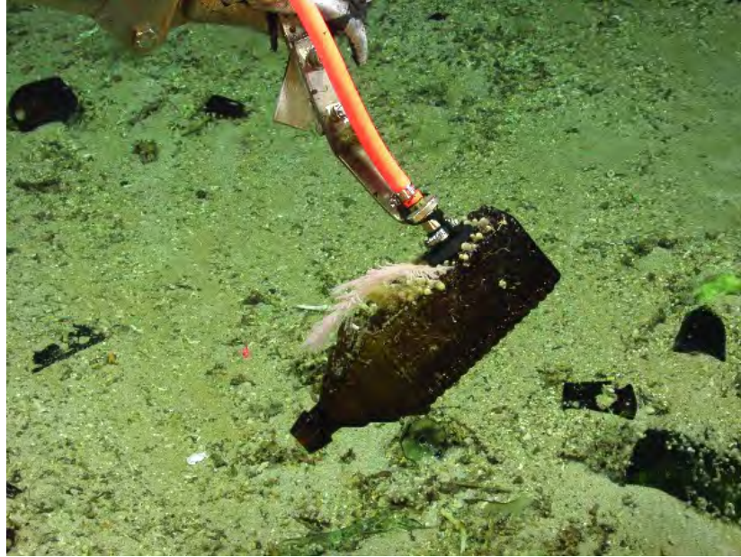
(Fig. 27. A soft limpet suction device attached to the 'manipulator arm' of Odyssey's Remotely Operated Vehicle)

The delicate artifacts such as bottles were carefully removed from the seabed using a soft limpet suction device attached to a manipulator arm of Odyssey's remotely operated vehicle ( Figs. 27 & 28 ).