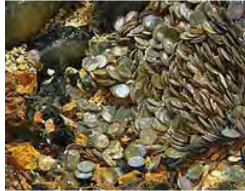
(Fig. 25. Photo of Civil War coins found underwater)

The 19 th century time capsule yielded coins ( Fig. 25 ) worth tens of millions of dollars and nearly 14,000 artifacts including a stunning assortment of ceramic goods, religious items, and elegant glassware bound for New Orleans to help restock merchant's shelves. Among the Republic's enormous shipment of goods were thousands of bottles ( including hundreds of Drake's cabin-shaped Plantation