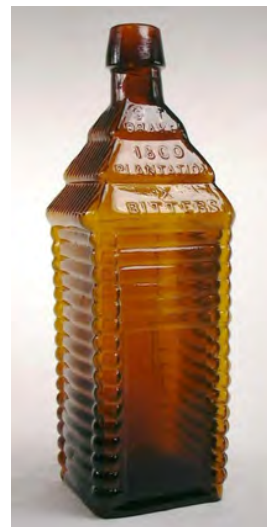
(Fig. 1. Typical Plantation Bitters bottle)