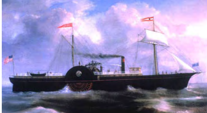
(Fig. 24. S.S Republic)

commission in December 1864. She was sold at auction in March 1865 toward the end of the war. She was re-named SS Republic , repaired, and soon returned to the New York – New Orleans route hauling passengers and cargo ( Fig. 24 ). She was lost on her fifth civilian voyage after the war.