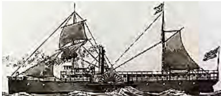
(Fig. 23. SS Tennessee)

The ship was built in Baltimore, Maryland for the War of 1812. She began her service as a merchant vessel plying the Baltimore – Charleston route. A short time later was used to open the first regular passenger steamship service between New York City and Central America. During the California Gold Rush, the Tennessee transported “49'ers” to the eastern shores of Panama so they could travel across the isthmus on their way to the California's Sierra Nevada Mountains and the goldfields.