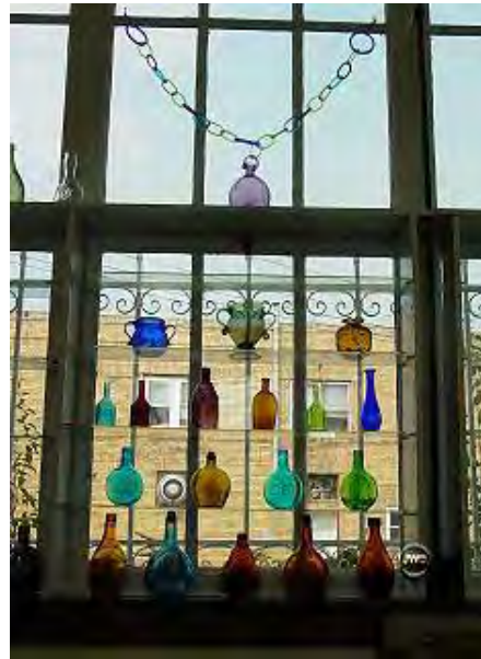
(Fig. 12. Display of historic bottles made at the Whitney glass works in Glassboro, N.J.)