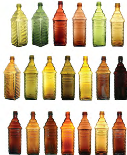
(Fig. 10. Twenty Drake's Plantation Bitters bottles in 20 different color variations [Ferdinand & Elizabeth Meyer collection])

Sidebar: [Since only one stamp was applied across the closure of each bottle, those numbers also represent the number of bottles manufactured – mostly at the Whitney Glass Works in Glassboro, N.J. – during the two time periods cited above. It's more than visually interesting to note that Drake's cabin-shaped bottles created at Whitney ended up being made in varying shades of light and dark amber, and brilliant shades of yellow olive and yellow topaz hues (Fig. 10). And there is at least one known specimen that was mold-blown in cobalt blue glass (Fig. 11).]