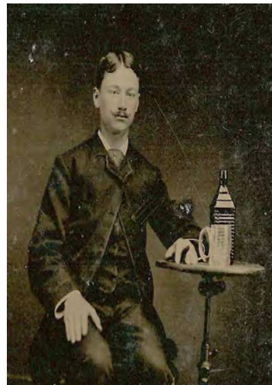
(Fig. 13. Daguerrotype of a man and a Plantation Bitters bottle)

The distinct cabin-shaped shape of the bottle made it a natural photographic subject!