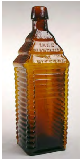
(Fig. 1. Typical Plantation Bitters bottle)

Researched, organized, Illuminated, and presented by