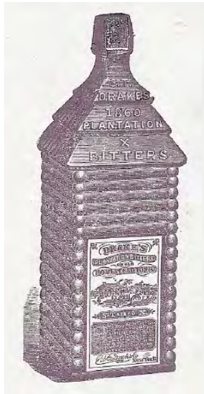
(Fig. 22. Earliest steel engraving of Drake's Plantation Bitters bottle from an advertising tradecard)