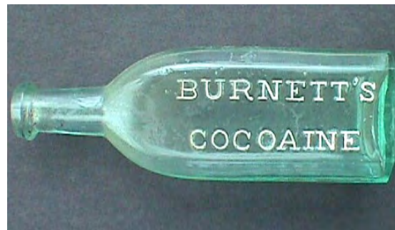
(Fig. 16. Burnett's Cocaine bottle)