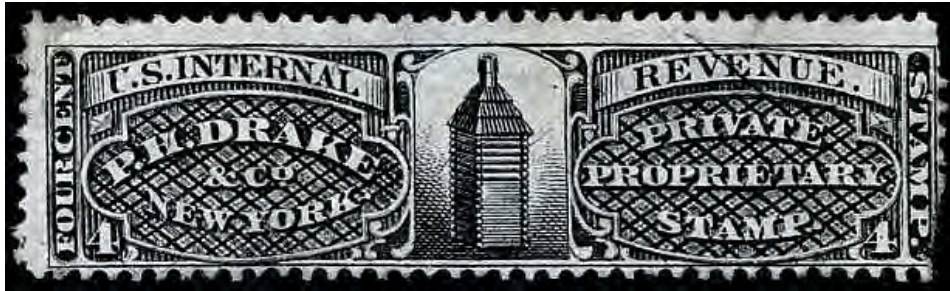
(Fig. 6. Private die Propreitary Revenue Stamp for Drake's Plantation Bitters)

affixing of a revenue stamp indicating the tax paid for each proprietary medicine manufactured and sold.