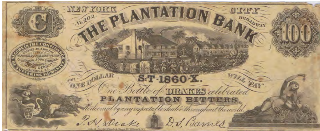
(Fig. 19. New York City Drake's Plantation Bitters $1 bank bill [obverse])