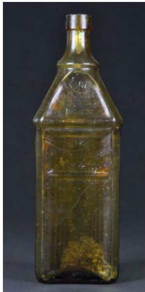
(Fig. 26. Uncommon "OK Plantation Bitters" bottle from wreck)

Bitters ). There were a few OK Plantation Bitters Bottles (Fig. 26) a cabin-shaped variant of Drakes that was not known until the 2003 salvage operation. Further findings consisted of over 6,000 glass and stoneware containers representing more than 175 types that had been stored in the ship's aft and forward cargo holds. Their various shapes and sizes boasted a potpourri bitters, inks, preserves, perfumes, and a plethora of other patent medicines.