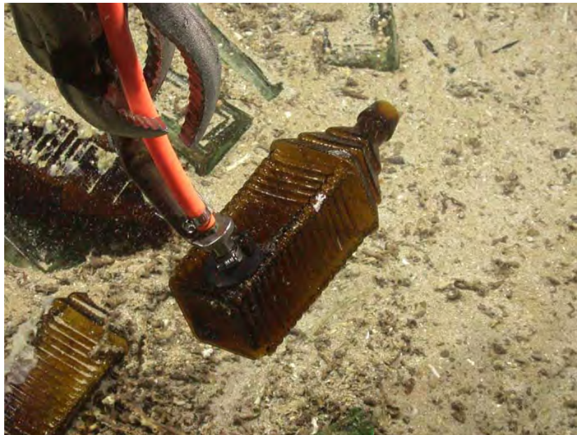
(Fig. 28. Drake's bitters bottle being gently recovered from the ocean floor)