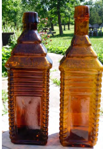
(Fig. 9. Plantation Bitters bottles of slightly different heights)

Records show that Patrick Henry Drake used 55,128 two-cent revenue stamps from January 1869 through June 21, 1871. He used 1,341,142 four-cent stamps (again, see Fig. 6) from January 1869 through March 1875