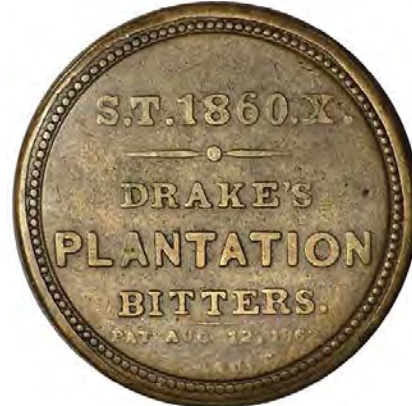
(Encased postage stamp coin [reverse])

These coin-like devices contained postage stamps in denominations from 1¢ to 90¢. The front, through which the stamp could be seen, was protected with mica. P. H. Drake & Co. used eight denominations of encased stamps as an advertising medium. On the back of each in horizontal embossed lettering: