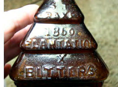
(Fig. 18. Close-up of Embossed Drake's slogan "S.T.1860.X")

“Nothing can be more simple, or, more appropriate than St. Croix Rum as the stimulating basis of the Plantation Bitters, and it is, therefore in accordance with the fitness of things, that St. Croix should