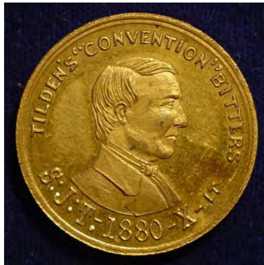
(Fig. 20. Obverse of the Tilden-Drake political medal)