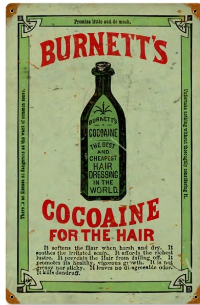
(Fig. 17. Burnett's Cocaine for the hair tin sign)

[P. H. Drake & Co. was joined by other businesses in the use of advertising-embossed encased postage to advertise their goods and services; these included the Aerated Bread Company; Ayers Sarsaparilla and Cathartic Pills; Burnett's Cocaine [sic] for the hair (Figs. 16 & 17); Sands Ale; and of course, Drake's Plantation Bitters; Buhl & Co. Hats and Furs; Lord & Taylor; Tremont House, Chicago; Joseph L. Bates Fancy Goods; White the Hatter, New York City; Ellis McAlpin & Co. Dry Goods, Cincinnati.]