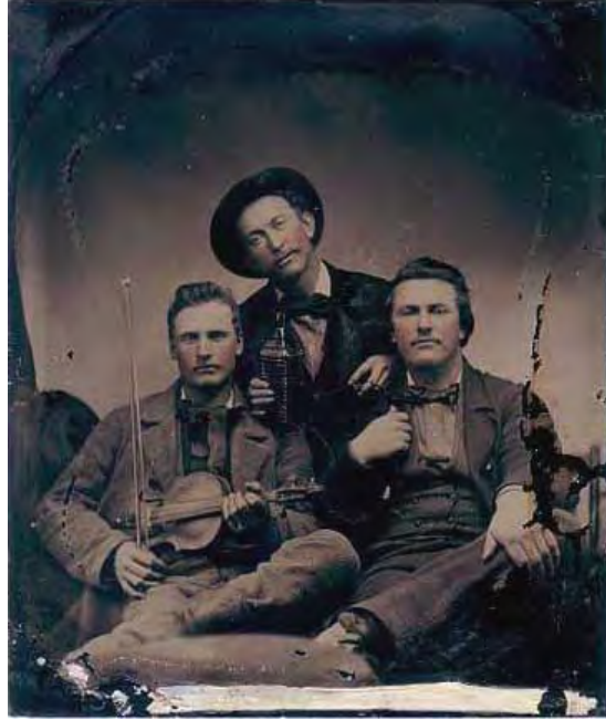
(Fig. 14. Tintype of young men posing with a Drake's Plantation Bitters bottle and violin)