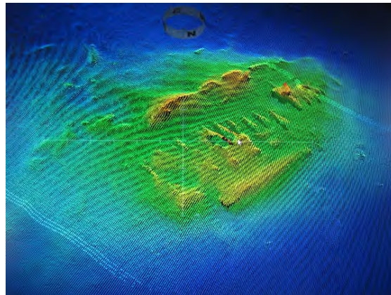
(Fig. 29. A sonar image of the Civil War ship USS Cumberland)

The USS Cumberland ( Fig. 29 ) was sunk on March 8, 1862, during the Battle of Hampton Roads. The Ship was part of the U.S. Navy's North Atlantic Blockading Squadron and was sunk after being rammed by the Confederate ironclad CSS Virginia, which was formerly the USS Merrimack. More than 120 men died.