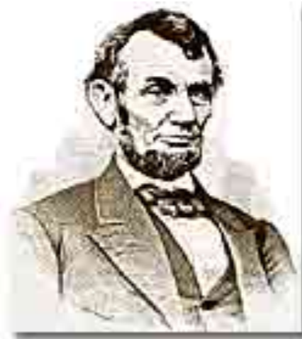
(Fig. 7. Abraham Lincoln)

The white label on bottles of Drake's bitters (Fig. 8) is said to have read in part "Drake's Plantation Bitters. Composed of pure St. Croix Rum, Calisaya Bark, and other Roots and Herbs and is a most effectual Tonic, beneficial appetizer and wholesome stimulant, imparting tone to the stomach and strength to the system. Unequaled for Family, Hotel, and Medicinal use, 75% alcohol."