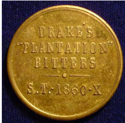
(Fig. 21. Reverse. of the Tilden-Drake political medal)

The reverse of the medal ( Fig. 21 ) features the famous cryptic slogan that Drake used successfully to promote his Plantation Bitters.