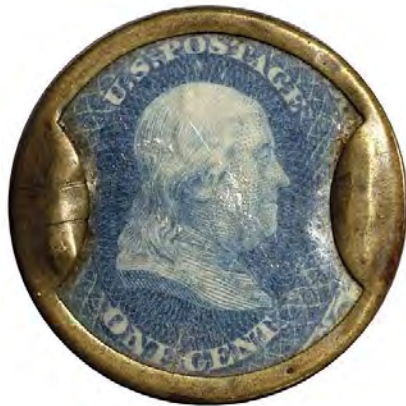
(Encased postage stamp coin [obverse])