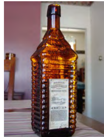
(Fig. 8. Labelled drakes-plantation-bitters-patent-medicine-bottle)

There were two sizes of bottles: "...the earlier measured 2.5" by 2.5" by 10" tall and the later one, 2.75" by 2.75" by 9.75" tall (Fig. 9).