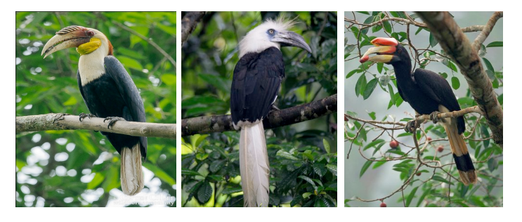
Aceros subruficollis Berenicornis comatus Buceros rhinoceros Figure 1. Hornbill species in Tropical Africa and Asia (Ch'ien, 2016)

Note: *Any species that is likely to become an endangered species within the foreseeable future throughout all or a significant portion of its range. **Any species is likely to become endangered unless the circumstances threatening its survival and reproduction improve.