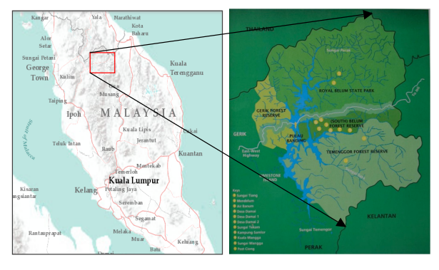
Figure 3. Location of the Royal Belum–Temengor Forest Complex (JPSM, 2016), 5°N Latitude and 101°E Longitude at elevations between 130 m and 1500 m

The next process is generating land use maps using the ERDAS Imagine digital image processing. Classification was performed to extract the different spectral statistical classes from the satellite images. The training fields were carried out on the Landsat satellite image. There were 21 sampling pixels to derive rainforest land cover map for the satellite image