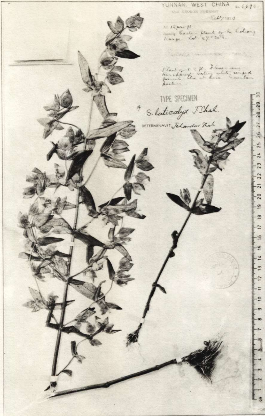
Plate 5. Holotype of SWERTIA LATICALYX J. Shah George Forrest No. 6696 (F)