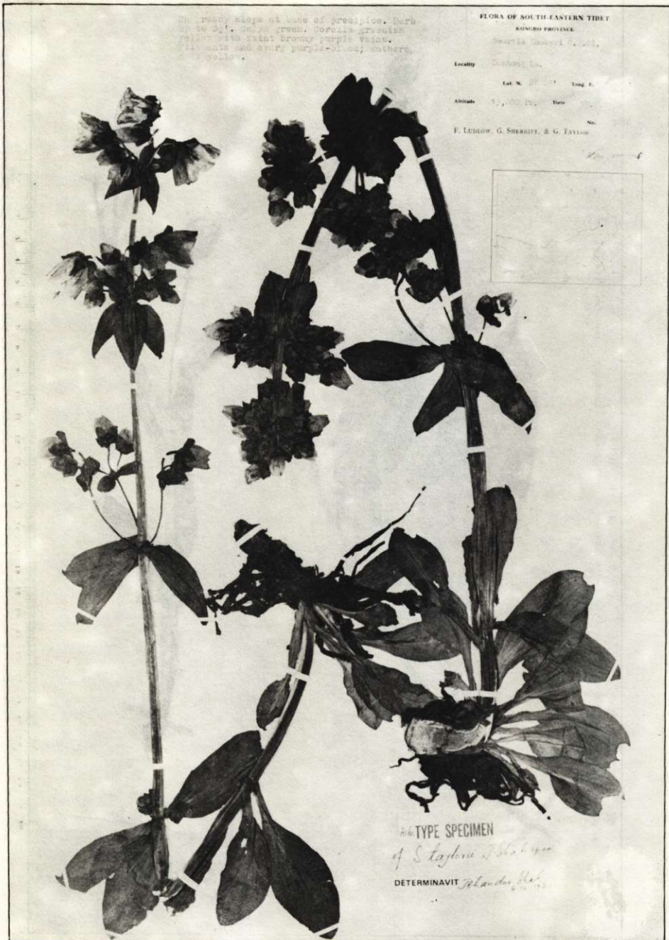
Plate 2. Holotype SWERTIA TAYLORII J. Shah (BM)