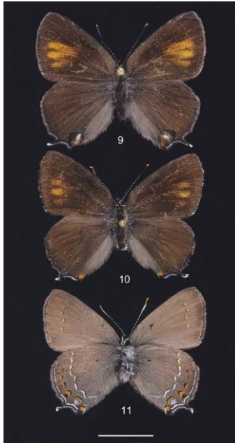
Figs 9-11. Male Satyrium ilicis from Greece, Sími Island, Pédi, near sea level, 24.iv.2010. 9, 10. – Upperside. 11. – Underside. 9. – White spot near HW anal angle due to dried abdominal fluid. Scale bar equal to 1 cm.