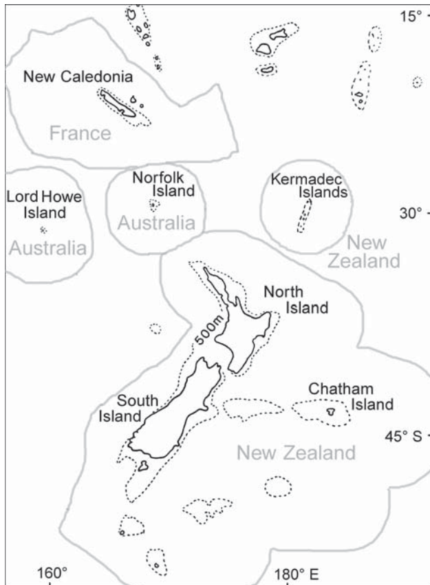
Fig. 1. Study area. The boundaries of the southwestern Pacific EEZs are indicated by grey lines.

The checklist also includes detailed information on the distribution of the species around southwestern Pacific island groups, including New Caledonian regions as well as the continued southerly ridges including Lord Howe Island, Norfolk Island and New Zealand. New Caledonia is abbreviated “NC”, Australia “AU”, New Zealand “NZ”; the regions are numbered 1–30 (Fig. 2); a number without brackets indicates a confirmed record from the region, a number in brackets indicates an expected distribution in the region without a confirmed record. The list also includes information on the general habitat (marine, transitional water or freshwater), and the depth range. The name ‘transitional water’ is used instead of ‘brackish water’ due to terminology in the European Water Framework Directive.