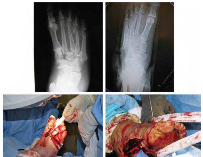
Figure 7. B-2 type laterally divergent type fracture patterns (with compartment syndrome).

This axial traction technique also has many advantages over using a reduction clamp. Kling or Kerlix rolls are easily retracted out of the way to allow for a better field of view as compared to a bone reduction clamp, which can occlude the operative site and make K-wire and screw placement more challenging. Also, use of a reduction clamp can put