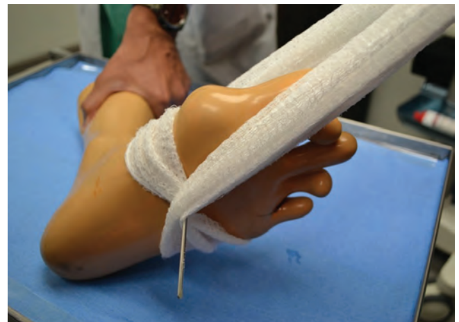
Figure 5. Divergent displacement.