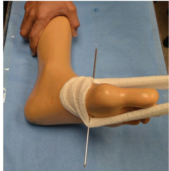
Figure 4. Medial displacement.