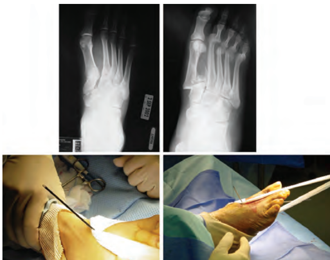
Figure 6. B-1 type medially divergent fracture patterns.

Between 2000 and 2008 (with 5-year follow up to 2013), this technique was used on 12 focus cases, and contrasted with 38 cases, using other forms of reduction during the same period (Figures 6, 7). Five of the 12 focus cases involved the left foot while the remaining 7 of 12 focus cases involved the right foot. There were no bilateral cases in this series. The patients range in age from 19 to 75-years-old. There were 2 females and 10 males. Two of the cases were type A, 4 of the cases were type B-1, 3 of the cases were type B-2, 2 of the cases were type C-2, and 1 of the cases was a type C-1. In all of these cases this technique, dubbed "axial traction technique" was used to reduce the Lisfranc dislocations. Once anatomical alignment was achieved, the Kling or Kerlix was held in place until permanent fixation could be achieved, either percutaneously or with open placement of screws/plates. Though the method of permanent fixation varied in each of the 12 focus cases, the method of reduction was constant.