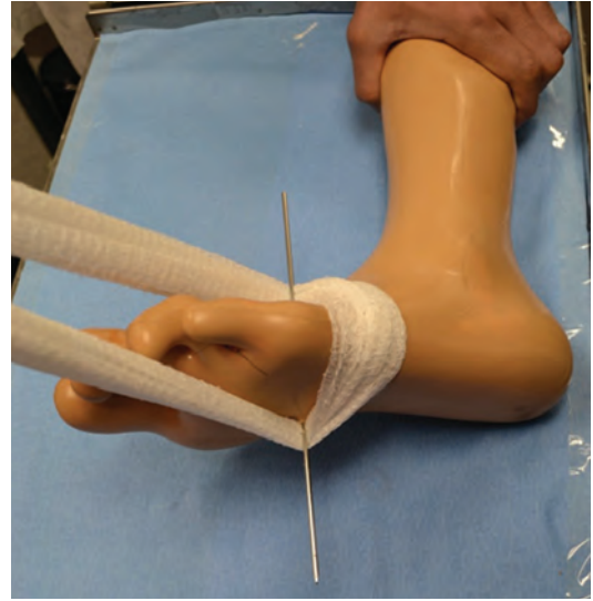
Figure 3. Lateral displacement.

In a type B-1 injury, the Kling or Kerlix is placed proximal to the Steinmann pin and then wrapped medially around the foot, with free ends of the Kling or Kerlix passing around the lateral side of the Steinmann pin. Just as with the lateral displacement, the free ends of the Kling or Kerlix are pulled anteriorly to provide simultaneous distraction of the second metatarsal and gentle, constant compression placed against the medial side of the foot over the base of the first metatarsal. In the event of a C-type injury, in which there is both medial and lateral displacement, two Kling or Kerlix rolls are used, one medially, the other laterally. Both Kling or Kerlix rolls will transit from proximal to the Steinmann pin. One will be passed laterally around the foot and the other will be passed medially around the foot (Figures 3, 4, 5). The free ends of the Kling or Kerlix that were passed laterally should exit around the medial side of the Steinmann pin, as the medially passed Kling or Kerlix's free ends should exit around the lateral side of the pin. The