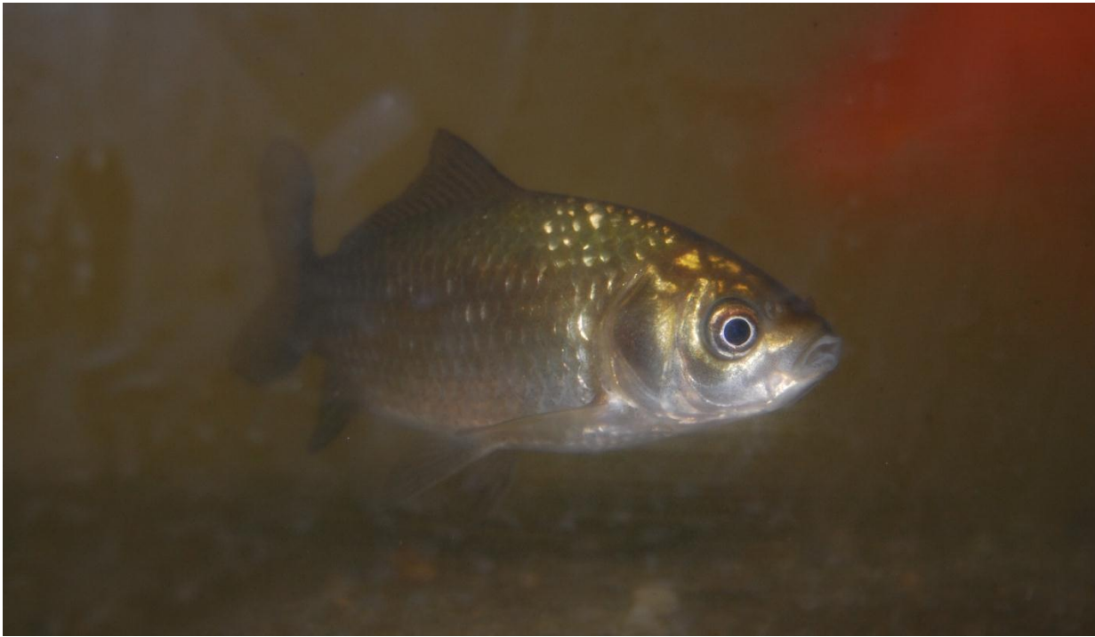
Figure 1. The prussian carp, C. gibellio (source: original).

Hybridogenesis in Poeciliopsis . There are species that have abandoned classical gonochoric reproduction and are now mainly based on hybridogenesis. It is interesting for this type of reproduction that the resulting offspring are hybrid, but the genetic material of paternal origin is aborted after one generation and replaced with another paternal set of chromosomes, but also for a single generation. This type of reproduction is also called sexual parasitism, is present in the genus Poeciliopsis and is shown simplified in Figure 2.