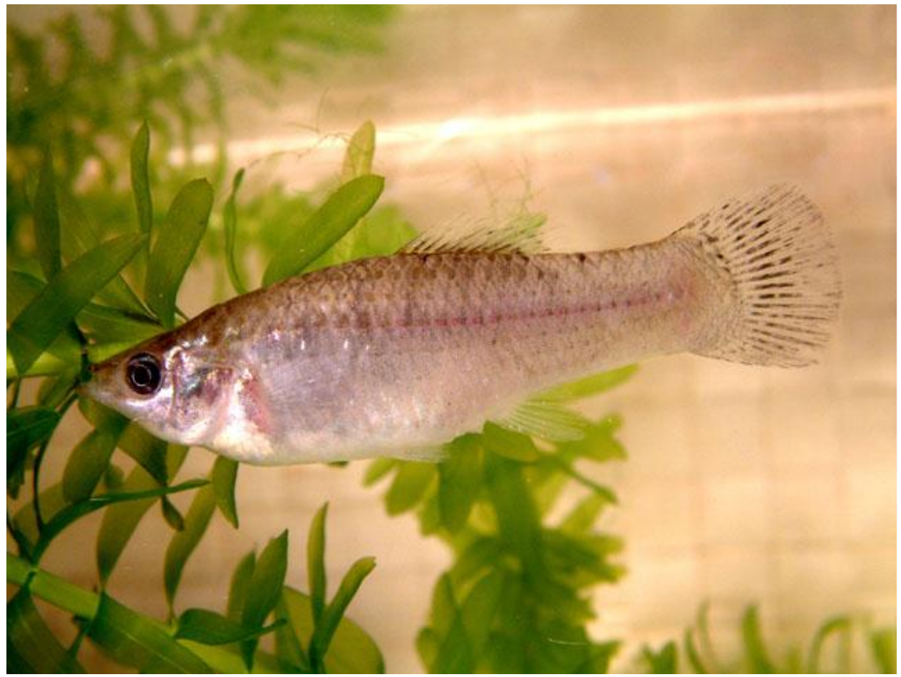
Figure 4. Poecilia formosa , the Amazon molly.

in P. formosa . However, more research is needed to explain the species survival in absence of genetic recombination.