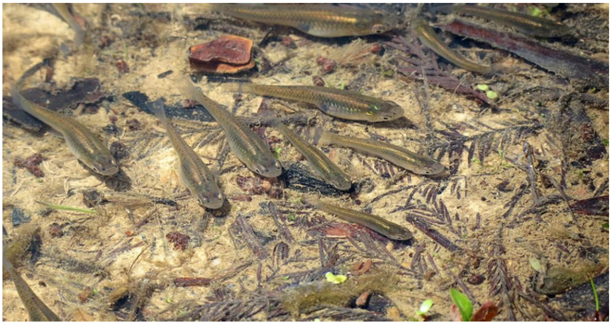
Figure 4. The mosquitofish. Schooling in standing or slow flowing water.

G. holbrooki is a natural prey of some species of fishing spiders of the genus Dolomedes (Pisauridae, eg. D. okefinokensis in United States, D. plantarius in Italy, and D. triton in United States) (Nyffeler & Pusey 2014). IUCN Red List status: least concern (LC) (IUCN 2020).