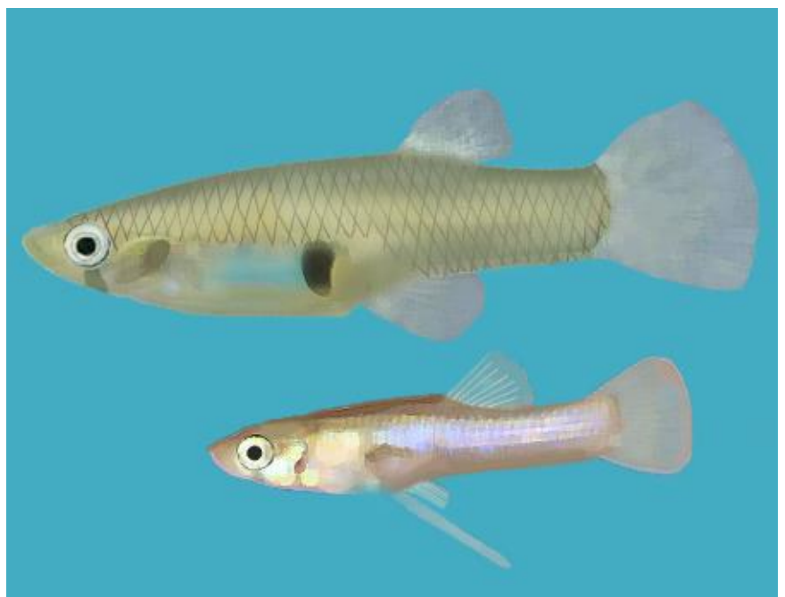
Figure 1. The mosquitofish, Gambusia holbrooki.