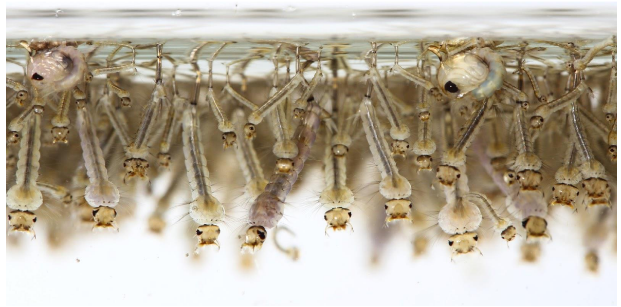
Figure 3. Mosquito larvae.

Size and morphology . Females measure 4-5 cm, while males, less numerous, are small, 2.5-3.5 cm (Iacob & Petrescu-Mag 2008). The maximum reported length was 4.7 cm TL male/unsexed (Tarkan et al 2006); 7.0-8.0 cm TL female (Gavriloaie & Berkesy 2013; Froese & Pauly 2020). Dorsal spines (total): 1; dorsal soft rays (total): 7; anal spines: 1; anal soft rays: 9 (Froese & Pauly 2020).