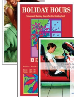
8.5" x 14" Legal