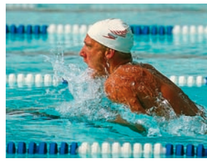
With HD Color technology

Unique HD (High Definition) Color technology – For print quality that visibly enhances your documents, HD Color technology combines OKI Printing Solutions’ multilevel LED printheads, unique microfine toner, a straight-through paper path, and enhanced color software to provide greater depth of detail and color, and a high gloss finish, even on ordinary office paper.