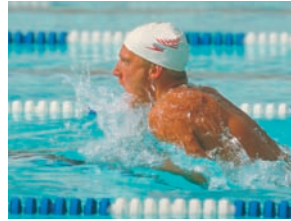
Without HD Color technology