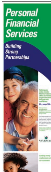
8.5" x 48" Banner