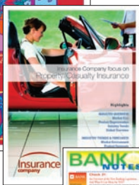
8.5" x 11" Letter