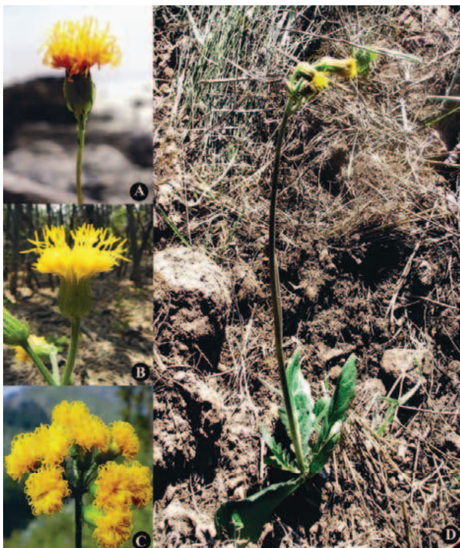
Figure 2. A. Gynura calciphila var. calciphila ; B. G. calciphila var. dissecta ; C. G. cusimbua ; D. G. pseudochina