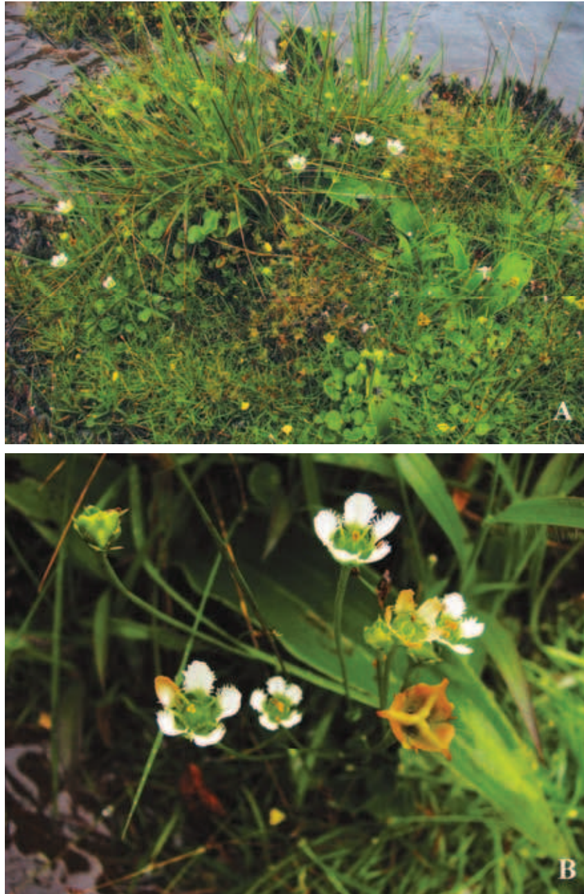
Figure 2. Parnassia mysorensis Heyne ex Wight & Arn. A. natural habitat, open sandstone area at 2,100 m alt., Phu Soi Dao, Phitsanulok province; B. flowers and fruits, same locality.

Specimens examined: Beusekom & Phengklai 2251 (BKF); Shimizu et al. T-19039 (BKF); Smitinand 11846 (BKF).