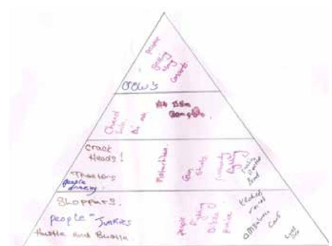
Figure 12. Sound pyramid made by group b3.

The sound pyramid is based on the concept of sound as three-dimensional. The design of the pyramid guides the participants to think of sound in terms of layers, each one sitting on top of the other (see: Figure 11 and Figure 12). Acoustically this is not the case, however, as a visual prompt it worked better than the maps in stimulating a discussion. The students were asked to see the bottom layer of the pyramid as the space for sounds that are constantly around them or in the background, and the top layer as sounds that are heard less frequently. The sound pyramid created a very different focus, a more discursive process, in general, it allowed individual voices to emerge within the group. It also created a debate over what constituted key sounds in a space.