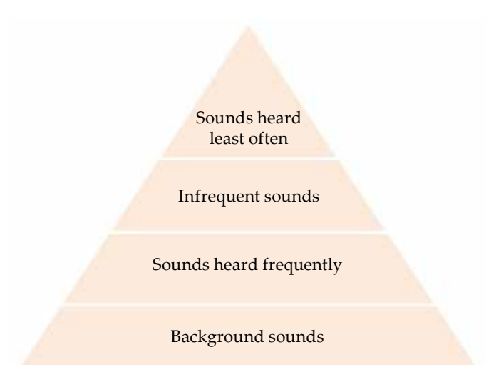
Figure 11. Sound pyramid.

The map was altered twice during the fieldwork phase, the first iteration created problems simply because these maps were primarily focused on specific sites and points of reference, it was decided that a sound pyramid would replace the geographical map. This involved removing the markers of physical space, such as lines and trajectories, and replacing them with a sonic construct (see: Figure 11).