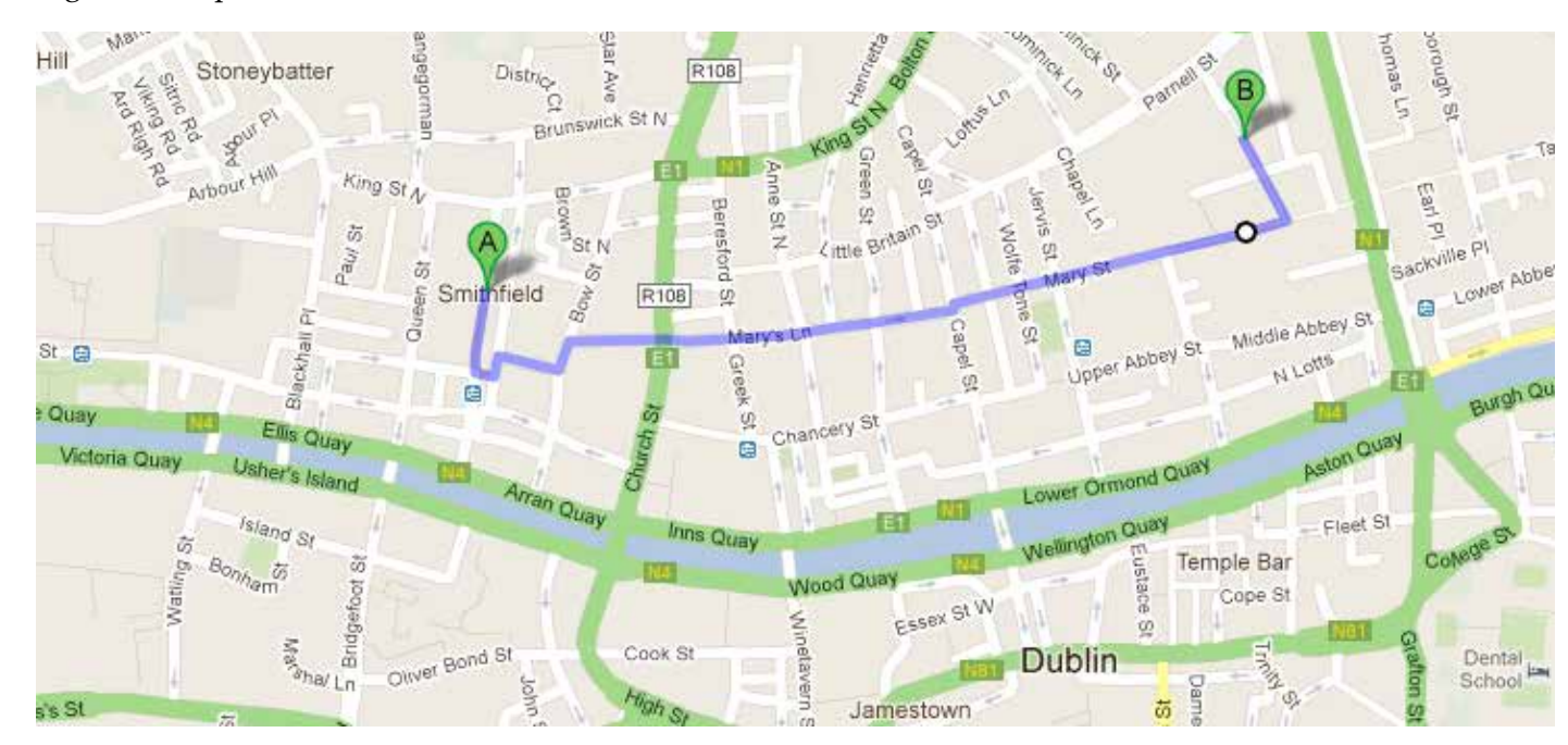
Figure 3. Map of soundwalk.

The first walk took place on the 9<sup>th</sup> of September 2010 and began at the Smithfield market at 4am (see: Figure 4). During the walks, I witnessed very different social and economics rhythms, which created a unique soundscape in the city. The working day was at least two hours away for the rest of the city, presenting a much quieter soundscape. Exploring this one area, Smithfield, meant examining a distinct soundscape within Dublin.