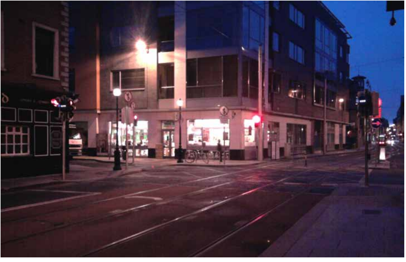
Figure 4. Dublin streetscape, 4am.