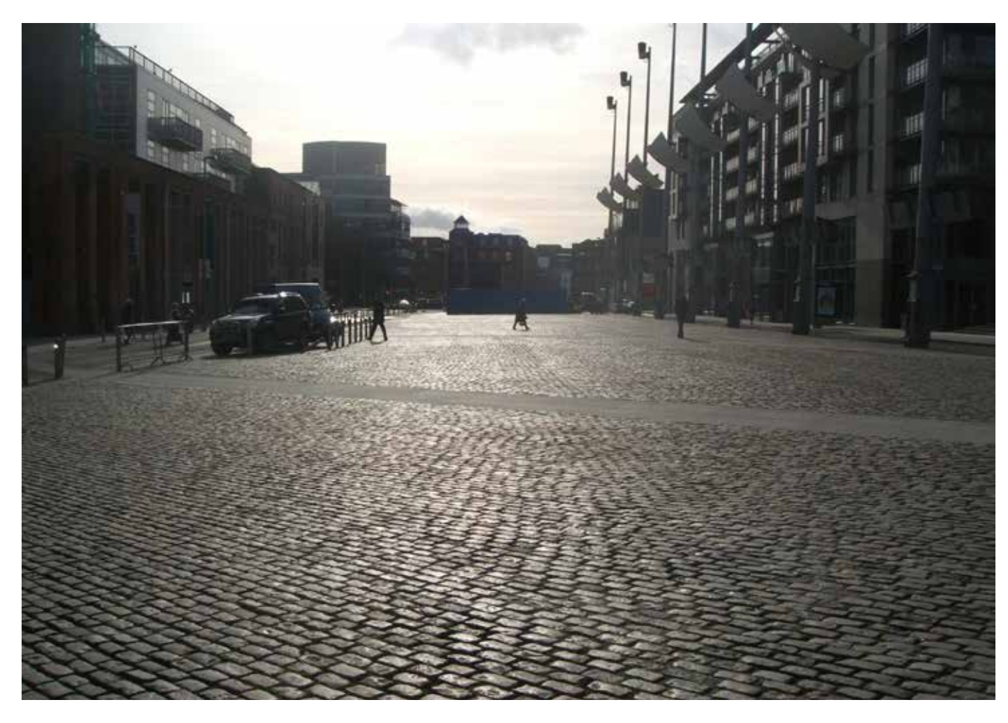
Figure 7. Smithfield Square, 2012.