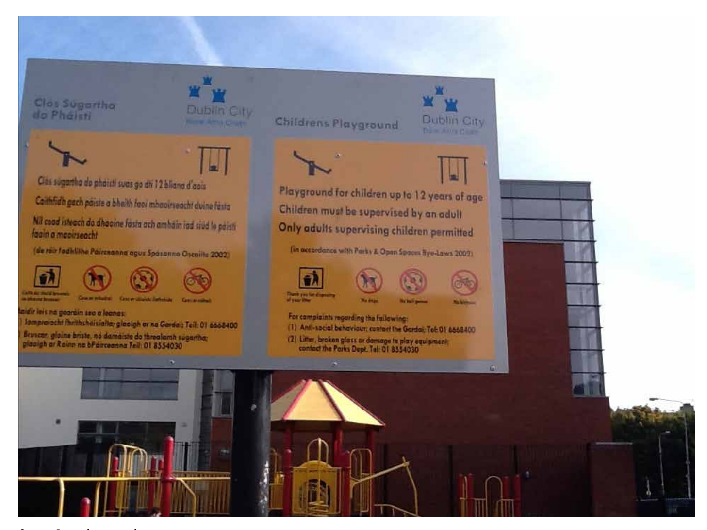
Figure 8. Public playground, Dublin inner city housing complex.