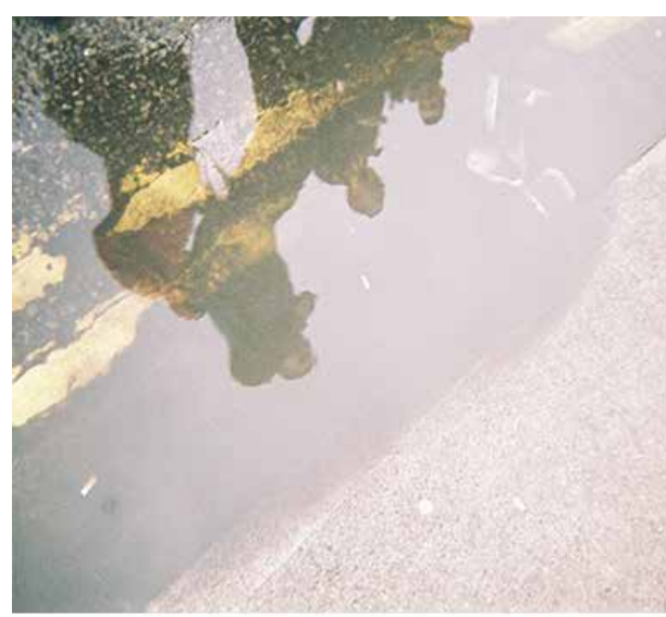
Figure 9. Images taken by teenage participants on their soundwalks.

era, or with the digital recorder, how to distinguish singular sounds within the larger melee of an urban soundscape. In addition, it was observed that during the soundwalks, the boys were less comfortable approaching certain groups such as buskers, street market sellers, small children, et cetera, whereas the girls felt quite comfortable walking up to people to record their sounds. The boys also tended to walk in larger groups; it was difficult to separate them out so that they could record sounds. Girls often went off either in pairs or individually to record sounds.