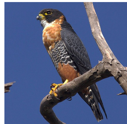
The Orange-breasted Falcon is one of the rarest falcons in the world.

Further west in the dry chaco forest and recently cleared agricultural land in Chaco, Santiago del Estero, and Salta provinces we should encounter Bay-winged Hawks , increasingly commoner White-tailed Hawks , and if we are lucky a Crane Hawk or two. With all probability we will see several Aplomado Falcons here, and maybe even one or two Peregrines .