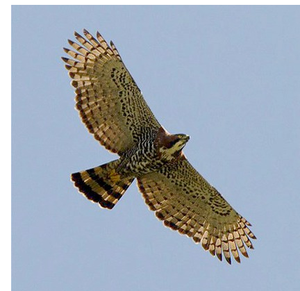
Ornate Hawk-Eagle is a powerful predator that frequently soars above the forest.