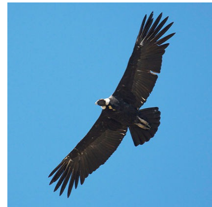
Andean Condor. Adults like this female are jet-black underneath.

This tour combined with our Raptors & Pumas of Patagonia tour will allow you to target 57 species of raptors, plus Pumas, in three weeks—an absolute record for any raptor tour we have run so far in South America!