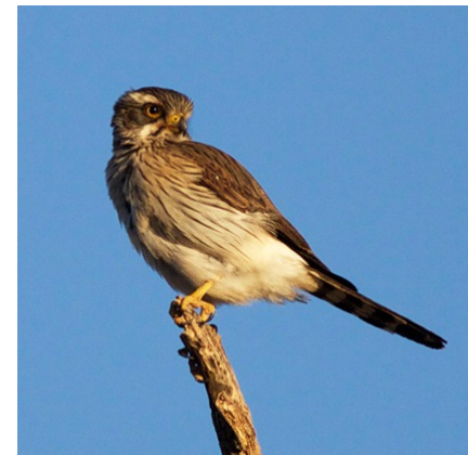
Spot-winged Falconet is nearly endemic to Argentina.