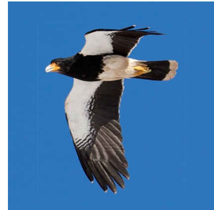
Mountain Caracara is rather tame. We should get good views of it up the puna.

Breakfast and checkout, then drive around looking for the huge multi-thousand bird flocks of wintering Swainson's Hawks . This is mostly agricultural habitat and an extensive net of dirt roads will serve us well to approach the hawks feeding on