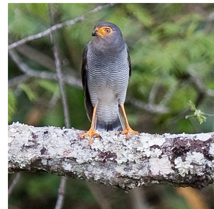
Finding Barred Forest Falcons is hard work, but it pays off!

Optional forest falcon search early in the morning. Then breakfast and horseback ride to get to higher areas where King Vulture ,