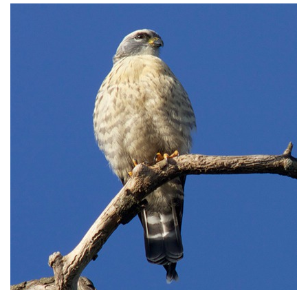
Juvenile Plumbeous Kite. Note long primaries projecting beyond the tail tip.

Super early start (4.30 AM) to target Collared Forest Falcon. Then back to hotel for breakfast, and out again to target soaring raptors including Rufous-thighed, and Gray-headed Kites, and with a little luck Ornate Hawk-Eagle. Back at the hotel we’ll