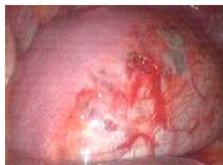
Figure 2 showing diaphragmatic fenestrations