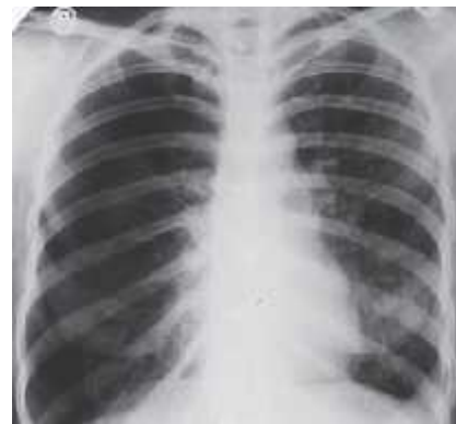
Figure 1 Chest Xray showing right sided pneumothorax

120/80 mm Hg, respiratory rate 24 /min with Spo2 94 percent in room air.