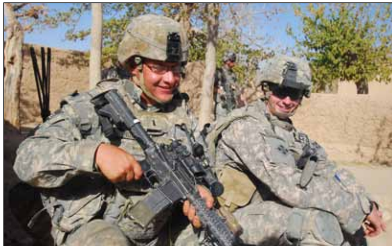
Soldiers pose for a quick snap while on patrol. Below, a family enjoys some chai and nan (fresh bread).