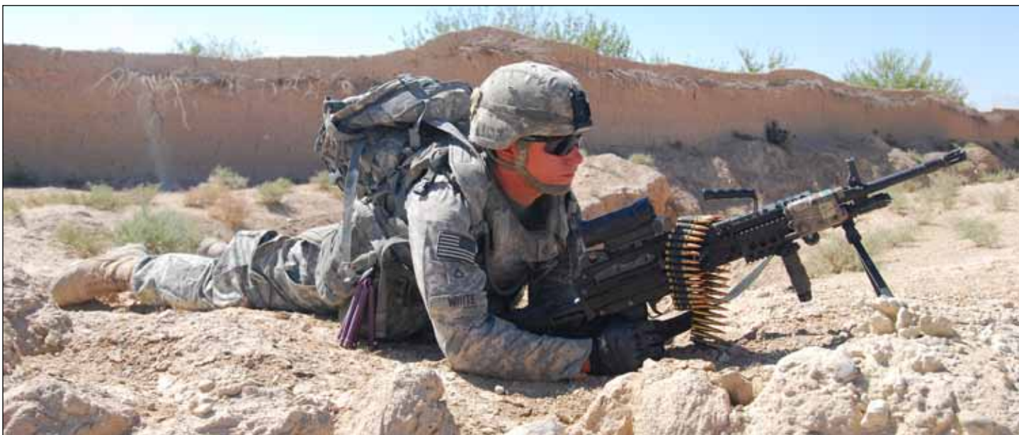
A Soldier pulls security during a patrol Aug. 19 near FOB Ramrod.