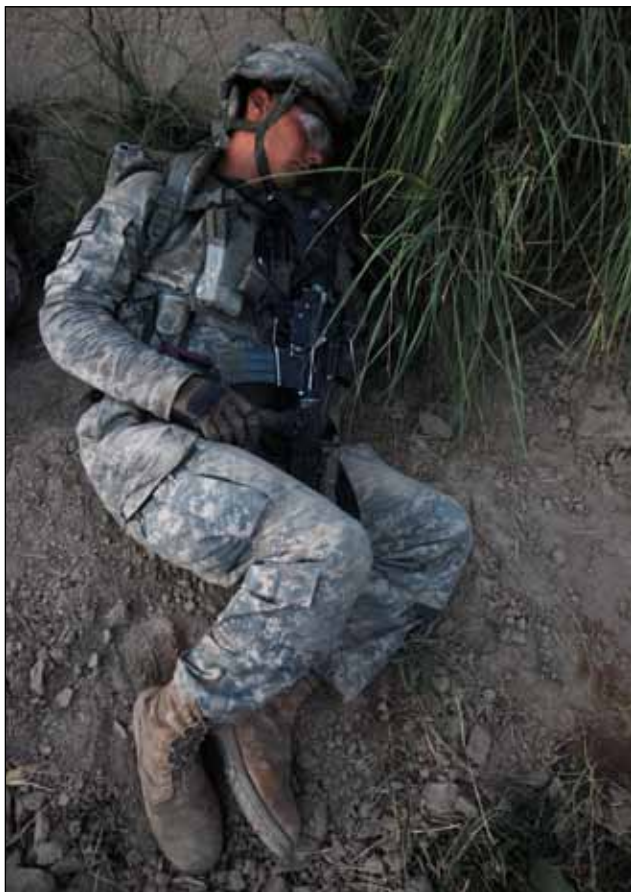
You sleep when and where you can. A Soldier grabs a quick nap during Operation Tora Arwa V.

Photos of the Battalion throughout the month.