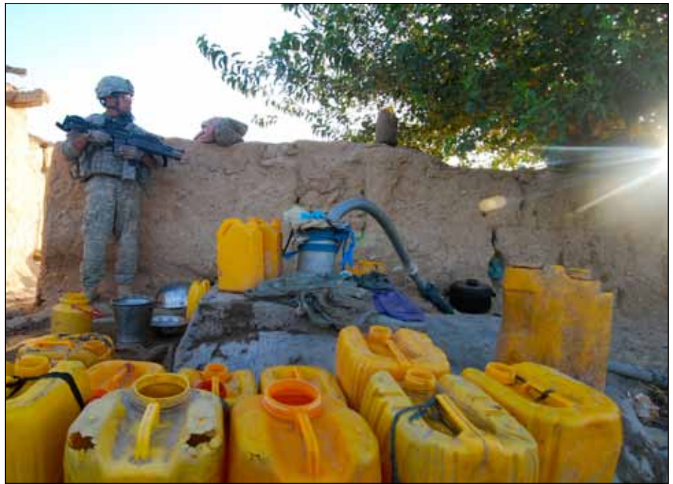
Soldiers on patrol. Left, an Afghan girl clings to her father after he poured water on her to cool her off.

A s we prepare for the next month of missions and activities, we cannot help but think of our family and friends back home. Again, it is your continued and unwavering support that encourages us to do the best job we can -- even when times are tough. You are the hope we hold on to when we need it the most. Thank you for all you do back home and for your thoughts and prayers.