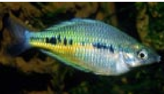
Fig. 7. G. maculosus , adult male about 50 mm SL, from the Omsis River, Papua New Guinea. G.A.