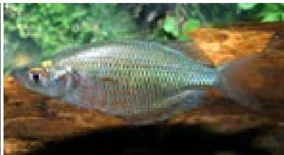
Fig. 8. G. multisquamatus , adult male about 80 mm SL, from the Mamberamo River, Irian Jaya. G.A.