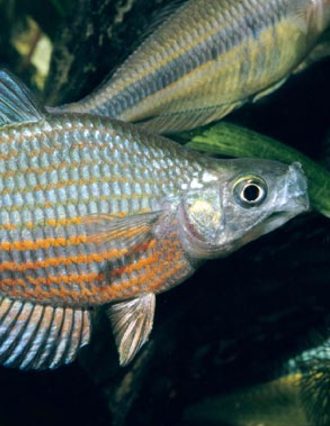
Fig. 2. Glossolepis dorityi , adult male about 80 mm SL, from Lake Nenggwambu, Irian Jaya.