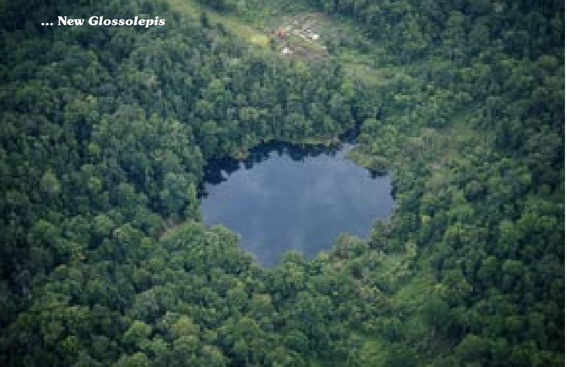
Fig. 3. Areal view of Lake Nenggwambu, Irian Jaya, the type locality of Glossolepis doryti .