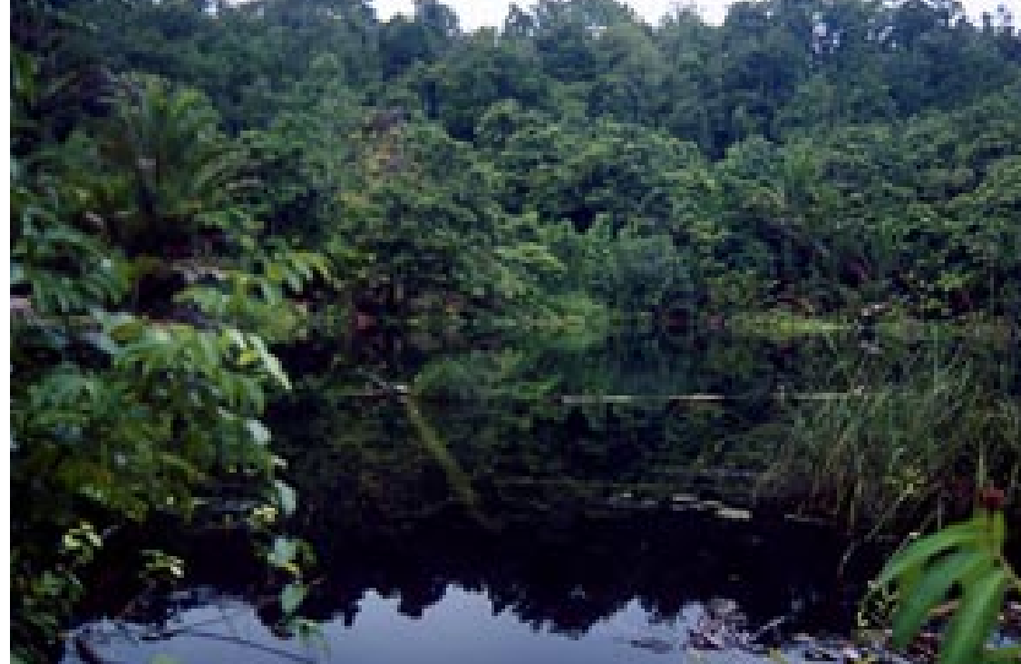
Fig. 4. Lake Nenggwambu, Irian Jaya.