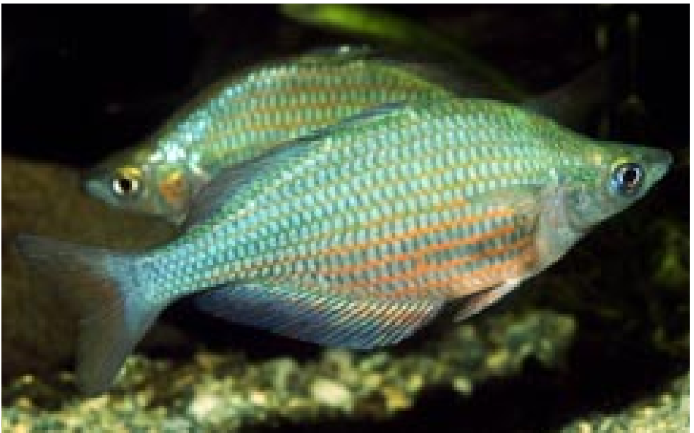
Fig. 1. Glossolepis dorityi , adult male about 90 mm SL, from Lake Nenggwambu, Irian Jaya.

Paratypes (collected with holotype): WAM P.31761-001, 14 specimens, 78.3–115.0 mm SL.