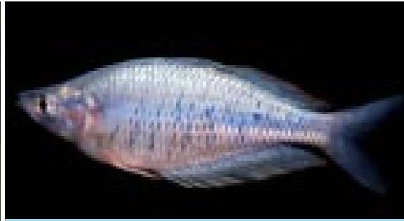
Fig. 6. G. leggetti , adult male 73 mm SL, from the Tiawiwa River, Irian Jaya. G.A.