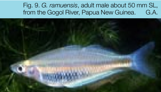
Fig. 9. G. ramuensis , adult male about 50 mm SL, from the Gogol River, Papua New Guinea. G.A.