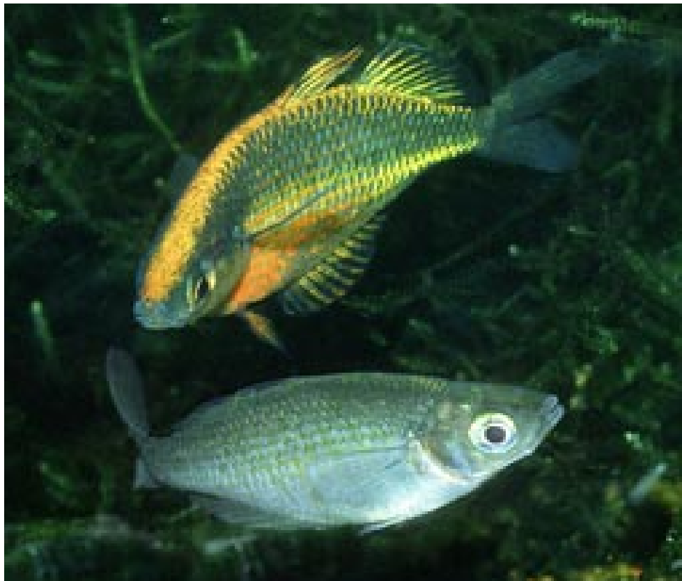
Fig. 11. Glossolepis multisquamatus , adult pair about 65 mm SL, from the Sepik River, Irian Jaya. An excited male displaying to the female with glorious colours in Neil Armstrong's aquarium. R.K.