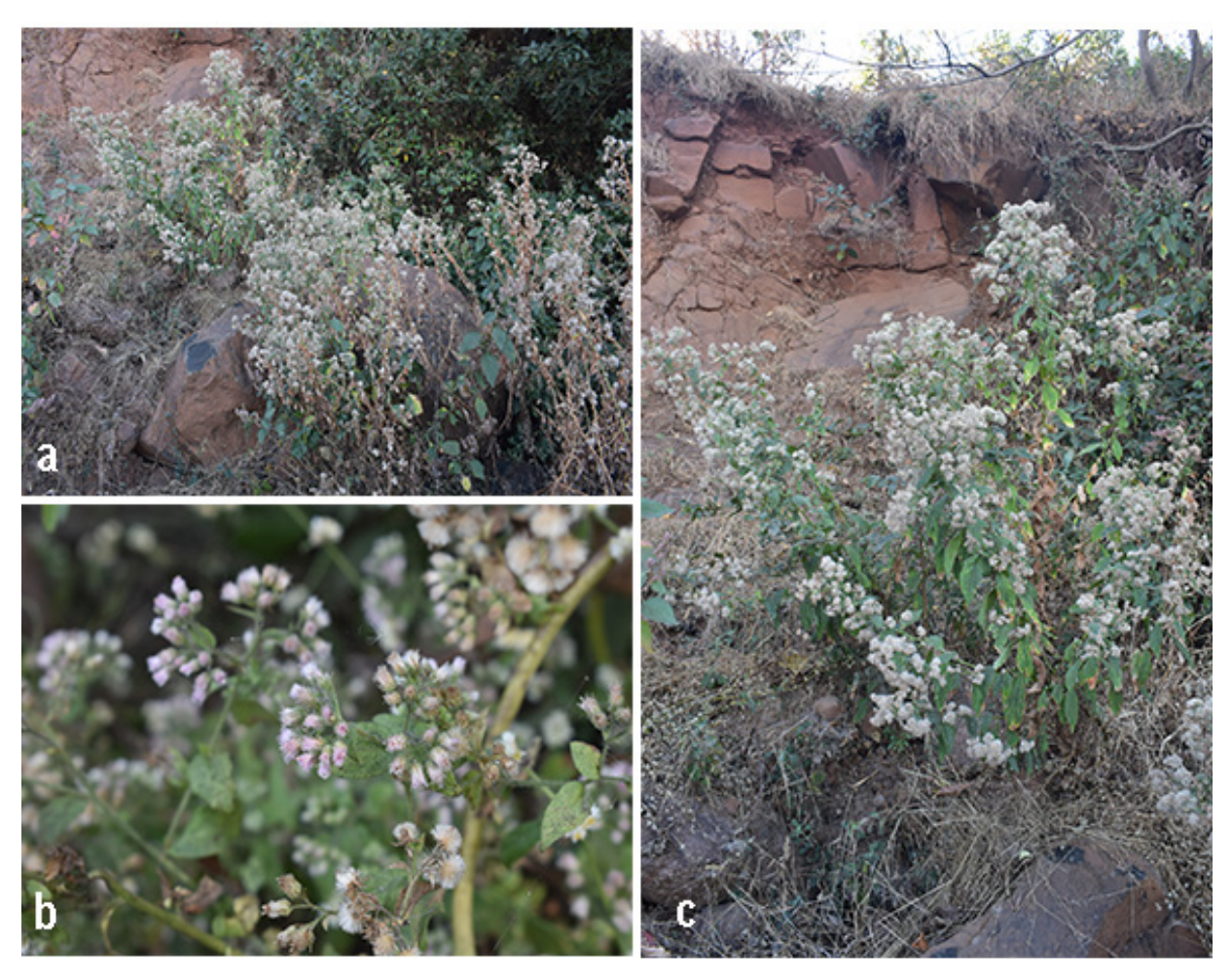
Fig. 3. Thespis thakeri J.J.Sharma & Nagar: a, c. Plants in natural habitat; b. Flowering twigs.

Specimen examined : INDIA, Gujarat , Dang district, Saputara, 869 m, N 20°34'52.68", E 73°44'49.91", 07.01.2023, Jaydeep J. Sharma 081 (BARO).