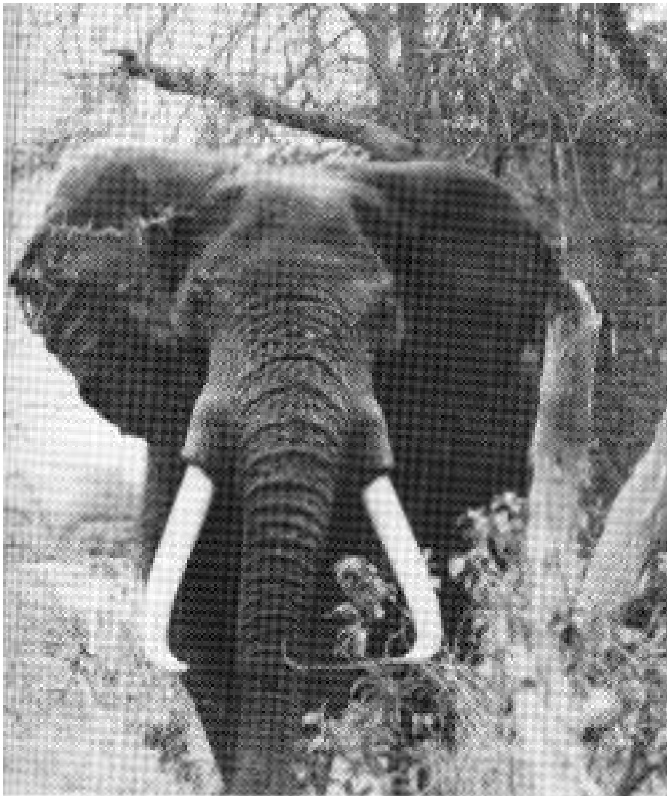
Kilimanjaro elephant after dining out in Amboseli