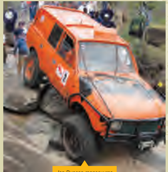
Ian Duncan manoeuvres