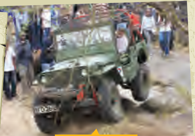
Jas Sehmi, back wheels up