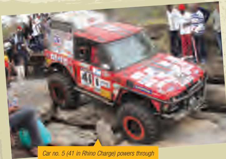
Car no. 5 (41 in Rhino Charge) powers through