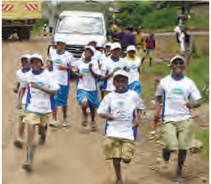
Students running in Kipipiri.