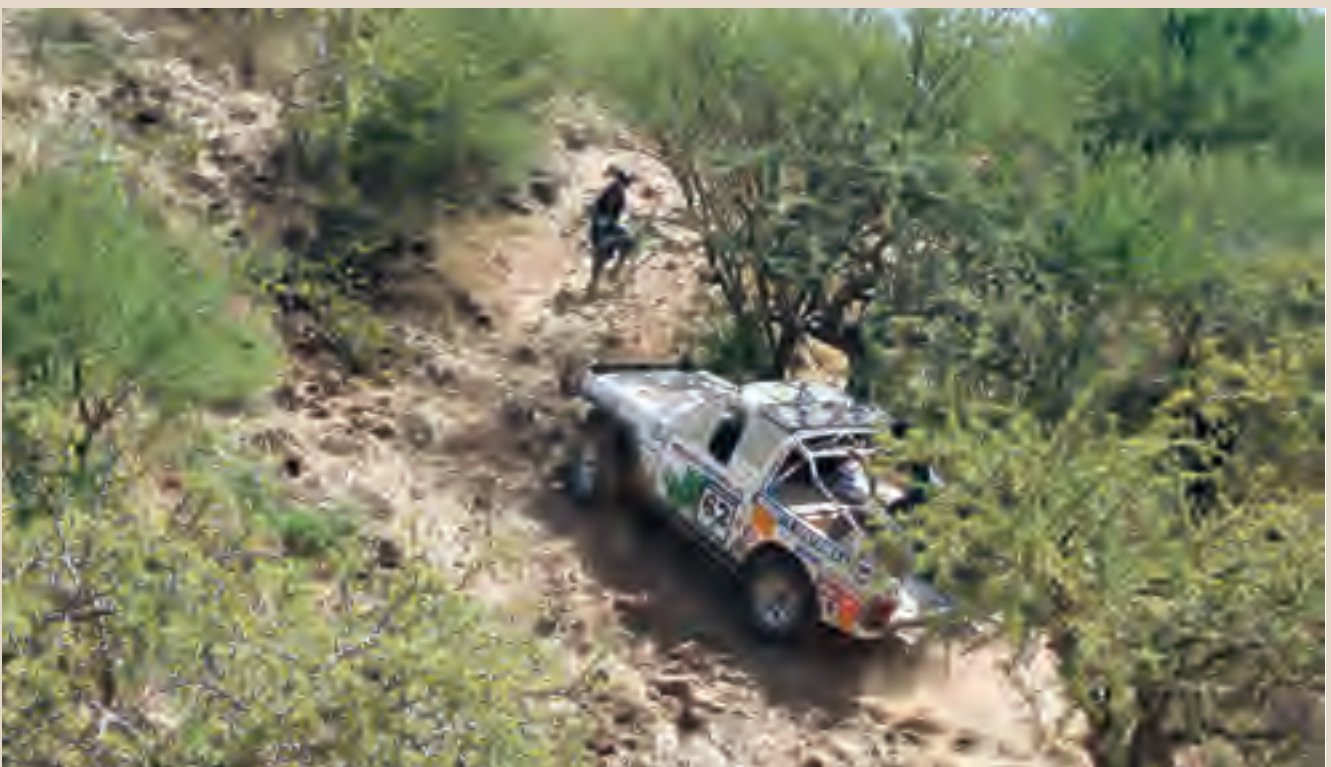
Stanley Kinyanjui's Car 62 manoeuvres through the gauntlet

The maximum 65 slots available for the 2011 Rhino Charge were filled by September 1, 2010 for the event to be staged - who knows where - on June 3, 2011.