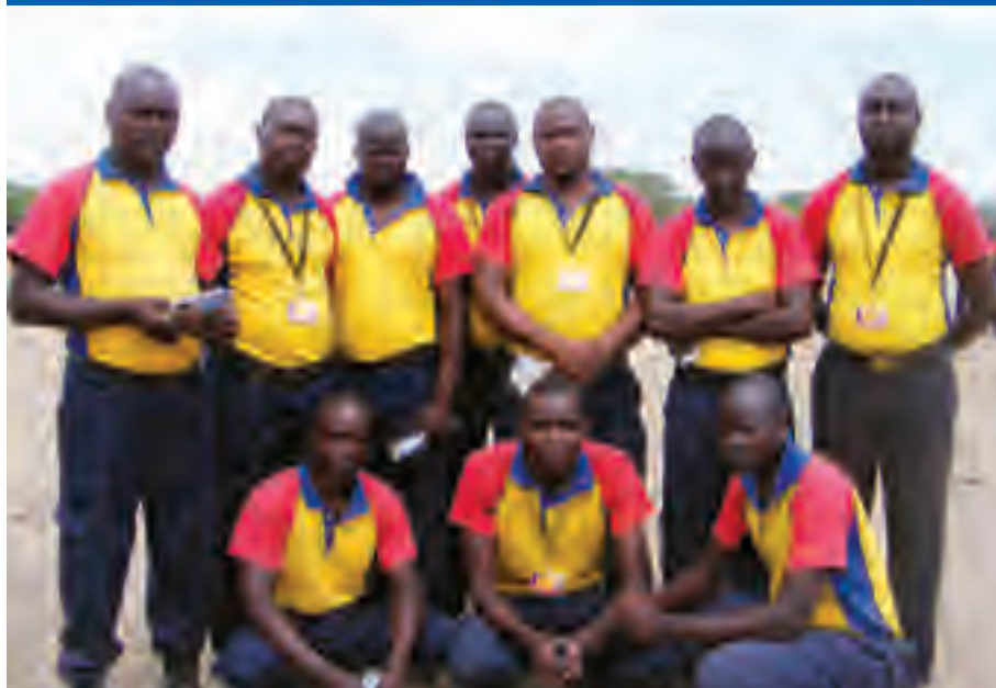
For the fifth year running, KK Security provided 24 hour security at the entire venue check-in, information tent, gauntlet and HQ. The event ran smoothly with all security challenges being dealt with by KK.