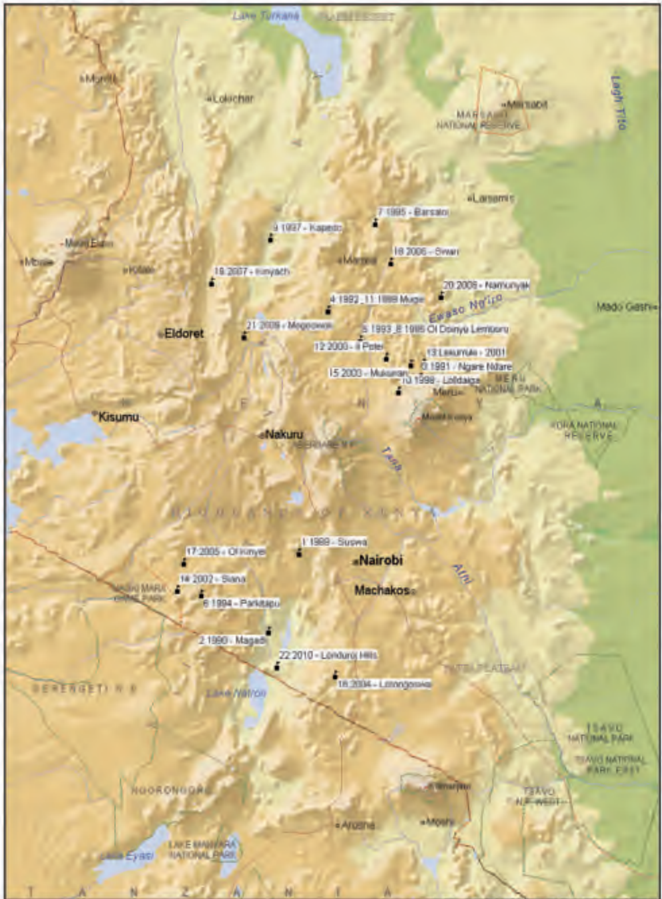
ENCARTA 97 Rhino Charge Locations Kenya