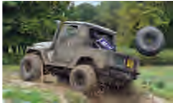
Spot the flying tyre

At the end of the day us 3 girls 'the misses' won 'Spirit of the Charge' for good competitive attitudes and helping other cars out of sticky situations. Overall our team managed to raise the second highest sponsorship for Rhino Ark, the most important part