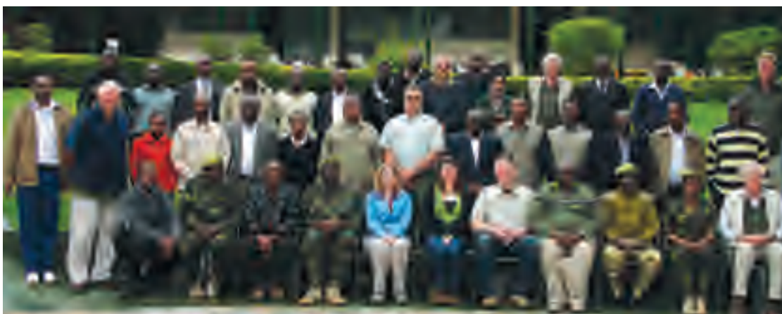
Participants of the Bongo Task Force workshop held in July 2010, sponsored by Woburn Safari Park and launched by KWS Director, Julius Kipng'etich (centre).

An appeal is made to all to continue with the efforts to bring stability to the forest ecosystems that remain vital 'water towers' so as to ensure the survival of these magnificent creatures.