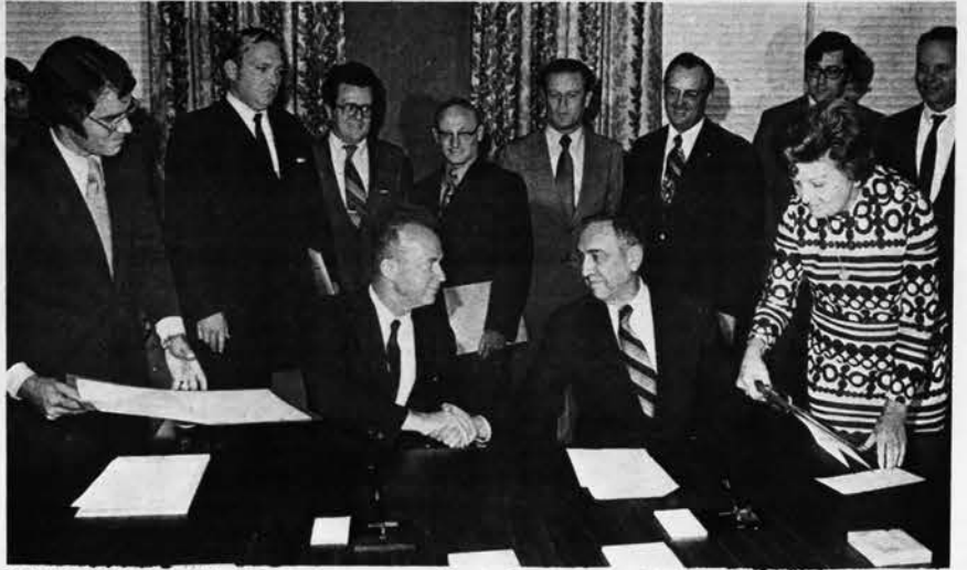
SIGN LAW 480: The United States Department of Agriculture announced last week the signing of a Public Law 480 agreement with Israel providing for the sale of $62.5 million worth of U.S. feedgrains, wheat and/or flour, edible vegetable oil and tobacco. Participating in the signing ceremony at the U.S. Department of State in Washington were Ambassador Yitzhak of Israel and U.S. Assistant Secretary of State Joseph J. Sisco.